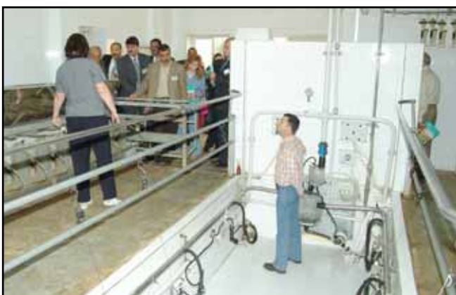
Small ruminants milking parlour