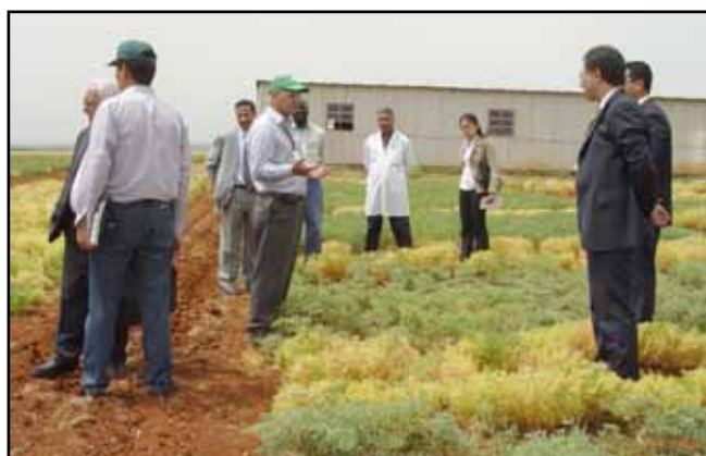
Lentil wilt screening nursery