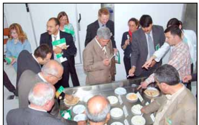
Dairy Products Laboratory