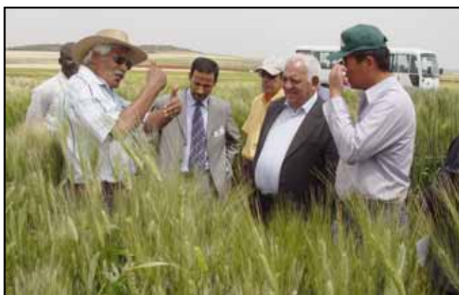
Cereal pathology nursery