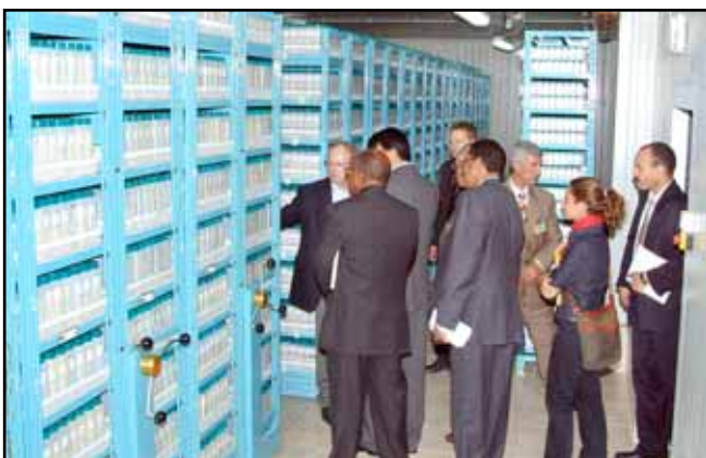
The Gene Bank