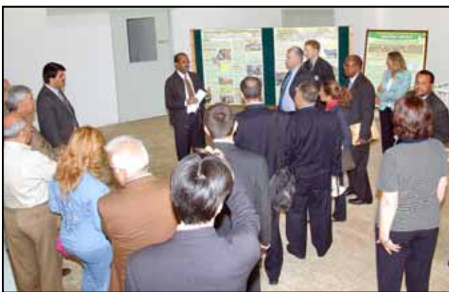
Discussion on poverty and livelihood research