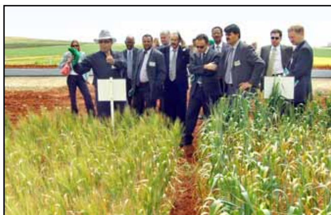
Durum wheat improvement field trials