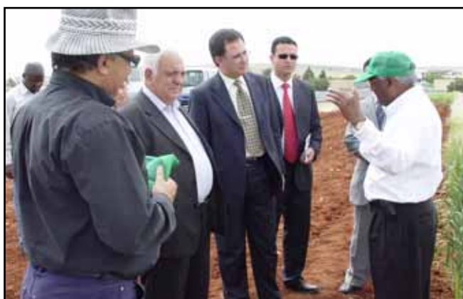
Cereal crop improvement demonstration