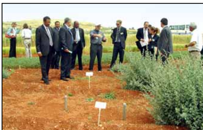
Water harvesting demonstration