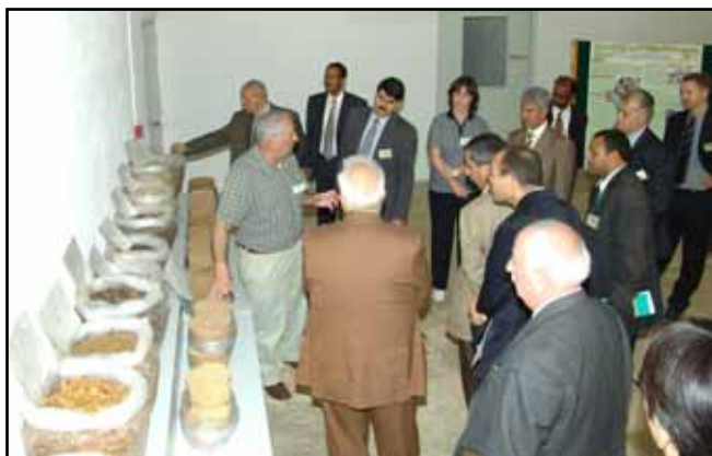
Agribusiness by-products for making feed blocks