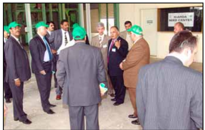
The Seed Center