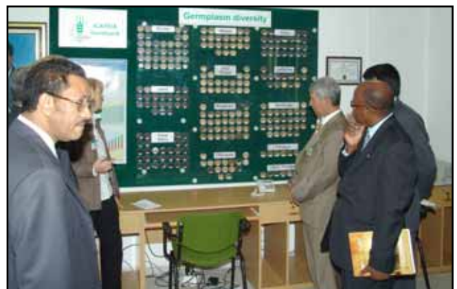
Diversity in ICARDA's mandate crops