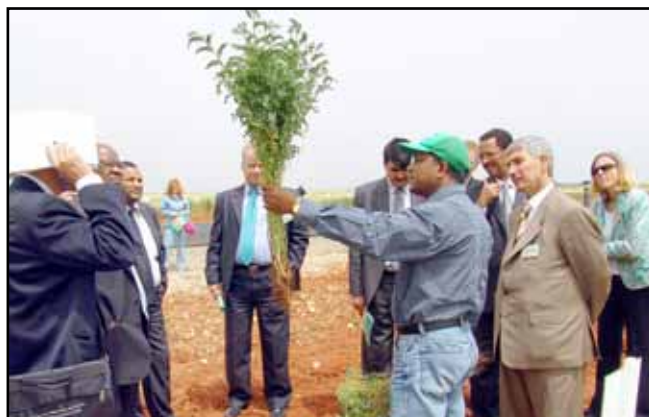
Food legume improvement