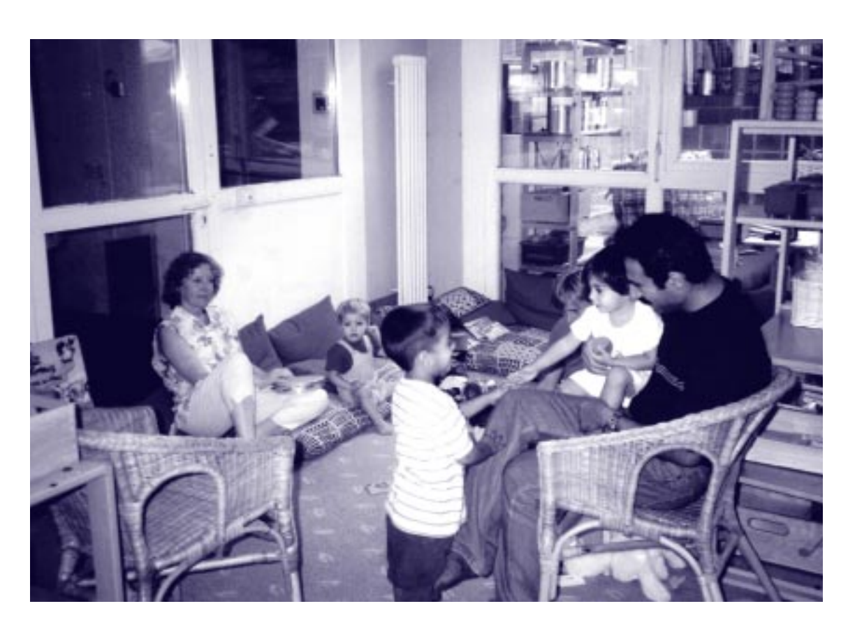
Turkish dad with his daughter during her familiarisation.

Individual one-on-one conversations about the children and their family situations take place during the familiarisation process, when the parent is accompanying the child in the centre. We learn everything about the children's likes and dislikes, their mannerisms, but also about their sleeping habits. It is important to us to show the parents that we want to give their children as much personalised care as possible. Naturally the Turkish speaking educators take on the familiarisation of children whose mother tongue is Turkish, in order to begin bridgebuilding in the children's trusted language as well.