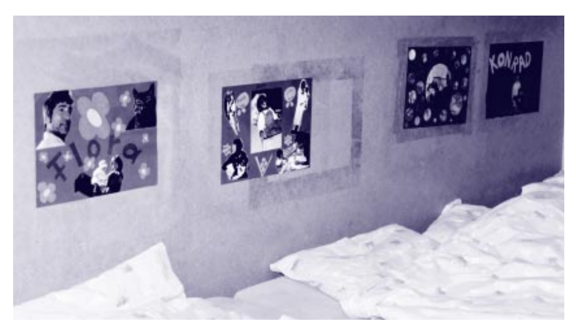
Family pictures next to the places where the younger children sleep.

Designing and rearranging the rooms means building bridges for each child: bridges that gently but steadily guide the children from their homes into the childcare centre. Everyday items that are familiar in their culture and well-known to the children are integrated into the rooms. This includes areas for role-playing and dolls. The kitchen of one group is equipped with a Turkish semaver , a tea urn, and an Italian caffettiera , coffee maker. Thus the children recognise what they know from home and the relationship they have with it. Cushions and carpets, which are popular with many Turkish