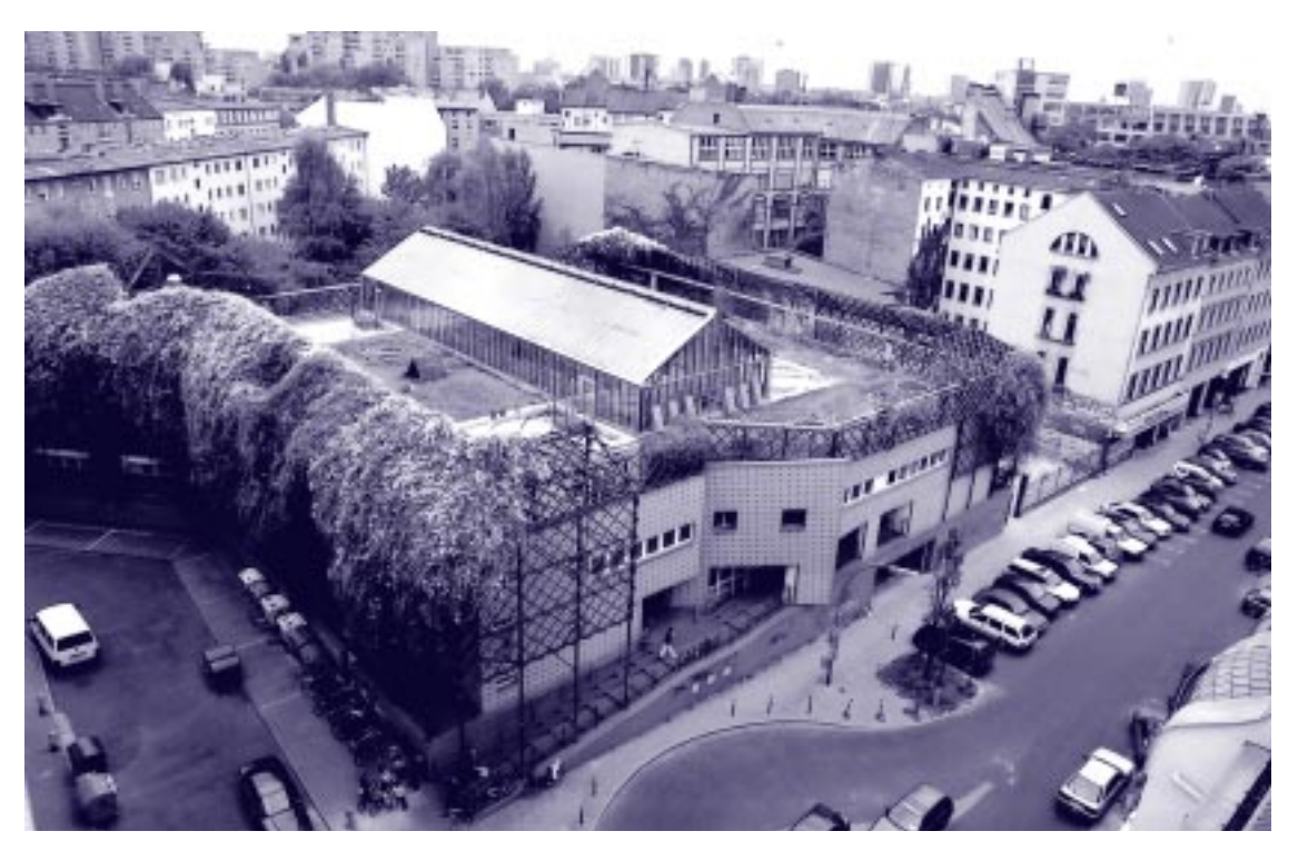
Aerial photo of the building.

Kreuzberg is a working class district in the centre of the city: a 'colourful' district with a high percentage of immigrants. Every third inhabitant is born with a nationality other than the German nationality. It is a district where one third of the residents have either completed their university degrees or are still studying, and one third have either limited or incomplete school education; a district where unemployment is substantially higher than in other districts of