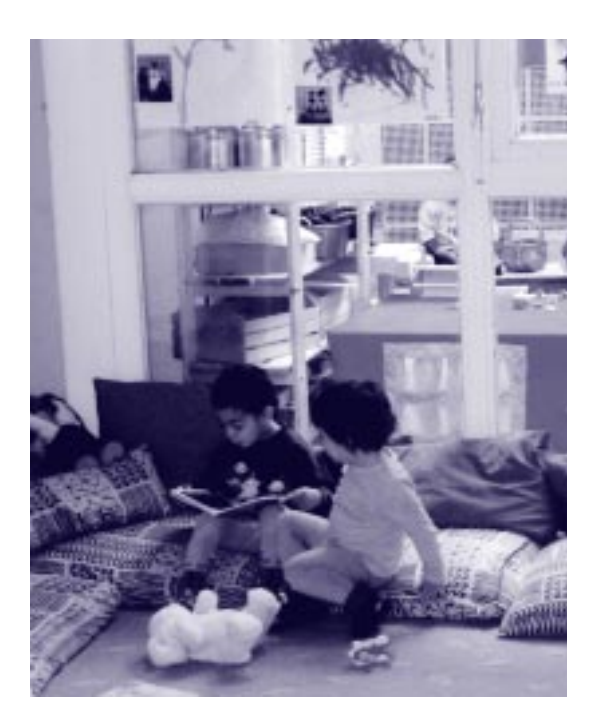
The centre has a bright and transparent interior.

This is then followed by a process that is always captivating, although it does not always run smoothly. First of all, the educators discuss which items they will take with them from the old to the new group rooms. Although the children are excited about moving into new rooms as they grow older, at the same time it is very important that they recognise familiar items in the new rooms. It is discussed with the children which things should be left behind or