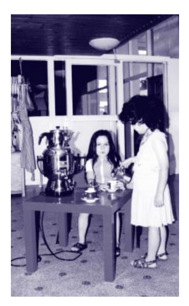
Role-playing corner.

speaking families, are very suitable for making quiet corners. Certainly not everything is authentic, but this also applies to a lot of what we call 'German'. This variety can also be observed in our team with educators coming from various regions and being of different origins. We simply consider it absolutely necessary not to convey stereotypes, but to clearly express and accept cultural differences.