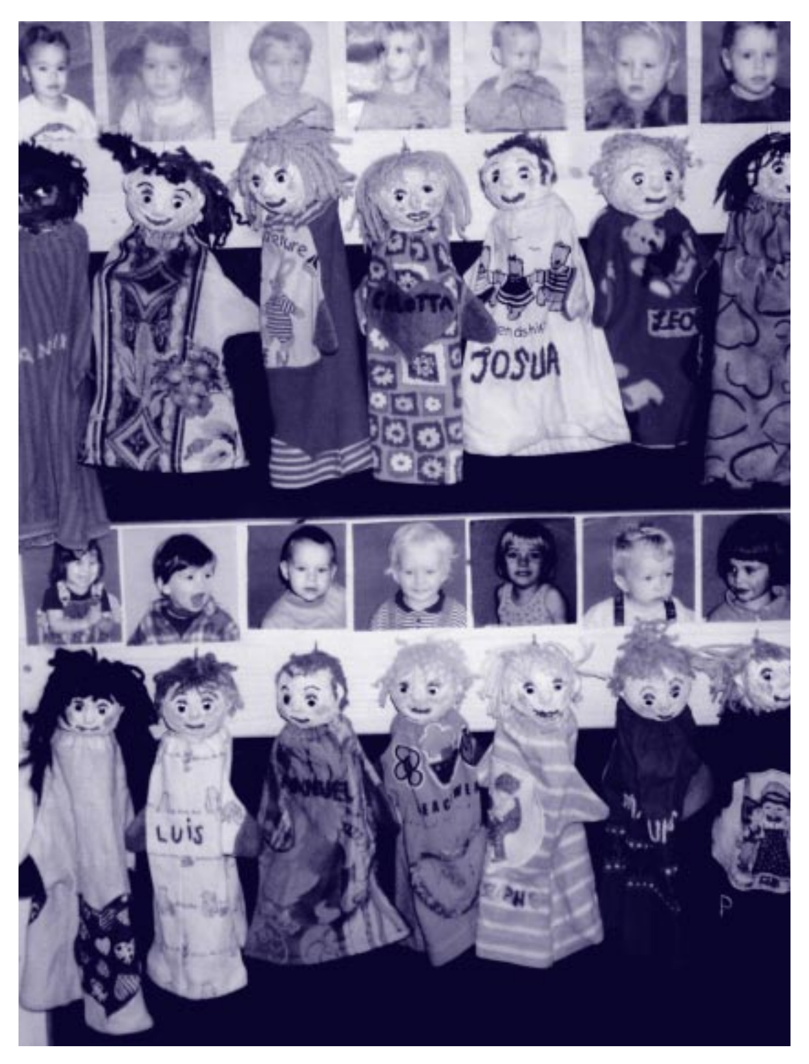
Personal puppets and photos of the children they belong to.