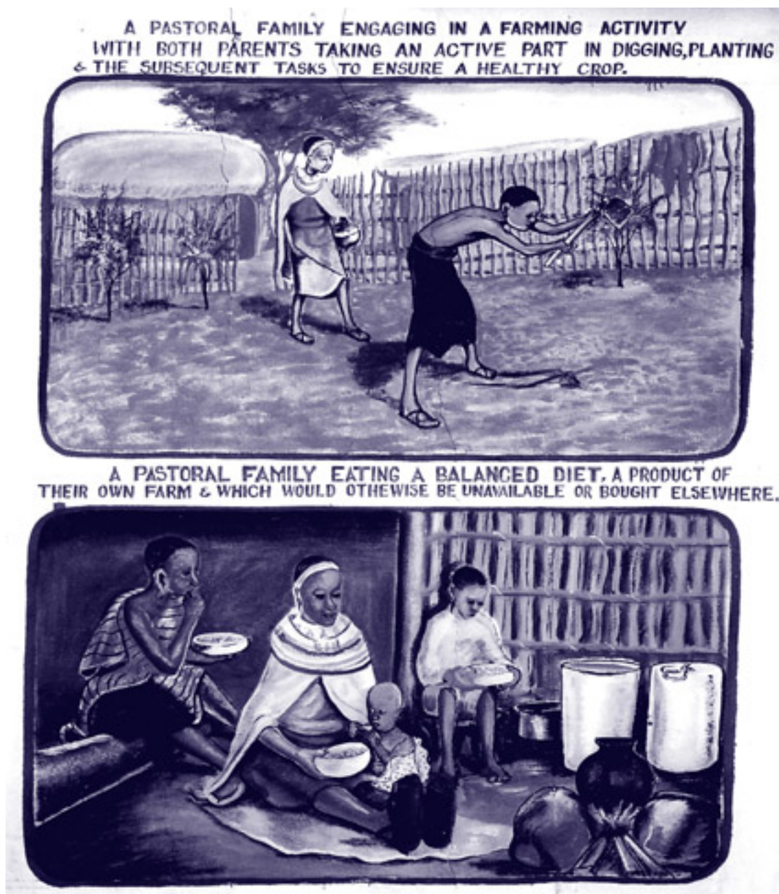
Photo: All the walls of El-barta's premises are covered in murals. The drawings here depict the benefits to the family's nutritional status of growing vegetables. Photo by Joanna Bouma.

crops. It is understandably those families with small livestock herds that are eager to try the crop farming as they are the ones who have the most to gain. The focus groups identify one person who receives training on crop