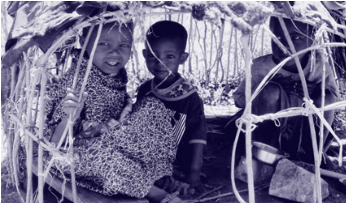
Photo: Children playing 'house' in one of the Lmwates . Photo by Tanja van de Linde.

The Lmwate have had a significant impact on the health of children. They act as the community resource centres where – apart from being the place where parental training sessions are held, and early stimulation materials are developed – activities such as supplementary feeding, deworming and growth monitoring are carried out. One result has been that many