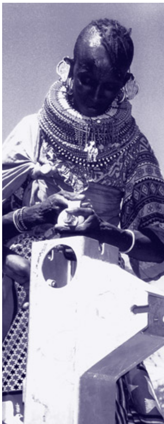
Photo: Protected water wells have been built in a number of locations in the area, giving families access to safe drinking water. The wells are managed and maintained by the women who form committees.