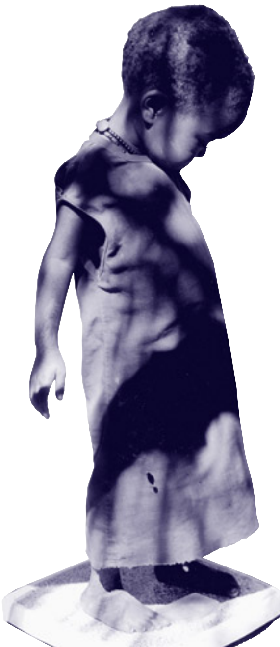
Photo: Growth monitoring is done regularly in the Lmwate .

The growth monitoring helps us identify children who are suffering from malnutrition. Children are so susceptible to malnutrition that even a slight deficiency in their diet will have an effect. Traditionally, the Samburu and the Turkana had their own diet for children, which included milk, ghee, animal fat, grilled meat and fruit sap. But with the current socio-economic changes, these foods are either no longer used or at times are simply unavailable. The focus group nutrition representatives encourage the communities to revitalise these traditional foods for children. Every month each focus group monitors the growth of the children aged up to five years under their