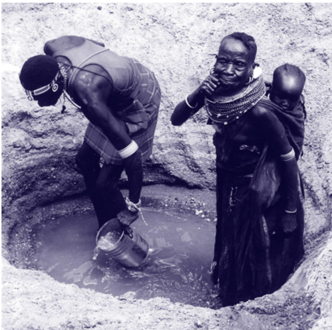
Photo: Women often have to walk long distances to fetch water for their families, sometimes waiting for hours for the livestock to finish drinking. Young children are either brought along, as is the case of this grandmother, or remain at home in the care of siblings.

In our work with child health, we look beyond the child in isolation and look to the entire family, with a particular focus on the mother. As foetal health is so important, we look at the child and mother before and after birth. We work on immunising mothers, training traditional birth attendants and stimulating good childcare practices. As in all El-barta