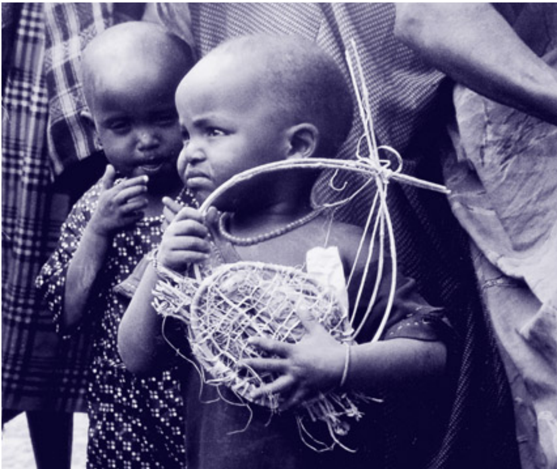
Photo: Children playing with traditional toys made from materials found in the surroundings.

of families who cultivate kitchen gardens, and a commensurate improvement in nutrition and health, especially of children. The crops grown include beans and green leafy vegetables. Many of these families are now able to store part of their harvest for the next season, and this has eased the pressure on families in their efforts to provide food for the family. The impact of a more diverse diet on the children is already visible. Their general health is better; there is less incidence of eye and skin problems; and, of course, a reduction in malnutrition.