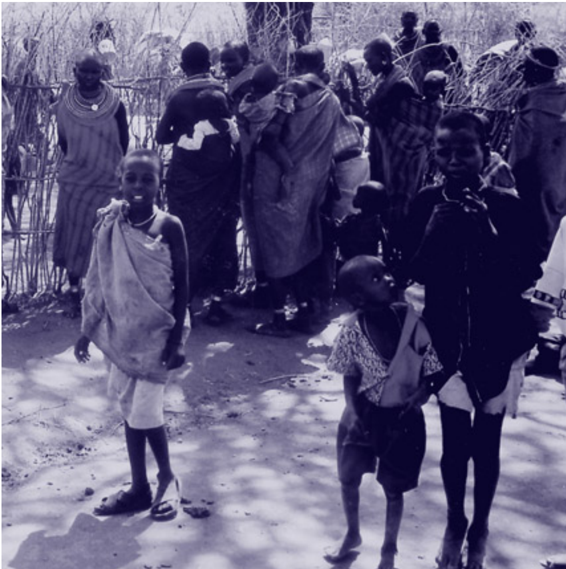
Photo above and right: Parents and older siblings gather at one of the Lmwate to collect their young children and brothers and sisters.

Poverty is widespread and is breaking down some of the traditional practices. Poverty puts a lot of pressure on parents and children, to the extent that the adults do not have the energy for interacting with their children or for story telling in the evenings; and the children, often lethargic from hunger, are too tired to go out and play. On top of this, scarcity often means