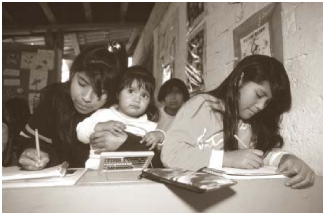
Mexico project: CIDES

Thematic Programmes explore one specific topic – for example, Young Children Affected by HIV/AIDS; Respect for Diversity; or Growing up in Indigenous Societies. Themes do not relate to national contexts but to key areas of interest across borders. This means that Thematic Programmes may occasionally include countries that are not otherwise eligible for funding. Within these programmes, the Foundation invests in activities that will inform its understandings and highlight key programmatic experiences.