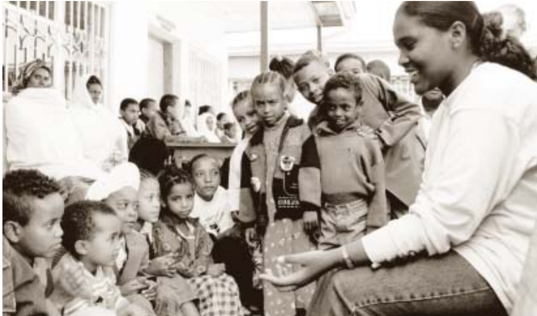
Ethiopia: Storytelling is one way we tried to communicate messages about positive living to the orphans. Here a volunteer is telling the children a story about sharing burdens during a caregiver / orphan gathering.

in Thailand, the situation is compounded by widespread drug use, which also eats away at responsive parenting.