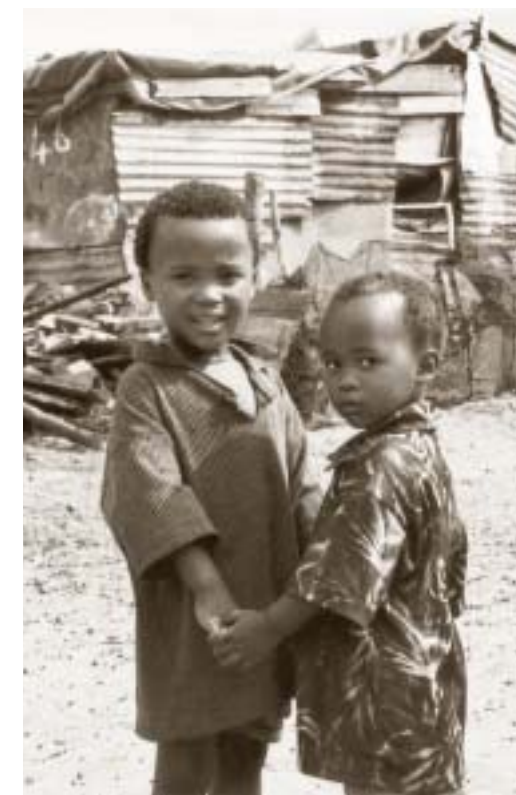
South Africa: Boys from Witsands informal settlement, Cape Town project: FCW

Thus there has been much progress. But we should also look critically at where early childhood stands as an issue today, identify the gaps, and pledge ourselves to redouble our efforts. The three areas of focus are Education for All, the Millennium Development Goals, and children's rights.