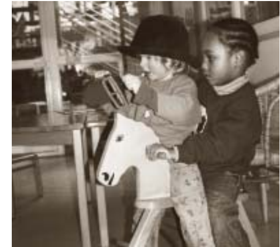
Germany: boy and girl in the centre on a rocking horse project: Childcare Centre 'Dresdnerstrasse' Berlin

Project title: Children Thirsty to Learn Partner organisation(s): SCHEDIA, Centre of Artistic and Pedagogical Training Location of project: Metaxourghio Grant: EUR 26,000 Overall objective(s): To publish the findings and the methodology used in the Metaxourghio area for work with Roma (gypsy) children. This publication, which will be in English and Greek, aims to be a significant resource for practitioners and researchers in working with marginalised children and fits within the thematic approach 'Respect for Diversity'.