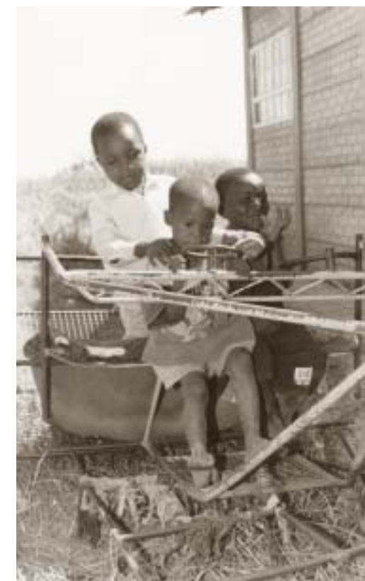
Zimbabwe: Make believe play by using broken climbing frame as a car at Dzivarasekwa extension project

Overall objective(s): To develop an appropriate intervention programme which addresses the needs of the 0 to 8 age group within KIWAKKUKI's existing community and home-based care programme.