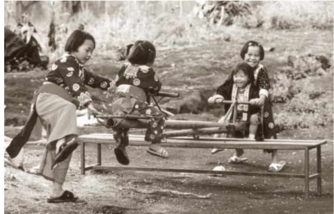
Thailand: Children having fun on a see-saw project: IMPECT

To ground the work of the Initiative, we identified a range of the most important themes and lessons that have emerged over the years from our collaboration with indigenous project partners; through a week-long consultation with indigenous practitioners; through participation in international forums; through discussions with peer organisations, and through monitoring of, and reflection on, the experiences of the projects that we have funded over the years. Four main themes emerged as