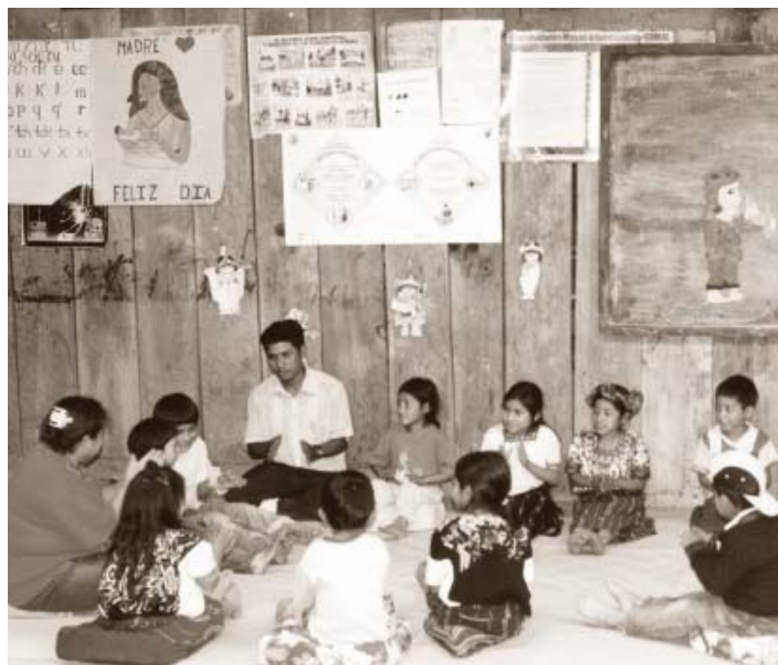
Guatemala: Maya-Ixil preschool children in Sumalito, Nebaj project: Niños Indígenas Desplazados

An overview of earmarkings by country for the period 2000 – 2002 is set out in Table 1.