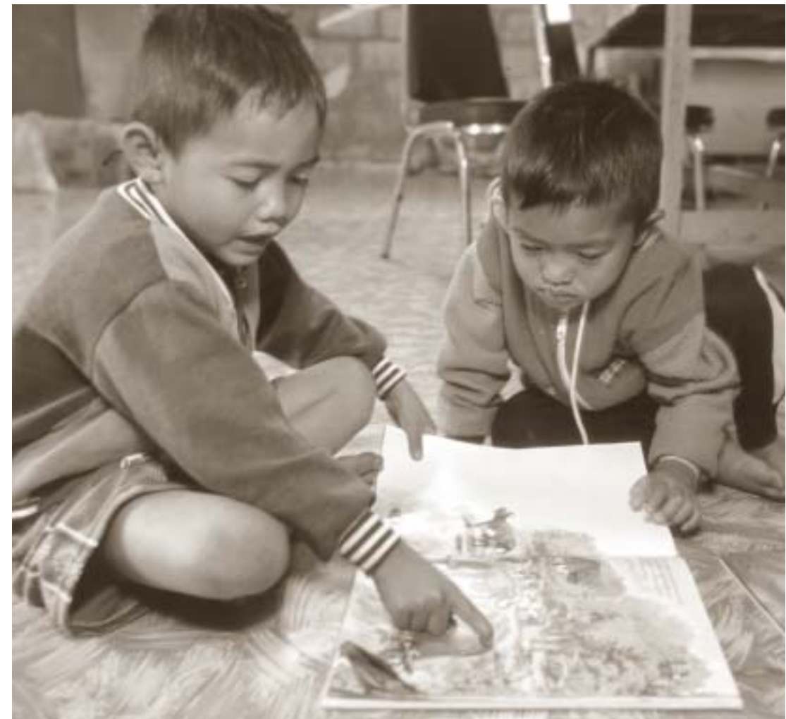
Thailand: A preschool class enjoys the library in a reading session project: Tai Wisdom Association

Such approaches, the competencies that help them to work, the accumulation of knowledge that informs them, and the love of children that underpins them, are key. But they are not enough. We also have to ensure that early childhood development achieves much greater priority worldwide, given the many quantifiable and unquantifiable benefits that accrue for young children, their families, communities and societies. The Foundation is therefore committing itself to taking an important and catalytic role in helping to put early childhood development emphatically on the world's agenda, and in keeping it there.