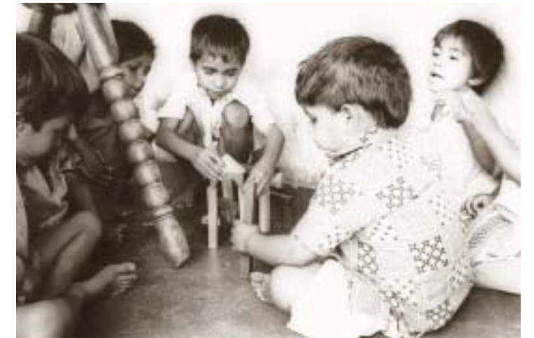
India: Children playing with blocks project: SEWA

Project title: Enhancing preschool teachers' capacities Partner organisation(s): Child Development Initiative Location of project: Selangor Grant: EUR 7,800 Overall objective(s): To enhance the capacities of preschool teachers through training, supervision and providing resource materials and, as a result to help develop confident and resourceful children who will be able to fit into the mainstream of education in the country.