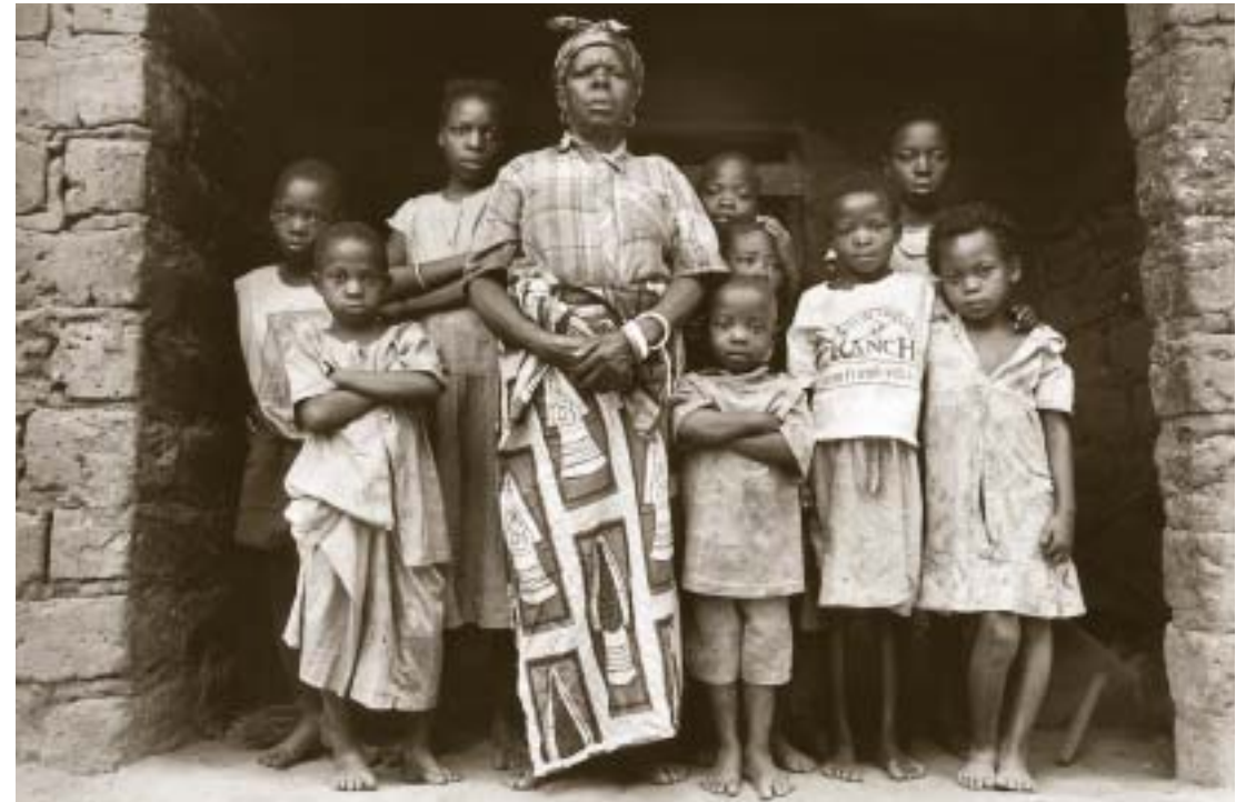
Zambia, Copperbelt. Orphans, the extended family is at breaking point as a result of the number of AIDS deaths.

During 2002, the Foundation therefore completed much of the development of a draft multi-year Young Children and HIV/AIDS Initiative, a focused commitment to work on preventing and alleviating the particular impact of HIV/AIDS on young children, their families and communities. The Initiative builds on almost ten years of investment by the Foundation in young children and HIV/AIDS projects, as well as on the outcomes of a consultation with 32 organisations from 11 countries in Africa, Asia, Europe, and the USA. The outcomes of this consultation were embedded in the Durban Protocol, a set of guiding principles and lines of action that focused on preventing and alleviating the