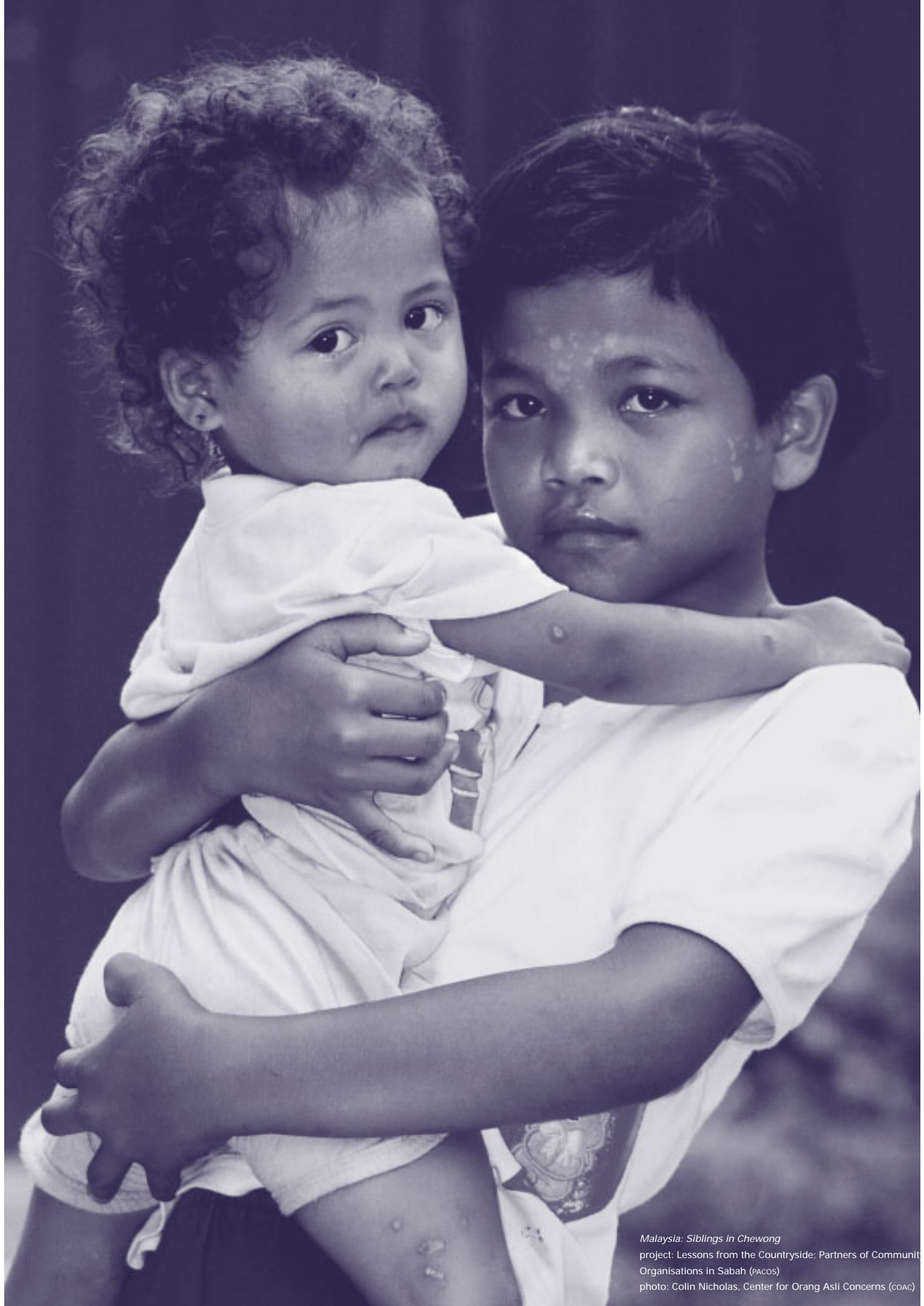
Malaysia: Siblings in Chewong project: Lessons from the Countryside: Partners of Community Organisations in Sabah (PACOS)