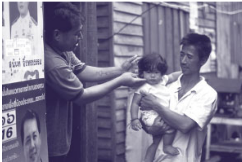
Bangkok, Thailand: Nong, 36, and Tung nine months project: My Babies Second Home; Foundation for Slum Child Care (fsc)

The total spending by the Foundation in 2001 amounted to EUR 19.3 million, of which more than 90% came from the Van Leer Group Foundation. The following co-funders channeled a total of EUR 369,800 through the Foundation to support work with young children: Verhagen Foundation (Netherlands); Fonds 1818 (Netherlands); Stichting Klein Hofwijck (Netherlands); The Franciscus O Fund (Belgium) managed by the King Baudouin Foundation; and the Rich Foundation (Israel).