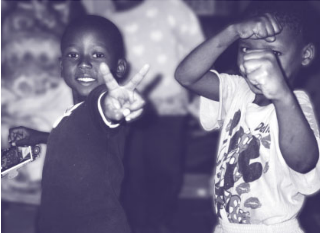
South Africa: Enthusiasm at the Community ECD Centre project: Rethinking Educare; Association for Training and Resources in Early Education (TREE)