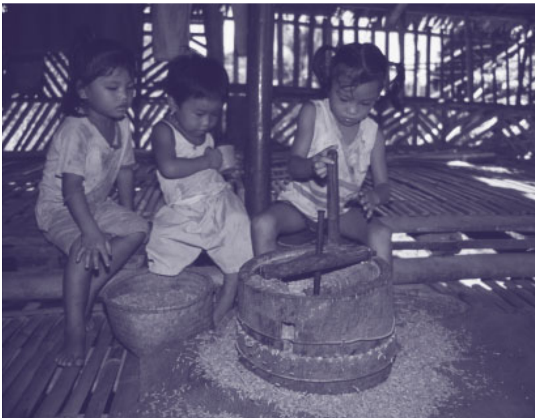
Malaysia: Threshing padi

project: Lessons from the Countryside; Partners of Community Organisations in Sabah (PACOS)