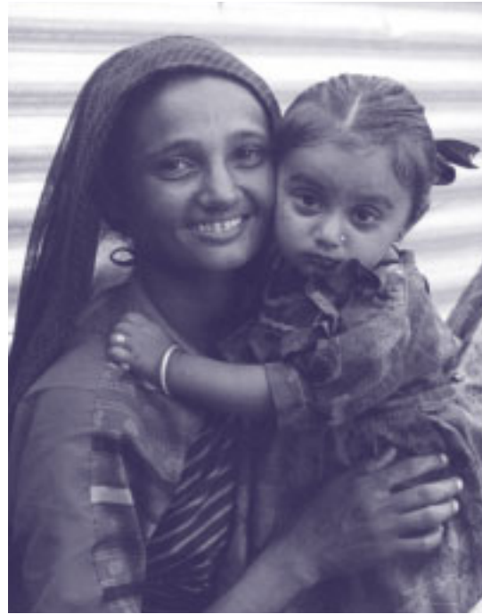
Gujarat, India: A mother and children helped in rebuilding and rehabilitation after the 2001 earthquake by VHAI teams project: Earthquake Relief, Voluntary Health Association of India (VHAI)

For a programme of work to strengthen the TN-FORCES network for child survival and development that operates in Tamil Nadu State. TN-FORCES is part of the FORCES national network (see entry below). It has gathered 105 members – comprised of NGOs, public