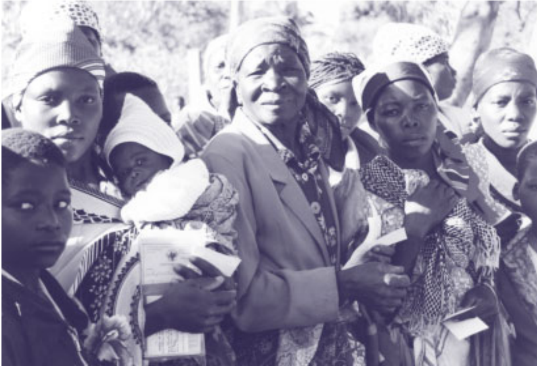
Mozambique: Child rights – mothers and children stand in line to be registered