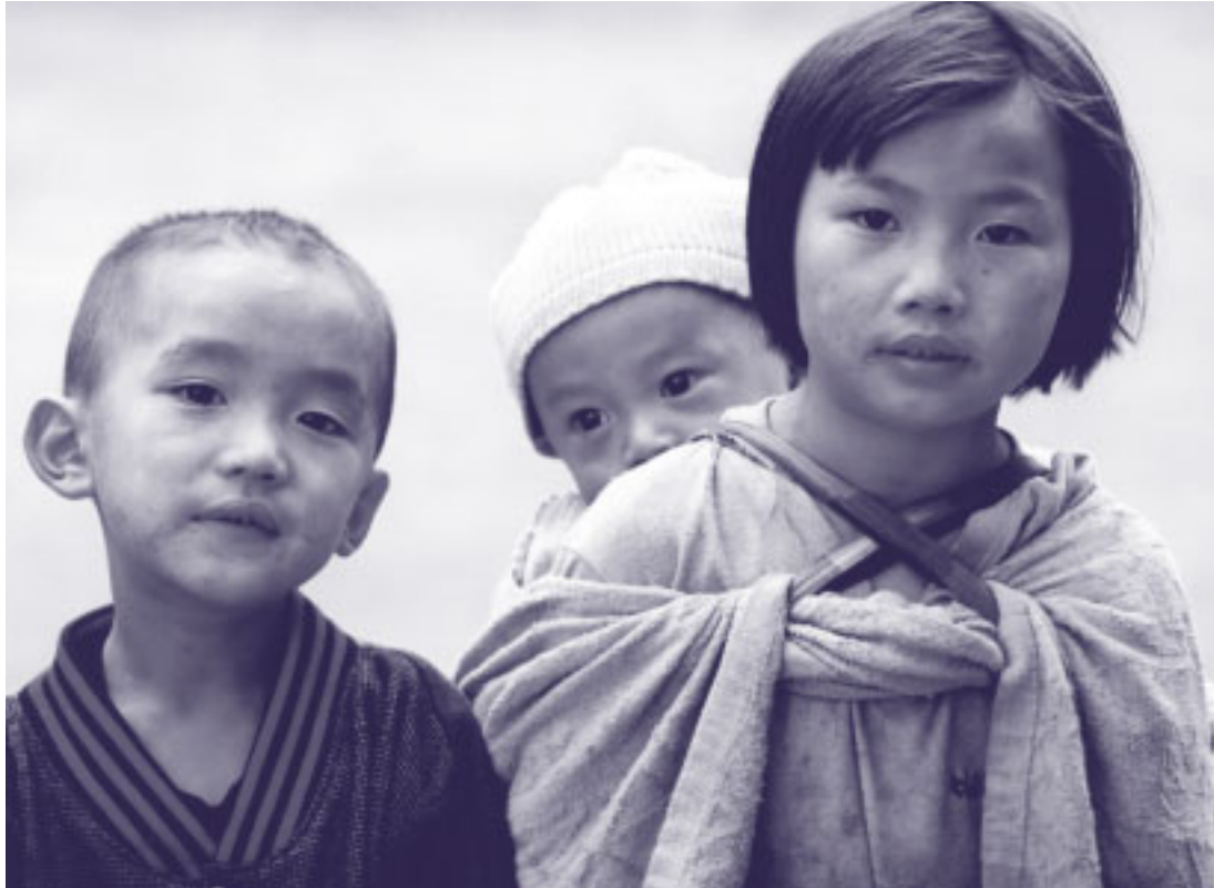
Thailand: Hmong children taking care of younger siblings project: Footholds in the Hills; Inter Mountain Peoples Education and Culture in Thailand Association (IMPECT)

teachers and community leaders in child development, leadership and cultural knowledge will be strengthened. Multi-media learning materials will be produced for children and parents. In addition, two workshops with academics, NGOs, government agencies and social groups will develop common strategies in supporting tribal children.