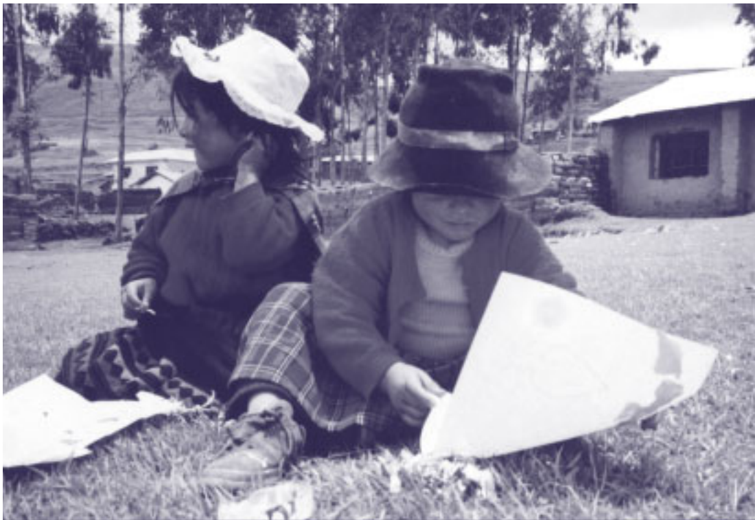
Peru: Girls from Huancavelica making a collage to stimulate creativity and fine motor development project: Instituto para la Investigación y el Desarrollo Económico y Social (INIDES)

among rural Quechua-speaking families. The project is an exercise in joint implementation involving three statutory stakeholders: PROMUDEH; MINEDUC ; and INABIF. Topics to be explored include male caring, fostering, nurturing and teaching of children, as well as the relationship between fathers and their children. The project will analyse the effectiveness of a multi-sectoral endeavour, helping to increase the impact of the field activities and reduce operational costs.