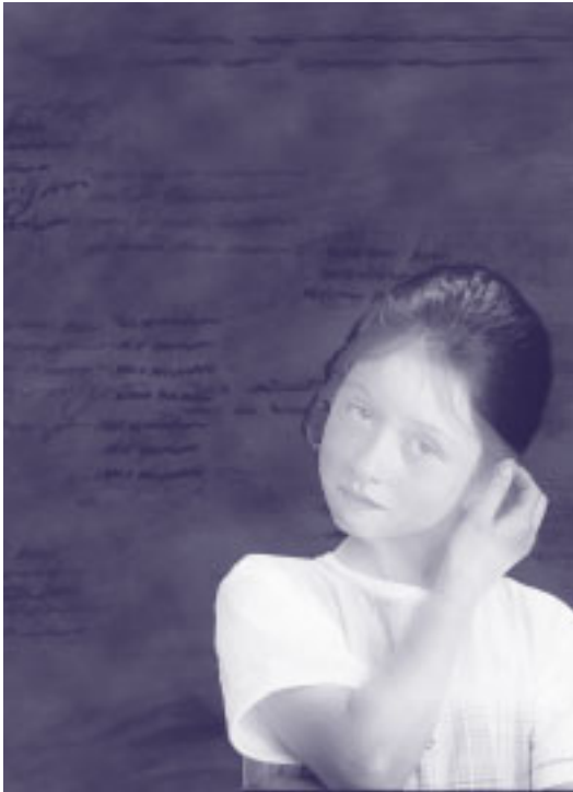
Netherlands: Young children's views project: Listening to young children; Wetenschappelijk Educatieve en Sociaal-Kulturele Projecten (WESP)