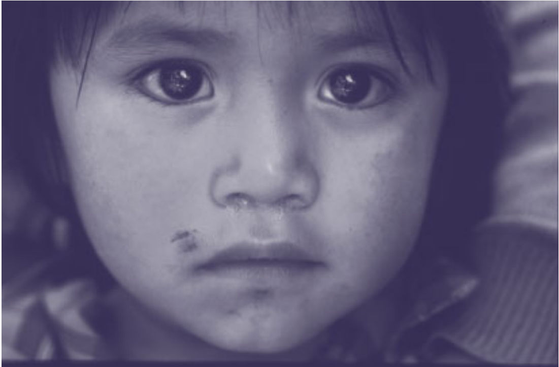
Mexico: Girl of the Otomie Community in Mexico City project: Centro Interdisciplinario para el Desarrollo Social (CIDES)