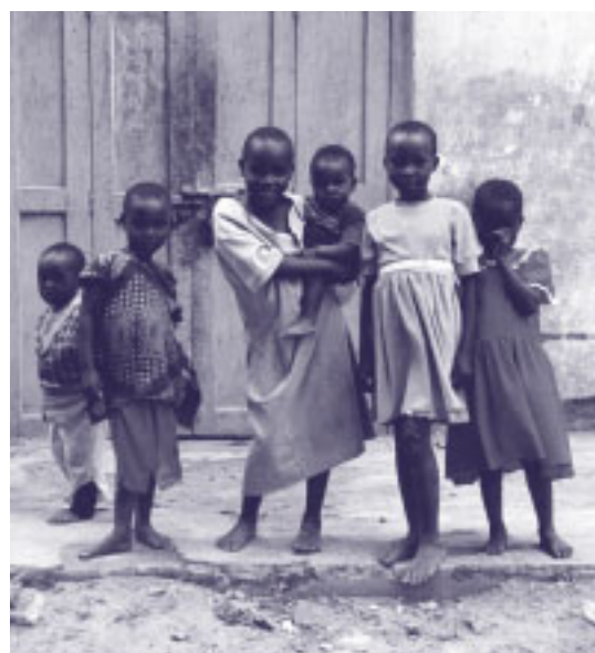
Busia District, Kenya: Fatherless children taking care of each other while their mothers attend a meeting on needs analysis project: Kenya Orphans and Rural Development Programme

For promoting the well-being of young children in Samburu District through interventions in health, nutrition, education and early stimulation. This will be based on participatory methodologies to identify the community's needs in planning and implementation. The project will build on the traditional childcare enclosures called loipi. These are enclosures located near the homesteads, where children play and rest while their parents are away. Grandparents and parents watch over and monitor the activities of the children, passing on Samburu values through story telling, songs and games, something that is under pressure due to factors such as poverty, insecurity, and ongoing conflict between modern and traditional lifestyles. The project will add modern approaches to education and to health – including health education for the parents, regular growth monitoring, immunisation, and supplementary