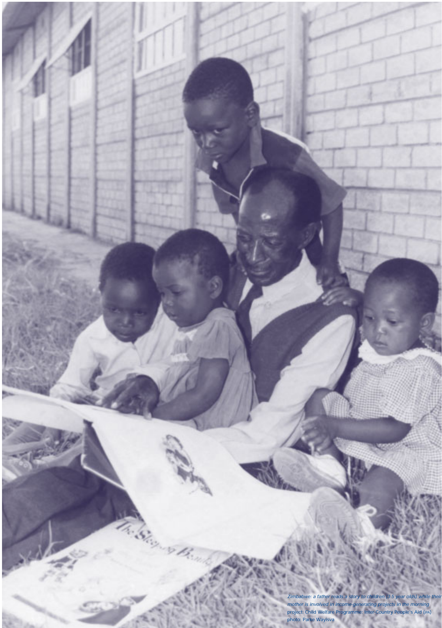
Zimbabwe: a father reads a story to children (3-5 year olds) while their mother is involved in income-generating projects in the morning project: Child Welfare Programme: Inter-Country People's Aid (IPA)