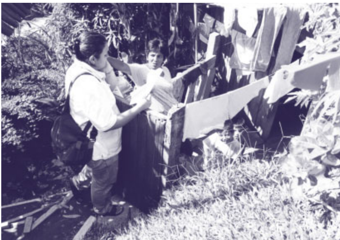
Caldas, Colombia: Visiting rural families

project: Infancia y Familia Rural; Fundación para el Desarrollo Integral del Menor y la Familia (FESCO)