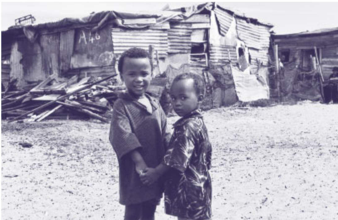
Cape Province, South Africa: Two boys who benefit from the activities of the Family in Focus project in the Witsands informal settlement project: Family in Focus (FIF) photo: Sarah Chasnovitz, Hine Fellow in FIF, 2001

Province, on what makes young children vulnerable and what undermines the capacity of families and communities to meet young children's needs.