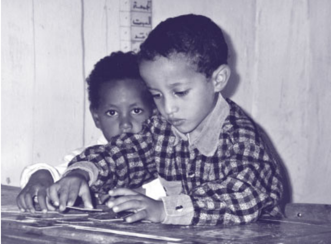
Errachidia, Morocco: Boys at preschool

Of course, such similarities fade as children get older and are more and more shaped by their different cultures. But the well-being of small children is a common ground and the barriers for understanding are probably lower than in most other matters. We should build on this, making early childhood a platform where international cooperation and exchange is much more intense and visible.