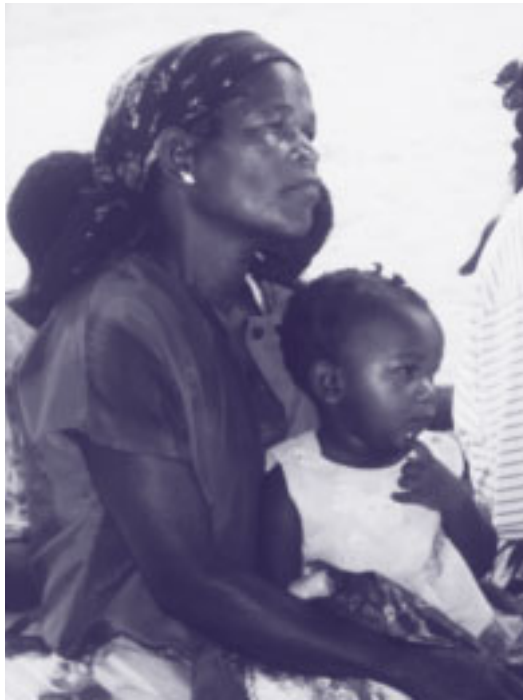
Mozambique: A grandmother listening to questions about transmission and symptoms of HIV/AIDS

project: A New Path for Children; Associação da Criança, Família y Desenvolvimento (CFD)