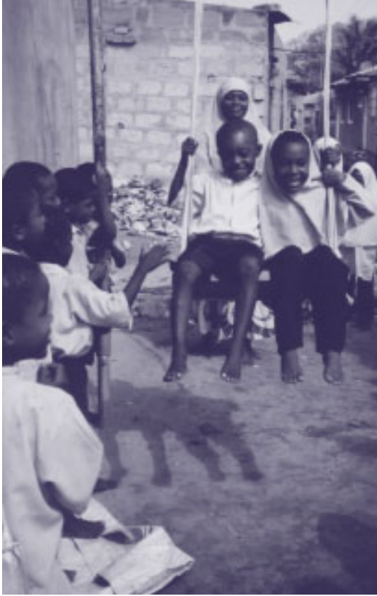
Zanzibar, Tanzania: Enjoying a swing project: Madrasa Preschool Programme; Madrasa Resource Centre

following principles to make the most effective use of the available resources: