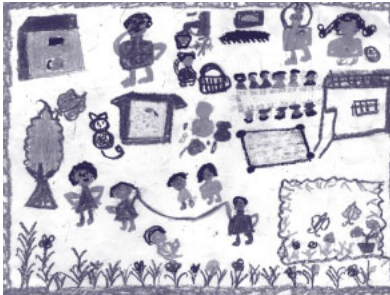
New Delhi, India: Drawing by Neelu, 8 years project: Who cares for children? Mobile Crèches

Thematic Programmes explore one specific topic – for example, Children Affected by HIV/AIDS; Respect for Diversity; or Growing up in Indigenous Societies. Themes do not relate to national contexts but to key areas of interests across borders. This means that Thematic Programmes may occasionally include countries that are not otherwise eligible for funding. Within these programmes, the Foundation invests in activities that will inform its understandings and highlight key programmatic experiences.