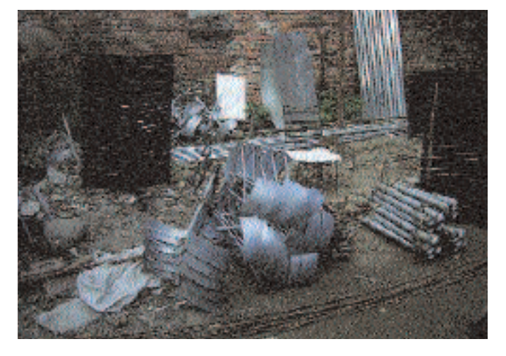
Biogas appliances produced by one of the 15 manufacturers in Nepal

Biogas production can also be installed in combination with sanitation. Public toilets incorporating biogas units are particularly suitable for peri-urban areas and small towns in India where the supply of cooking gas is inadequate and waste water treatment is unaffordable for the local authorities. According to Dr P.K. Jha from Sulabh International Social Service Organization,<sup>8</sup> his organization has constructed about 1.2 million household toilets and more than 6000 community toilet complexes. Yet only about 150 of these community complexes (2.5%) include a biogas digester. This is mainly because the local bodies that provide funding are normally not aware of the importance of biogas systems and opt out of habit for a septic tank system.