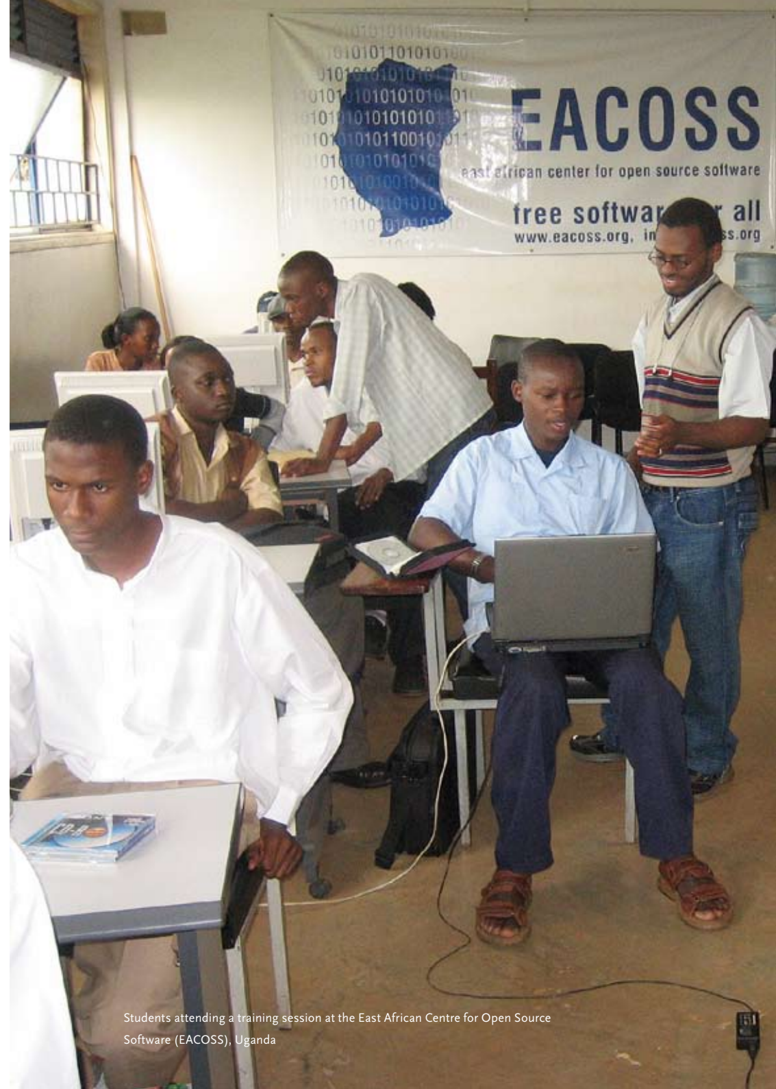
Students attending a training session at the East African Centre for Open Source Software (EACOSS), Uganda