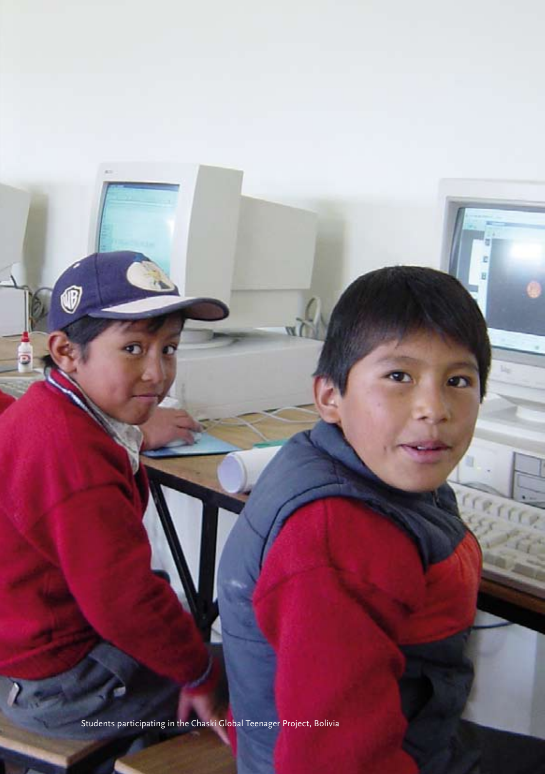
Students participating in the Chaski Global Teenager Project, Bolivia