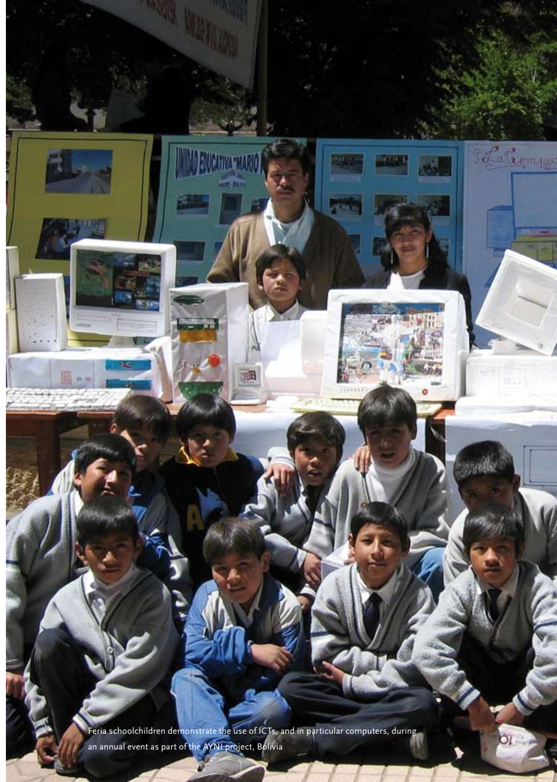
Feria schoolchildren demonstrate the use of ICTs, and in particular computers, during an annual event as part of the AYNi project, Bolivia