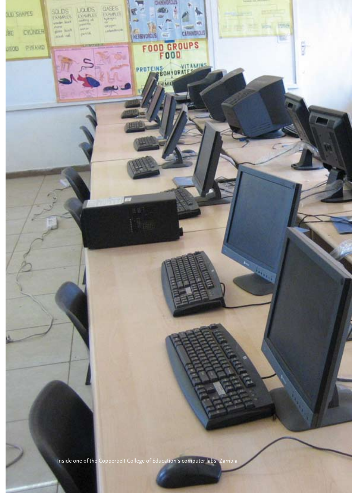
Inside one of the Copperbelt College of Education's computer labs, Zambia