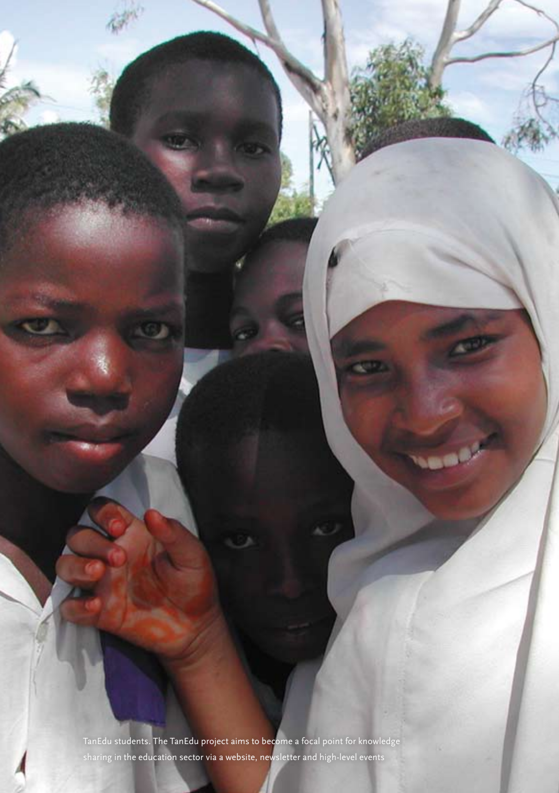
TanEdu students. The TanEdu project aims to become a focal point for knowledge sharing in the education sector via a website, newsletter and high-level events