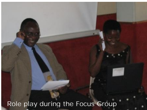
Role play during the Focus Group

The meeting was held in April, with 30 users from different departments and -this time- different levels: support staff, ICT staff and management attended the meeting, which used role play to facilitate dialogue. One group of end users and one group consisting of ICT staff members were both asked to prepare a small play on the issues concerning technical assistance. Each group had to address positive and negative aspects of the technical assistance and in both plays end users and ICT staff members had to be acted out. This motivated the participants to step in each other shoes and to take both points of view into consideration. Two other groups, both consisting of end users, made plays concerning organisational efficiency: Do ICTs really make the workplace more efficient?