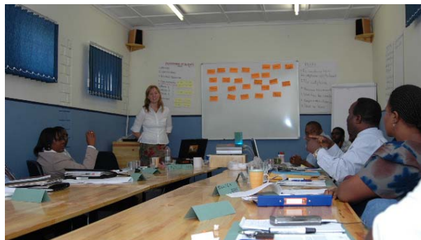
Data analysis and discussions during the Focus Group meeting

For information about IICD and Monitoring & Evaluation, visit www.iicd.org/evaluation or contact us at information@iicd.org . The online M&E system can be viewed at http://www.survey.iicd.org .