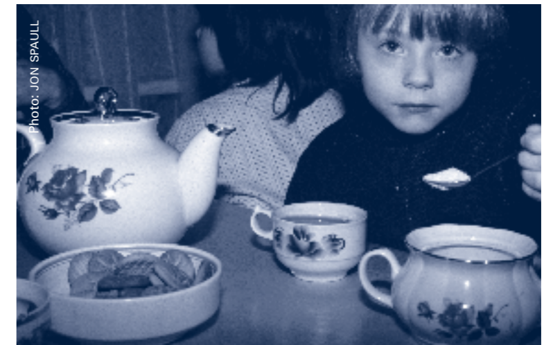
Girl living in a Moscow home for girls neglected or abused by their parents. In the absence of adequate health and social services for parents, children are likely to remain in institutional care for long periods of time.

The survey also showed that Central and Eastern European countries in transition spent less on institutional care per child compared with economically developed countries in Western Europe (with the exception of Portugal). Therefore conditions for a child in institutional care were