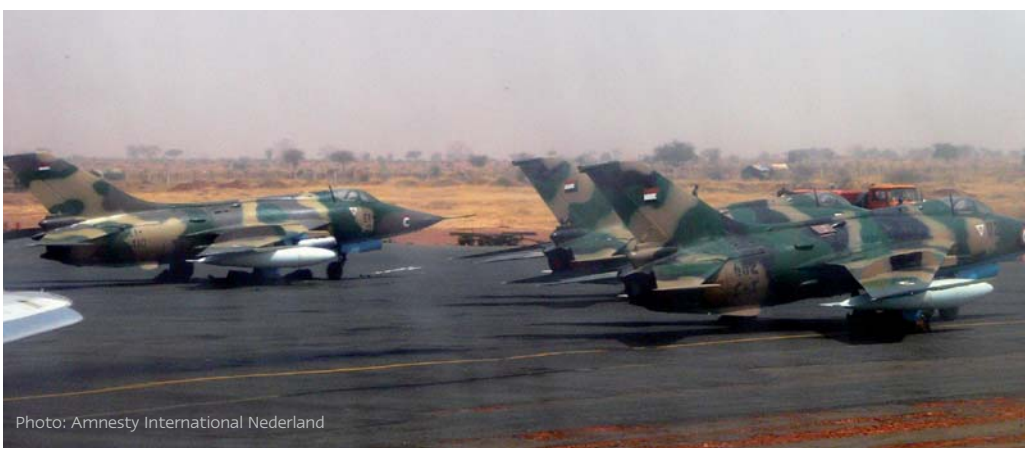
Chinese A5 Fantan jet bombers at Nyala, Darfur, Sudan, March 2007

Immigration and the politics of citizenship are hot issues. Sassen considers the complex subject of immigration as a window that provides new vistas on the growing