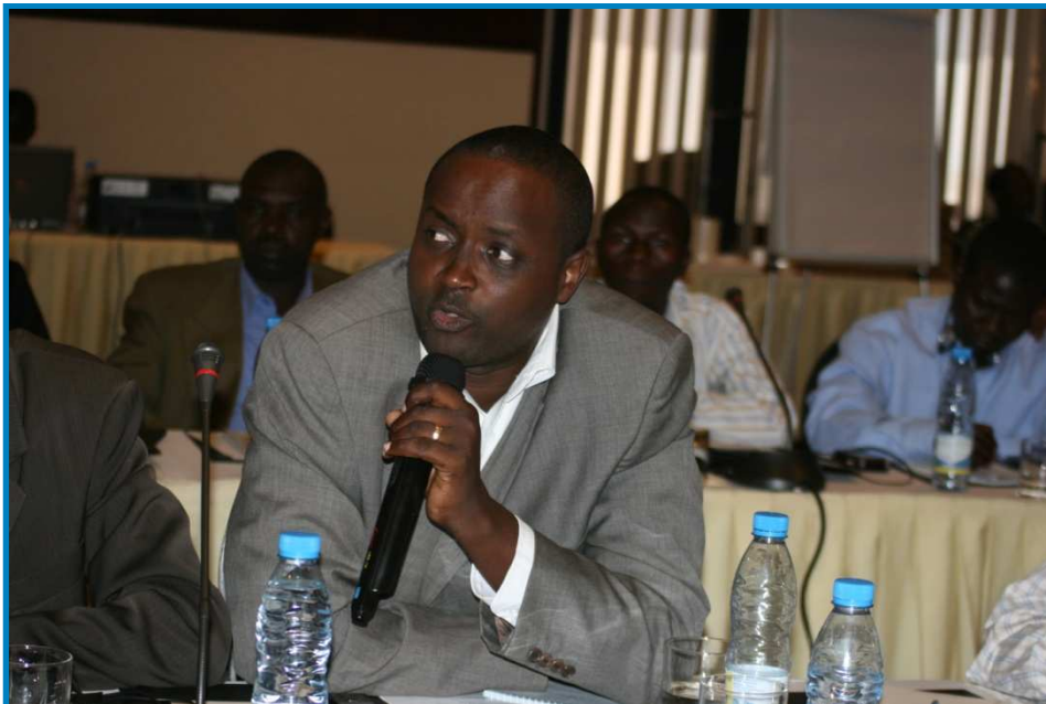
A participant makes his contribution during the conference

On water resource management, OTF discounted fears over water wastage in CWSs saying that the present coffee washing technology does not impact waywardly on the environment and ensures that there is minimal water that goes to waste and instead, much of it is recycled to the farms.