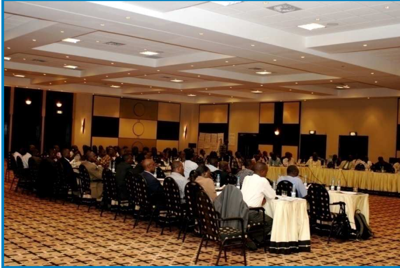
A cross-section of the participants

The participants took full advantage of an unusual opportunity for exhilarating collegial exchange and knowledge-sharing. Through the initiatives engendered, the participants hoped to build the field and encourage crucial research. In a word, they set to forge an interest group that will contribute to make the coffee sector valuable to all stakeholders and the society at large.