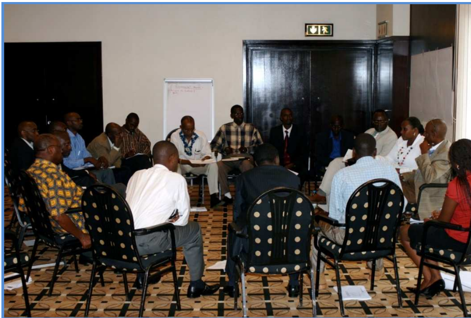
One of the working Groups during the conference

Groups provided a report on their respective themes, including recommendations derived from the presentations and discussions.