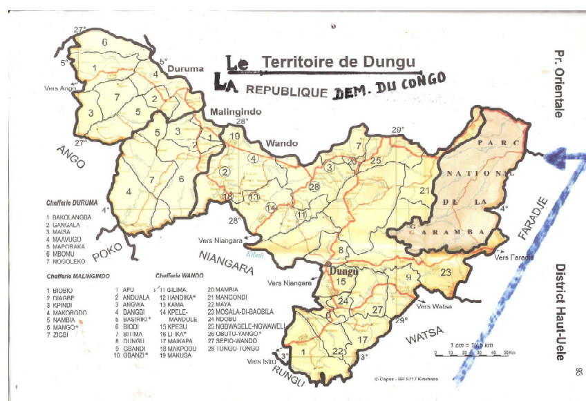
Figure 3: Dungu territory

Situated at 210 km from the town of Isiro, Dungu is one of the six territories that make up the District of Upper-Uélé (in the Eastern Province) 10 . This territory borders on the north on the Republic of Sudan (about 580 km border stretch) and the Central African Republic, to the east it borders on the territory of Faradje, to the west on the territory of Ango and Niangara and to the south it shares borders with the territories of Watsa and Rungu. Dungu counts a population of 224.586 inhabitants, covering a total geographical area of 32446 km 2 11 with a population density of 6,92 hab/km 2 12 . The territory of Dungu is inhabited by two major tribes, the Azande (making up more than 85%) and the Baka. Its local government is made up of 3 collectivities 13 . It should be noted that the Garamba National Park is situated in the Wando Collectivity and that it is in this Park that the LRA settled.