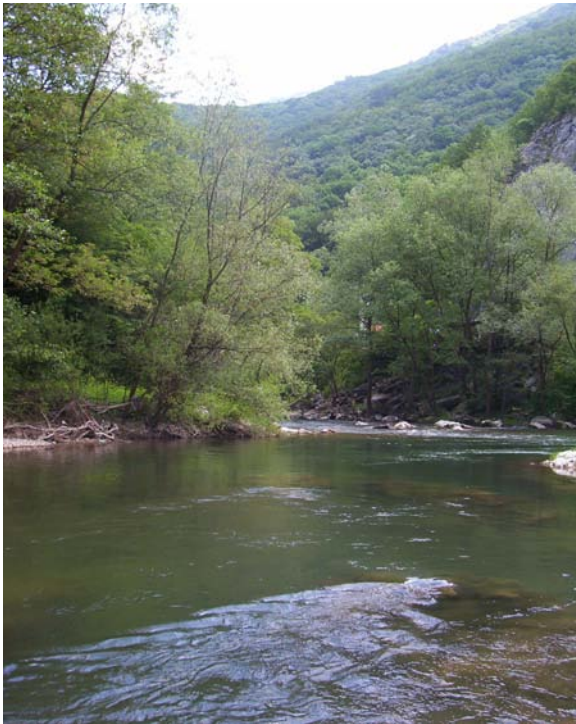
Surroundings of Bâile Herculane

Orsova can be very attractive to tourists with a special interest in nature. It has a famous monastery on top of a hill, which provides a splendid view on the surrounding nature. It also has beaches alongside the river, which provide some possibilities to enjoy water sports. Canoeing and making tours with small boats along the Danube River are two of these possibilities.