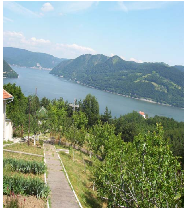
View on the scenery from the monastery of Orsova

Two cities which are located closely together are Closani and Pades. Closani has underground caves and aisles in an area of 20 square kilometres which are very impressive. It is also a good site for bird watching. Pades offers a variety of restaurants and bars to tourists. A curiosity is the monument for Vladimirescu. In general, this region is full of forests and mountains, which makes it attractive to environmental tourism.