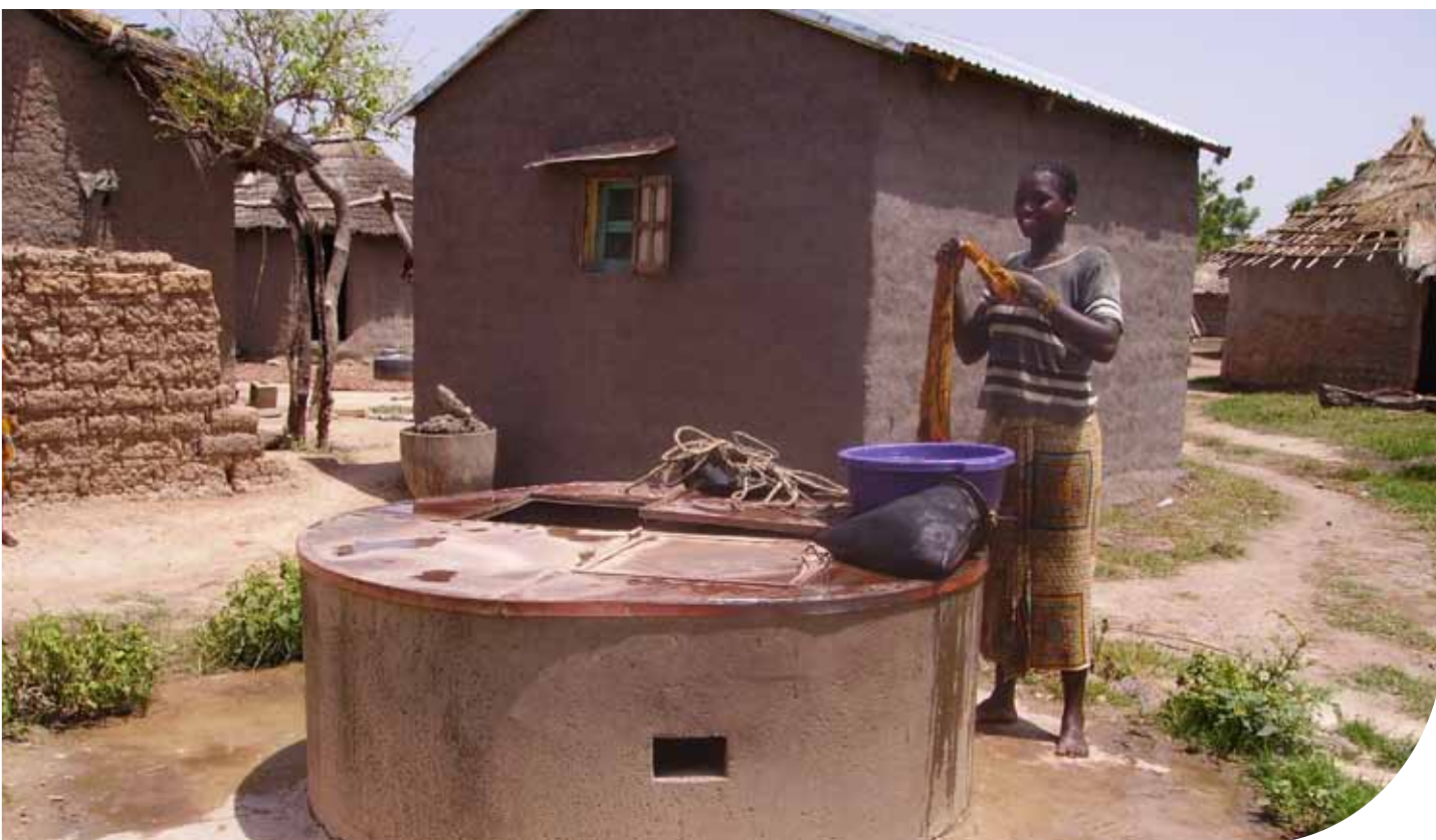
Good hygiene practice in the Mandé region.