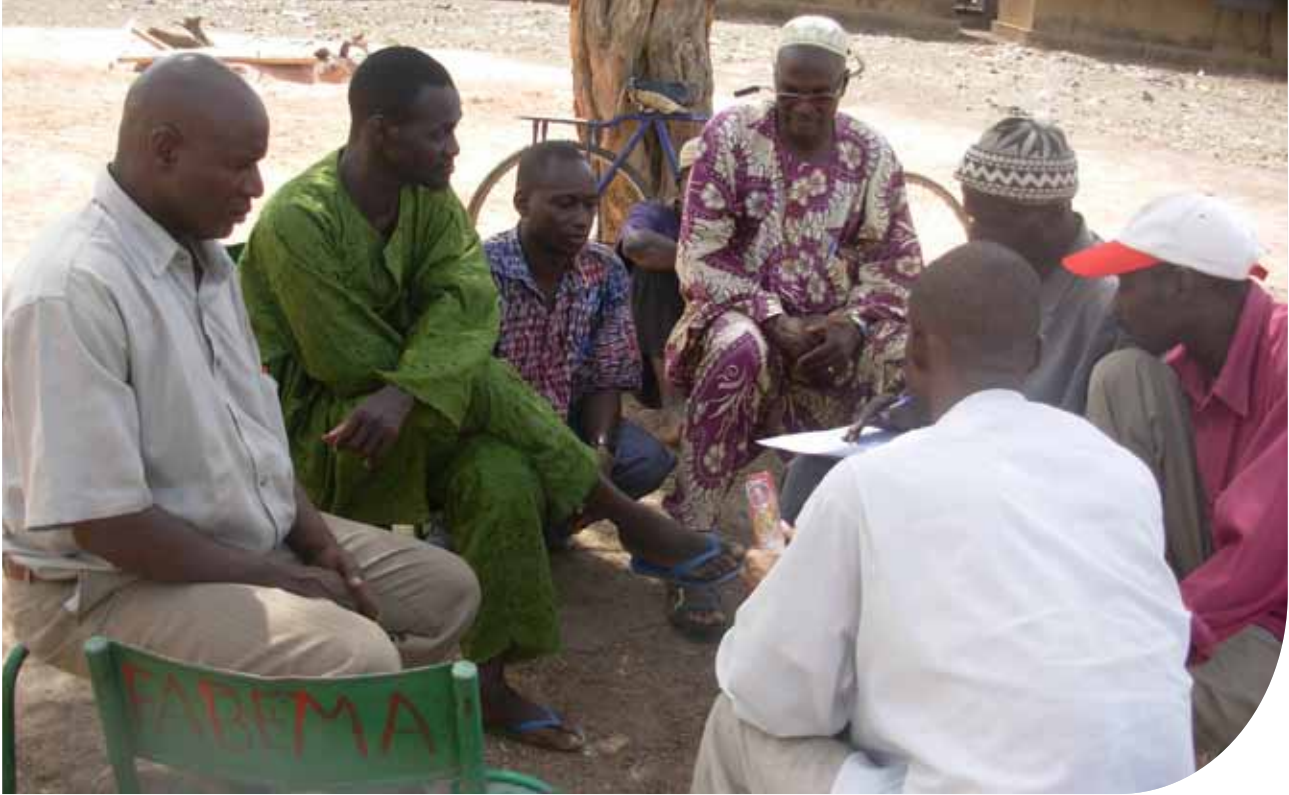
Project users at the 3AG-FABEMA Focus Group meeting in 2009 during a brainstorm session.