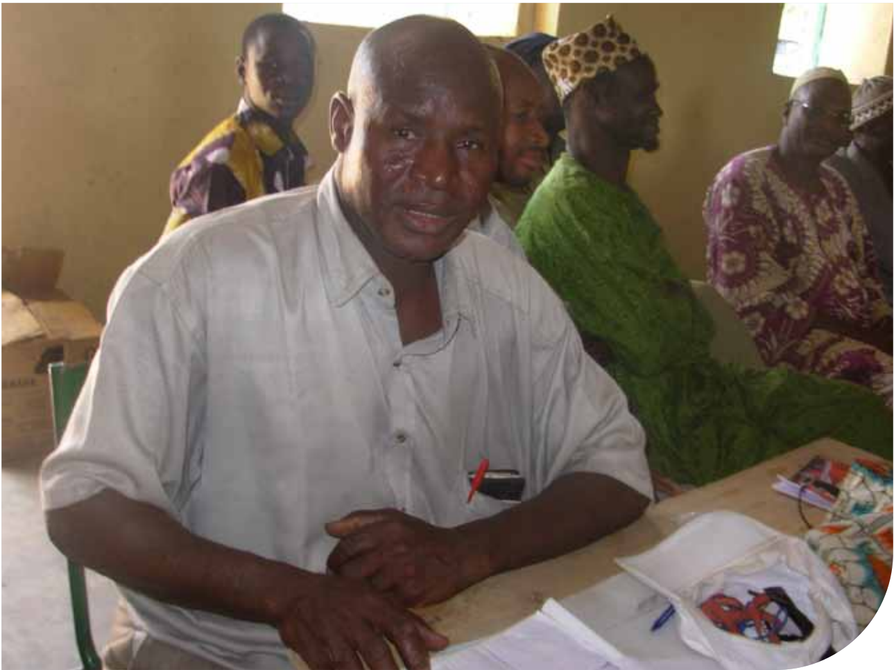
The Dangassa extension worker and photographer during the 2009 3AG-FABEMA Focus Group meeting. He has presented his ideas on the importance of digital photos.