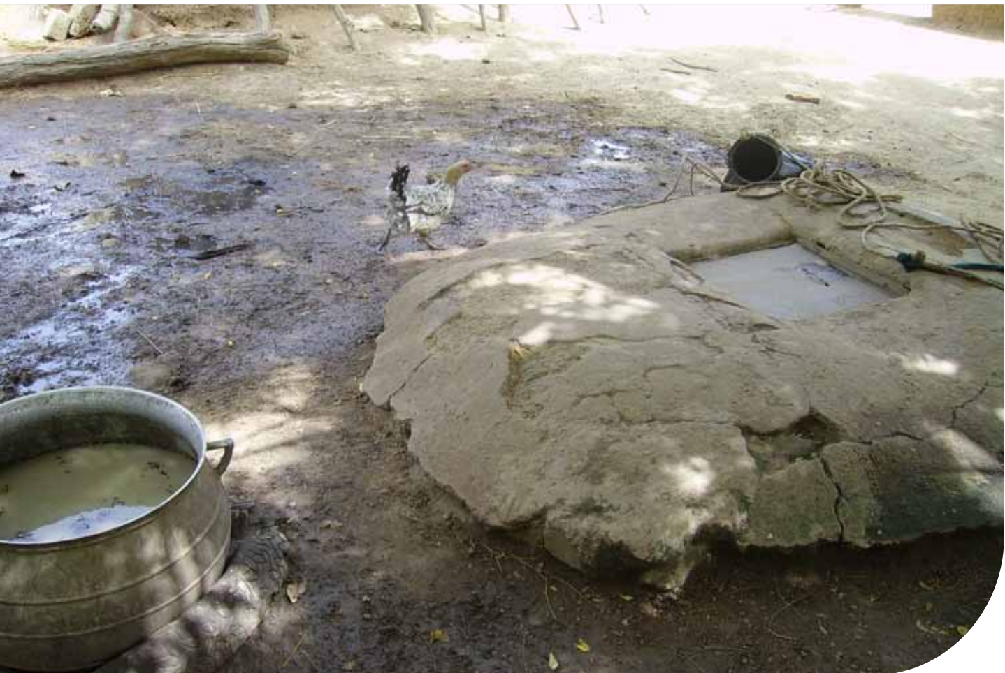
This well could cause major health problems. 3AG and FABEMA give hygiene and sanitation training to show how people in the Mandé region can reduce health risks.