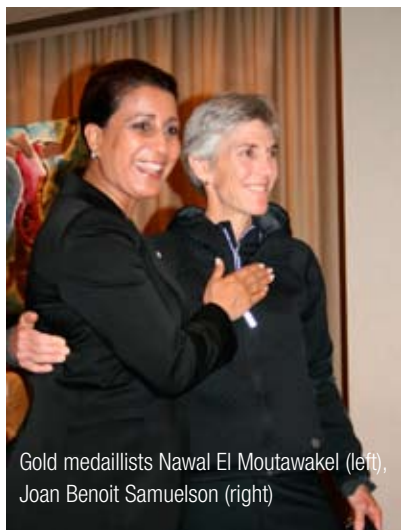
Gold medallists Nawal El Moutawakel (left), Joan Benoit Samuelson (right)

Joan Benoit Samuelson (USA) has played a central role in developing long distance running for women since 1984. Among runners, Joan's name is at the top of the list for speed, respect and perseverance. She promotes running for women and communicates about the potential of sport to empower women and build self confidence. In her opening speech for the conference, Joan stressed the importance of the Nike tagline: 'there is no finish line' . After she won Olympic Gold in 1984 her mother asked her: 'Are you finished now?' But Joan wanted the Olympic victory to be a starting point instead of an end. Since then Joan celebrated many victories, as athlete as well as personally and for women's sports. And there still is no finish line for Joan Benoit Samuelson as she continues to promote long distance running for women.