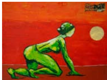
Souad Sahl, Ecole Technique d'Arts Plastiques