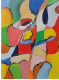
Soufyan Moubarik, Ecole des Beaux Arts