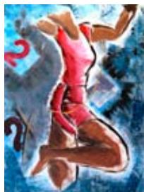
Jihad Bouhandi, Ecole Technique d'Arts Plastiques