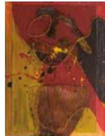
Asmaa Belafia, Art'Com