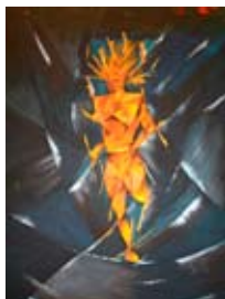
Youssef Aouzal, Ecole des Beaux Arts