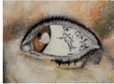
Mohammed Faycal Ammor, Ecole des Beaux Arts