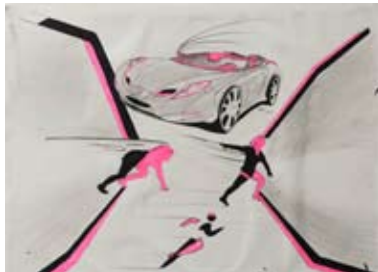
Abdelaziz Sadri, Collège Lasalle