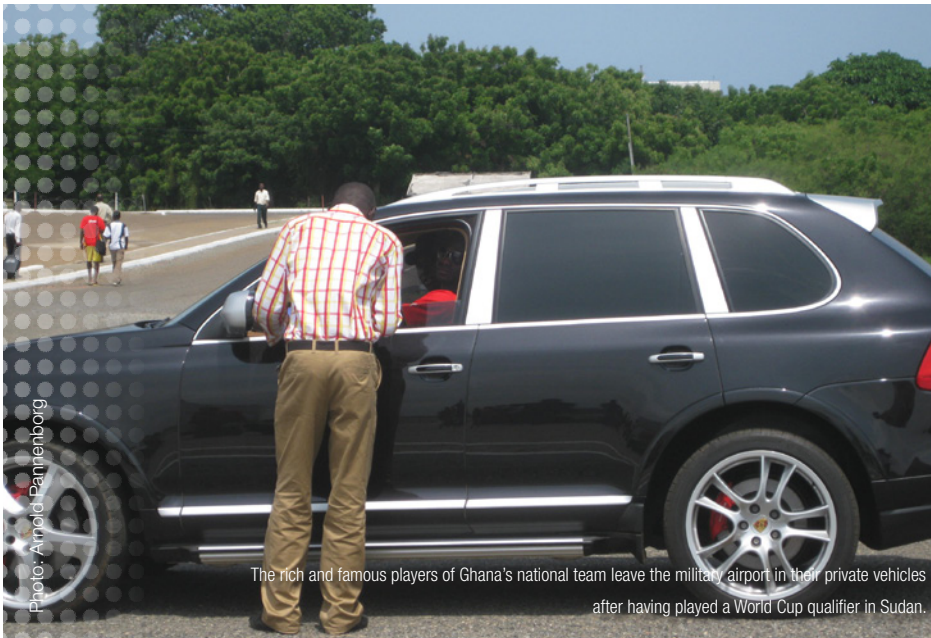
The rich and famous players of Ghana's national team leave the military airport in their private vehicles after having played a World Cup qualifier in Sudan.

The trade in African players is so great that there are thousands of football academies on the continent. Some of them will make the players go get an education to prepare themselves for a life outside of football. Most of the academies are illegal and are run by dubious characters who want to make a quick buck. A lot of players are also transferred through the clubs. Researchers argue that the trade is killing football in Africa. Indeed, local leagues have lost much of their popularity due to the exodus of players.