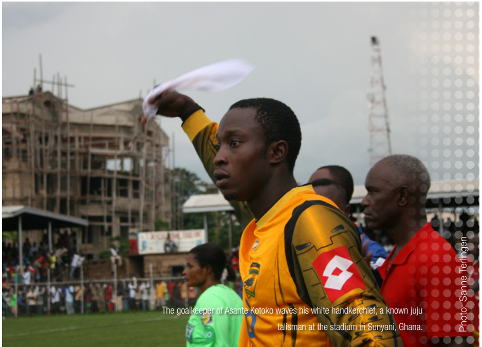
The goalkeeper of Asante Kotoko waves his white handkerchief, a known juju talisman at the stadium in Sunyani, Ghana.