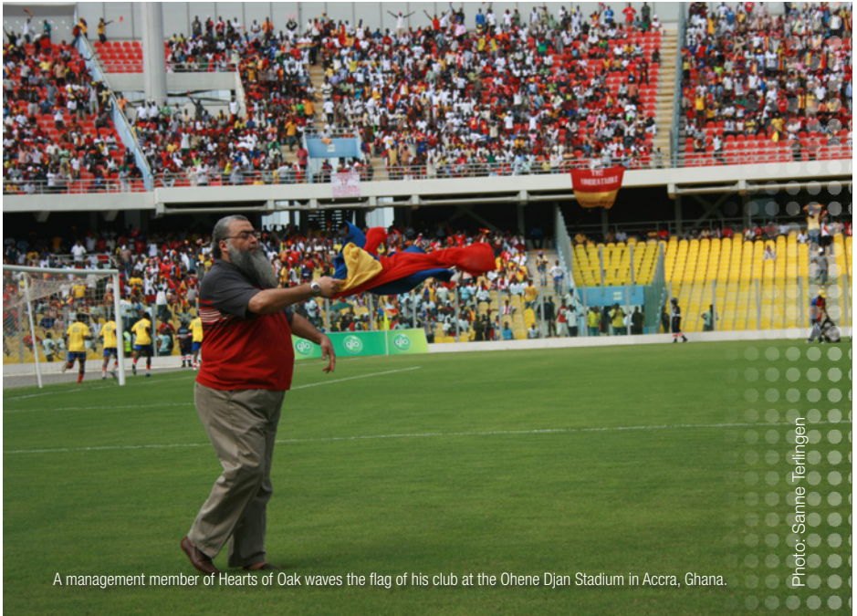
A management member of Hearts of Oak waves the flag of his club at the Ohene Djan Stadium in Accra, Ghana.