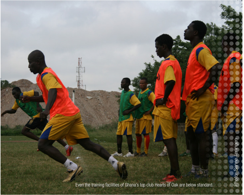
Even the training facilities of Ghana's top club Hearts of Oak are below standard.