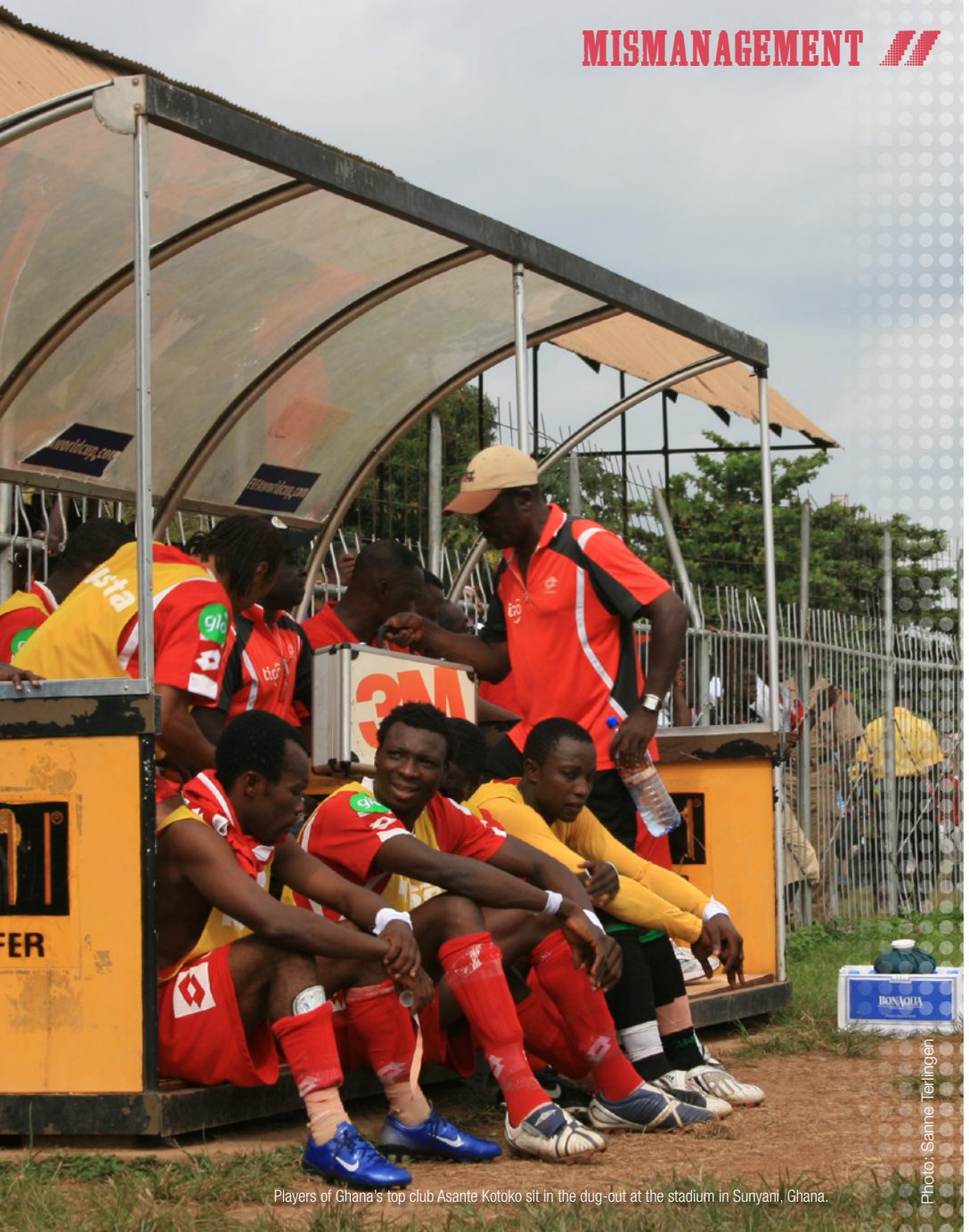
Players of Ghana's top club Asante Kotoko sit in the dug-out at the stadium in Sunyani, Ghana.