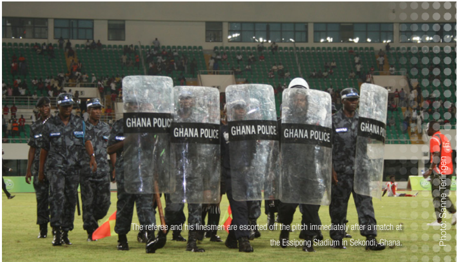
The referee and his linesmen are escorted off the pitch immediately after a match at the Essipong Stadium in Sekondi, Ghana.