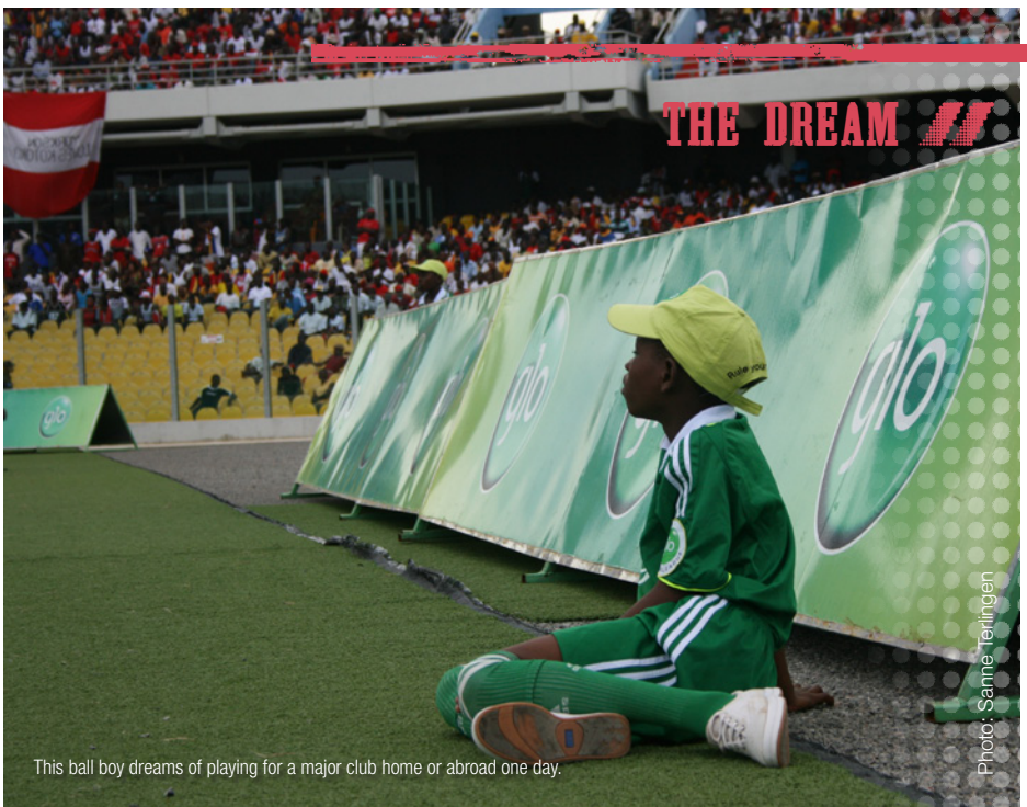
This ball boy dreams of playing for a major club home or abroad one day.