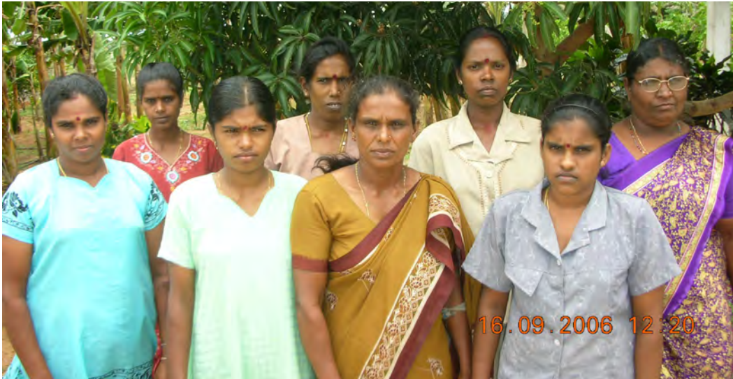
The elected committee of CBO Tharanikulam, Vavuniya

Leadership positions for women, and women's empowerment: