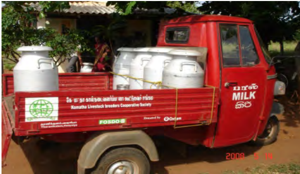
Milk hygiene, storage, collection and distribution were improved.

To further expand markets, the women's cooperatives started to develop value-added products like flavoured milk, curd, ghee, ice-cream and milk toffees. The success of these products improved the incomes of the cooperative members.