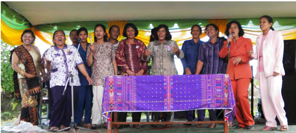
The women of the CU Humbang Hasundutan celebrating the opening of the CU office.

Despite the initial resistance from both women and men when we first started our activities, the women have come to trust the CUs. They recognise PESADA for its commitment to community development through women's empowerment. From being largely second class citizens with no voice, the women who have been part of the process have emerged as a new power group in society. For the first time, women from rural areas are running as candidates for parliament and as local leaders. They travel to other places, meet other women's groups, and develop networks. Simply by doing this they show that they have become strong enough to resist the social pressures on them.