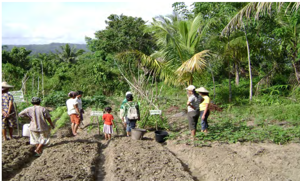
Demonstration plot for growing crops on Nias island

Preschool education was a next step. PESADA set up the first of many day care centres (DCC) in Tinada, the hometown of the Pakpak people. Very few fathers were involved in the care of their children; neither did they participate in parent meetings and discussion groups. Attendance of the children was also irregular, as many of the mothers who were dependent on their husbands' income did not receive money to pay for the children's education. Observing this, PESADA arrived at the understanding that women's access to and control over resources would make a huge difference, and responded by starting a savings and credit group for women.