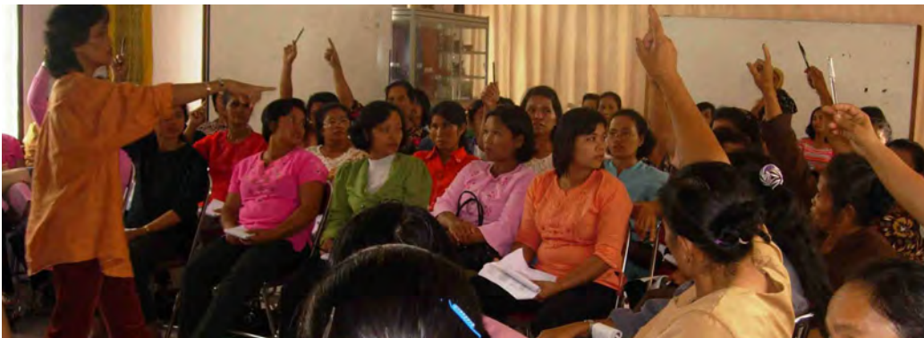
Board election for the Big Credit Union in Dairi Region

All PESADA's programmes are based on the principle of equality; and equality starts from an understanding of the principle of power sharing. As gender inequality and poverty are at the core of many problems, to address this situation, PESADA developed a community empowerment programme for women, children, poor families and other marginalised groups. Its focus on women proceeds from its conviction that women who have access to learning, social capital, business capital, and who can deal with women's specific health needs, find themselves in a stronger bargaining position, better able to participate in decision making processes and lobby for women's and children's interests in a political arena.