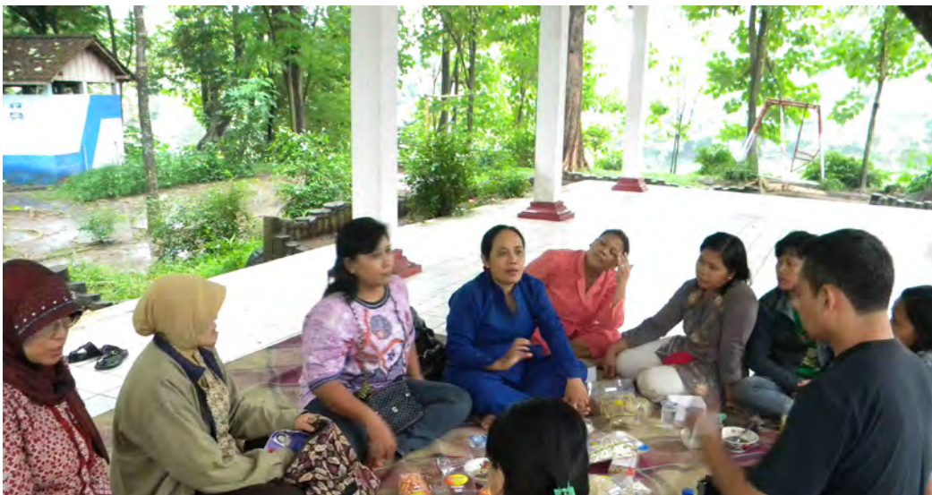
ASPPUK provides support to its member organisations

Apart from its work with the CSO network to empower women economically, ASPPUK also advocates for gender equity, gender justice and women's leadership at the political level. Its starting point is that political awareness and economic development are both necessary for gender justice. ASPPUK runs training on community organisation, political awareness, political rights, and critical awareness. It also has a Women's Empowerment in Politics programme which carries out voter education at the village level in preparation for elections.