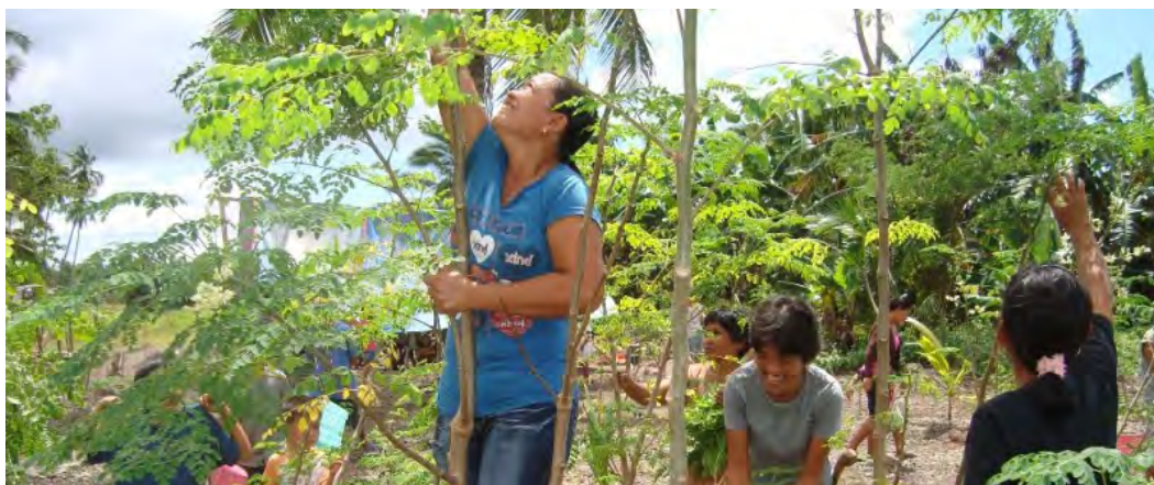
Earning an income is an important step towards placing women in leadership roles.

A new approach to achieving gender equity and women’s empowerment is to educate men. One of the new activities designed to achieve this goal is the ‘family days’. Every member of the family is welcome, and they can take part in various activities. Among the activities are support groups to discuss issues at the household level. When men see that other men support their wives and kids, they are encouraged to do likewise.