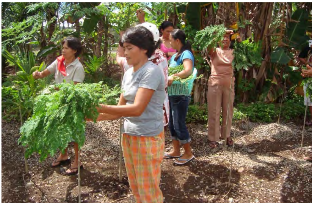
AADC strives to increase women's participation in economic activities

AADC advocates political, policy, and social recognition of the fact that women and girls have distinct needs that must be addressed in terms of education and leadership skills. This means that programme design and implementation at different phases need to pay specific attention to women's needs. AADC believes that generic community development with efforts to increase women's participation is not enough.