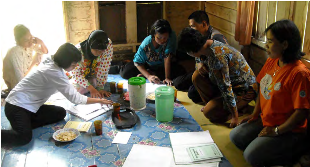
A KPUK meeting

business) on raising awareness of their situation and encouraging critical thinking and political awareness. Only when women see that they are being treated unfairly will they think about changing their situation, become politically active, and take on leadership roles. They will strive to find ways to access resources - not only financial resources, but also market and information – to invest in their businesses.