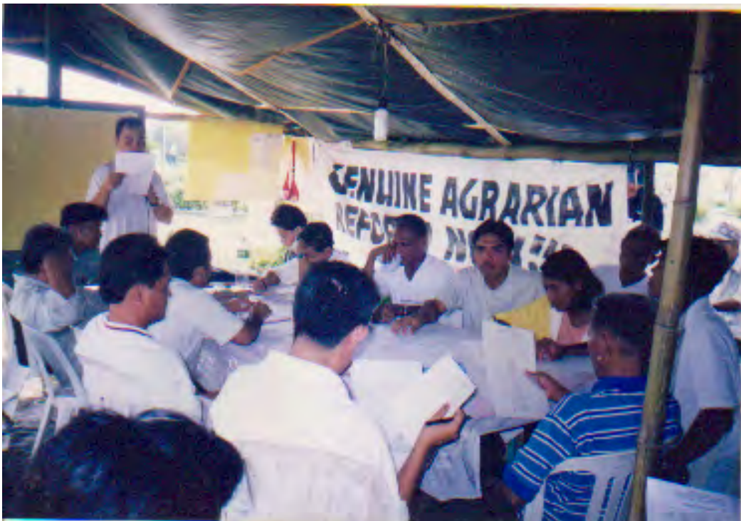
Strategy session on agrarian reform claim-making