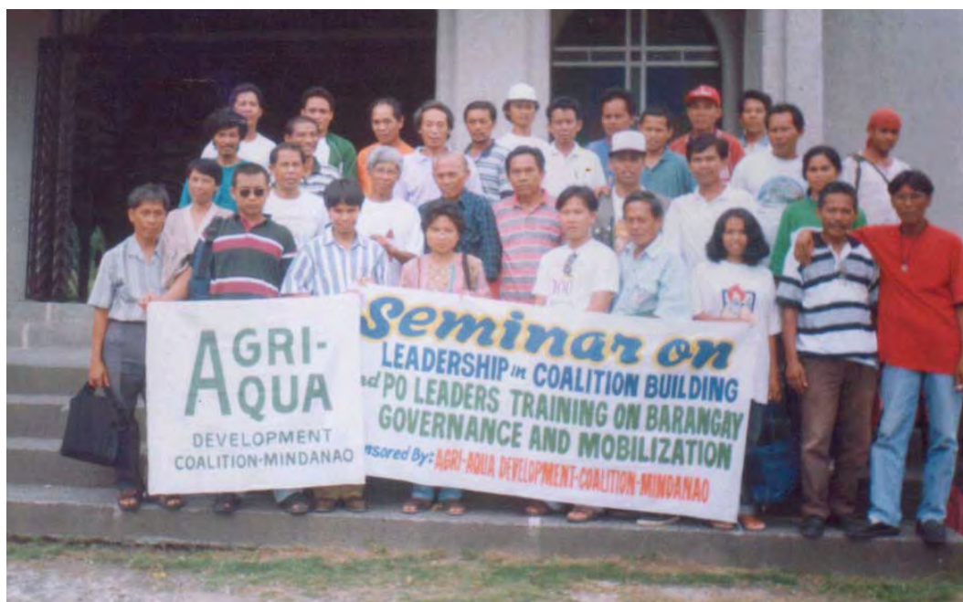
Training of people's organisations leaders

AADC is committed to creating sustainable rural communities which benefit from reforms in government, and ensuring that people's participation is genuine and meaningful. It is also committed to consolidating coalitions that work for change and for the development of the community. It strives to effect progress within the ranks of the rural poor through its flagship programme, Community Economic Development (CED). Using their common interests, the CED mobilises government, the private sector and civil society to make efficient use of resources (natural, financial and human) to achieve economic growth and equity. The foundation of the CED's work is gender equality, food sufficiency and environmental protection.