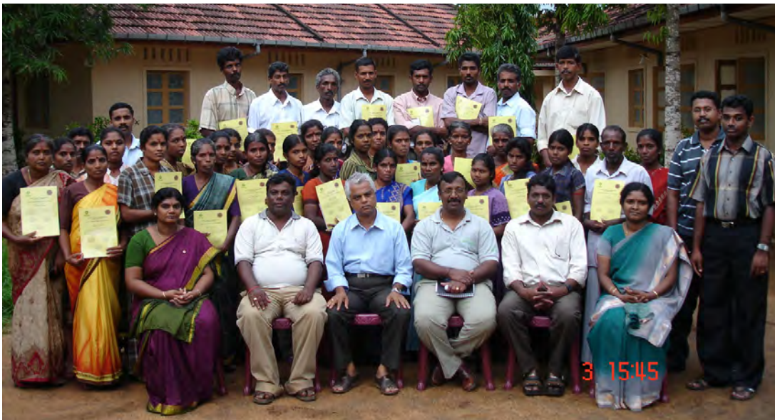
The first group of farmers to receive livestock management training in 2006 2

In 2006, a Community-based Needs Assessment confirmed that dairy farming was still an important livelihood activity for households in Vavuniya. However, the dairy sector was very weak given the destruction of infrastructure, the lack of veterinary and extension services, and sparse financial services. Nevertheless, dairy farming was a secure source of secondary income for 15,000 households, of which 3,000 (20 percent) were headed by women. Despite the number of women in the industry, they had little access to and control over the market, and limited access to supply channels. This placed them in a very vulnerable position, and gave them no bargaining power.