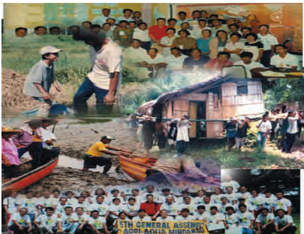
An impression of AADC's work 1