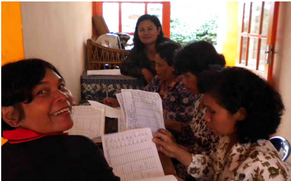
New skills are learned, such as basic bookkeeping

This points to another impact: the changing attitudes of many men. When PESADA first started its work, many men were resistant and even threatening – after all, they were used to having a dominant role as the income earners and decision makers. It took time for them to see the benefits that empowering women brings. They now play a greater role in family matters, and some men are proud that their wives are bringing in an income through the CU. Importantly too, PESADA has 11 male staff members who act as role models.