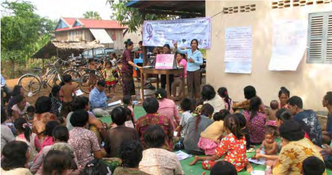
Working at the village level to change attitudes

CPWP trains women to enter politics at three levels: commune/sangkat, district and provincial.