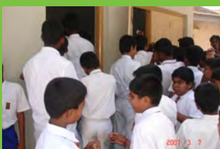
Pupils and teachers queue up at a school to buy milk during their break.

Once established, the women's cooperatives started to develop new markets and generate demand. One new market was pre-schools and schools, which the cooperative developed in collaboration with the Department of Education. Another was providing door-to-door delivery services from three village based milk sales centres to 3,000 households.