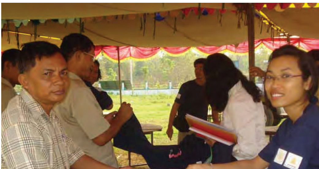
Women's Rights Day 6