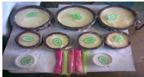
Some of the new added value dairy products made by the women's cooperative

Given the perceptions about women and their traditional place in society, the project worked hard to avoid being perceived as a threat to existing institutions and power structures. It did not want to displace men, and did not want to be perceived as doing so. DDP thus developed its own institutions and market channels. It resisted trying to integrate women into the one male dominated cooperative. Instead, it approached the President of the men's cooperative. He supported DDP's philosophy of poverty alleviation by empowering women, and together with him, DDP worked to remap the district and create new markets for women's cooperatives.