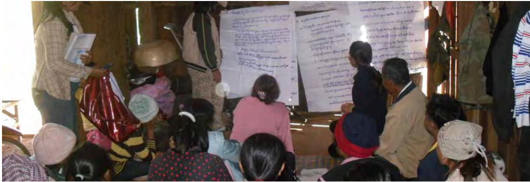
Coaching of sangkat women