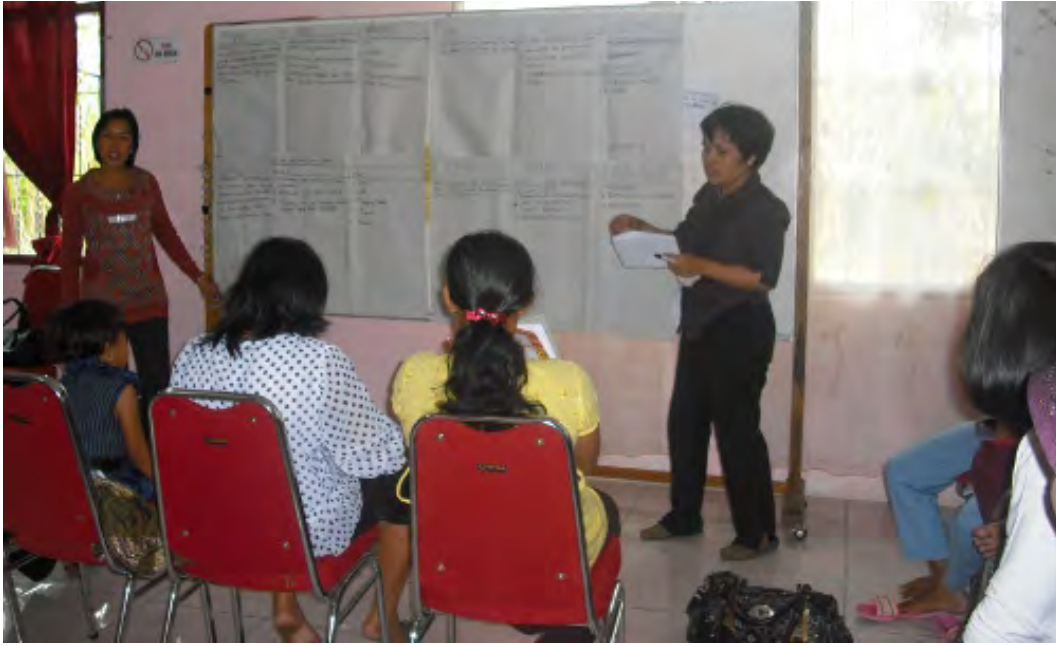
A capacity building workshop at one of the Credit Unions

manage their own business with their own capital. They also needed to be able to take control over the whole business process to reap the benefits themselves. The micro credit and loans were mostly used for agricultural activities to generate an income from which they would repay the loans and use the rest to pay the health and education expenses of their children.