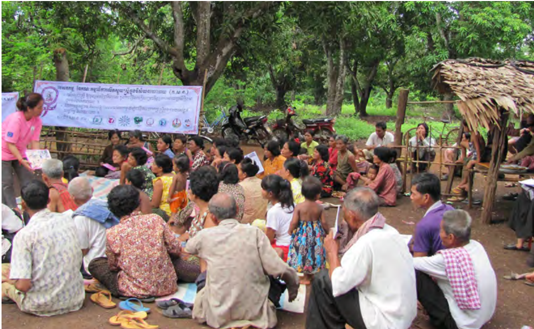
Outreach to villages

Nothing will change for women and girls without attitudinal change. People are starting to recognise that all women play an important role in society and that policies need to respond to the basic rights and needs of women and children. CPWP reaches out to men, women and the wider public through its media and community outreach programme.