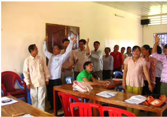
WPAN: A Training of Trainers session that includes men.

With CPWP gaining ground, it is actively working to recruit new members. One strategy is to recruit young women who then train each other and thus expand the reach and work of the network. The WPAN (Women's Political Activists Network) is and will continue to be instrumental in this. Materials have been developed for WPAN, and CPWP is looking to WPAN to take on educational activities.