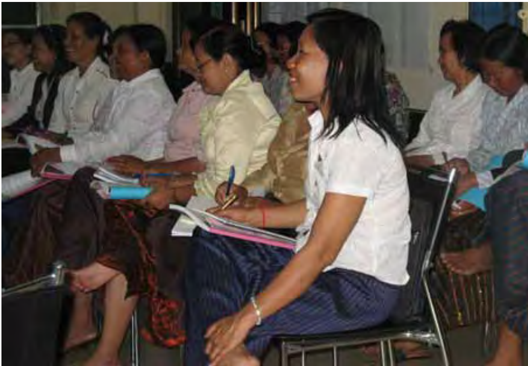
WPAN training of trainers

A milestone was the creation of the Women’s Political Activists Network (WPAN) in 2008 at commune/sangkat level. WPAN meets monthly and trains its members in communication, planning and management skills, advocacy, and basic legal literacy. It also conducts outreach activities and monitoring. As the WPAN meets regularly at different sub-national levels, it contributes to the continuous coaching and support of its members. The women involved in the WPAN coach other women, and the trainers coach other trainers. The plans for the next few years are to recruit and train WPAN members as trainers, and to develop resource material.