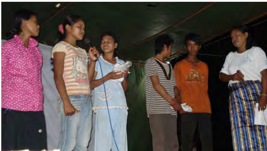
The Night forum: entertainment is a good way of getting the message of gender awareness across

The Night forum was for the general public, and everyone was welcome. The goal was to raise awareness on women's rights, women's leadership and gender. Local authorities, commune/sangkat leaders, activists and citizens gave presentations and took part in discussions with the public. Entertainment like films, songs, and role plays were used to convey gender equity messages to the audience.