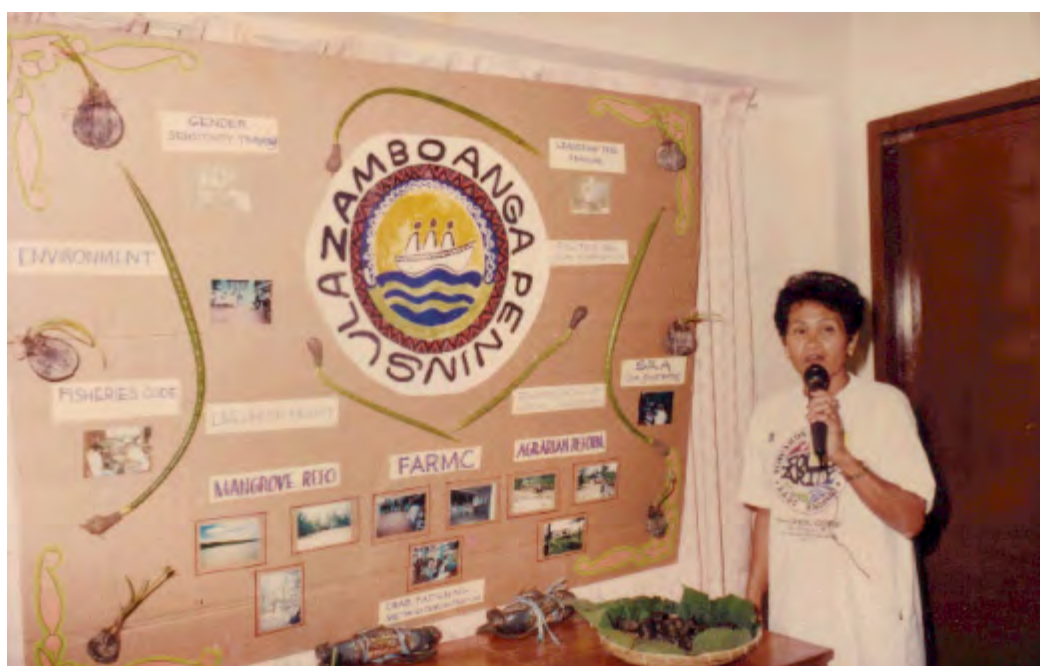
Area Reporting by women leaders

AADC is optimistic that gender equality will be achieved in our lifetime. The younger generation is changing, partly because of pressure from their peers, but also because of their parents' increasing awareness. For the first time, significantly, boys are learning to do household tasks. The younger generation is seeing more women in leadership roles in organisations, the political arena and in higher education; and they see women asserting their rights. Education is crucial in this, and AADC is working on having gender principles mainstreamed in the education system so that this will continue into the future.