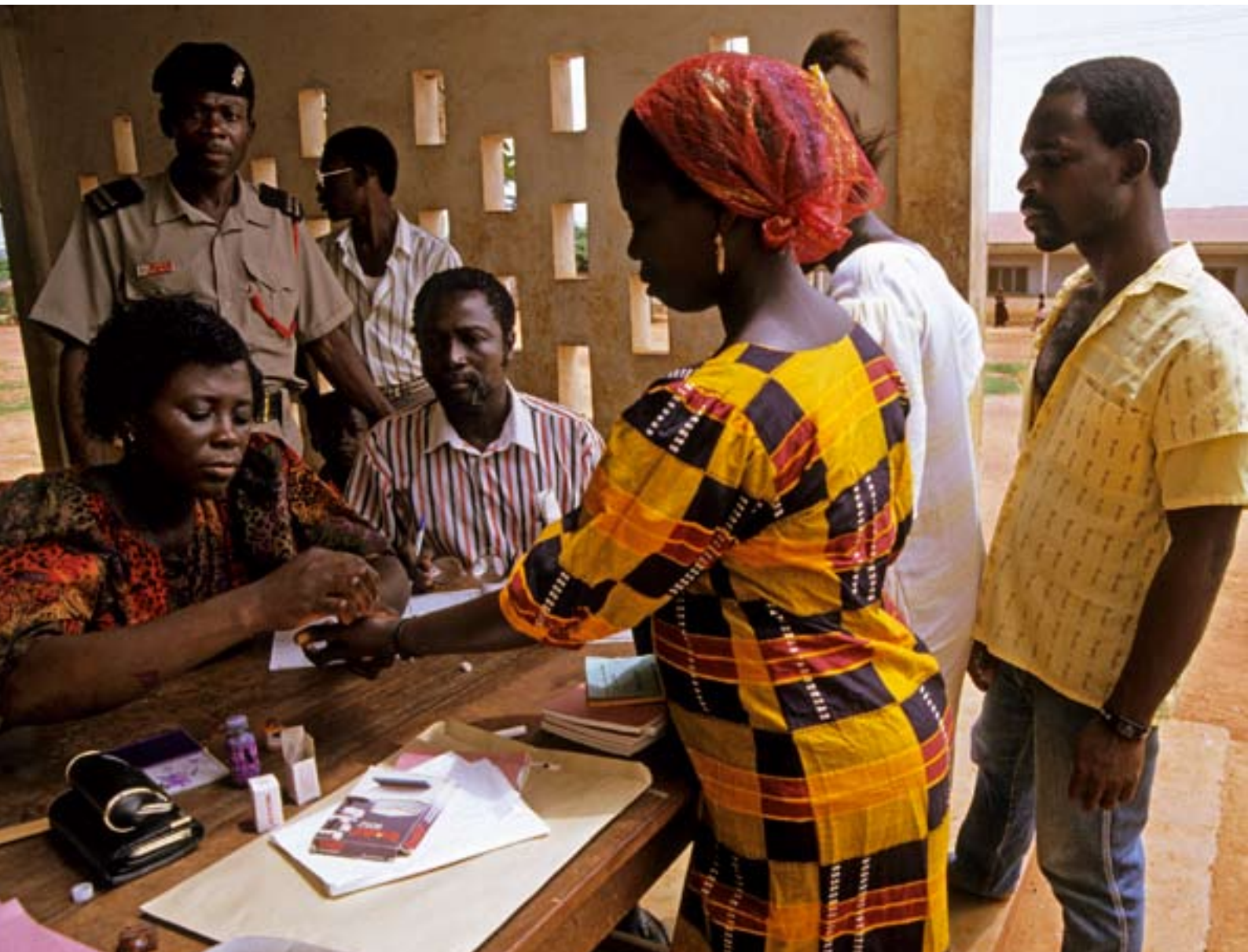
Polling station during the elections in 2004

Finalise and disseminate Democratic Consolidation Strategy Paper (DCSP) phase II (and start work on implementation). Foster strategic partnerships to broaden the programme and fulfil the ambitions within the DCSP Step up monitoring of both the bilateral and cross-party component, using locally designed mechanisms including input from local experts.