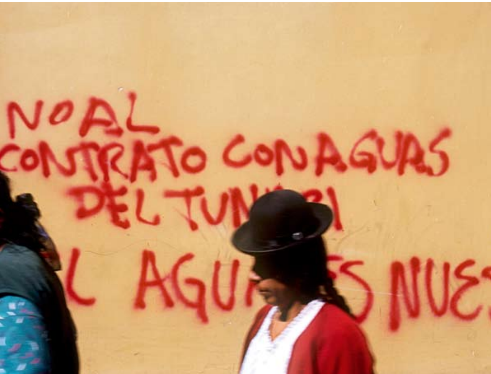
Signs of social protest on a wall in La Paz

The NIMD will continue to strengthen the political parties.