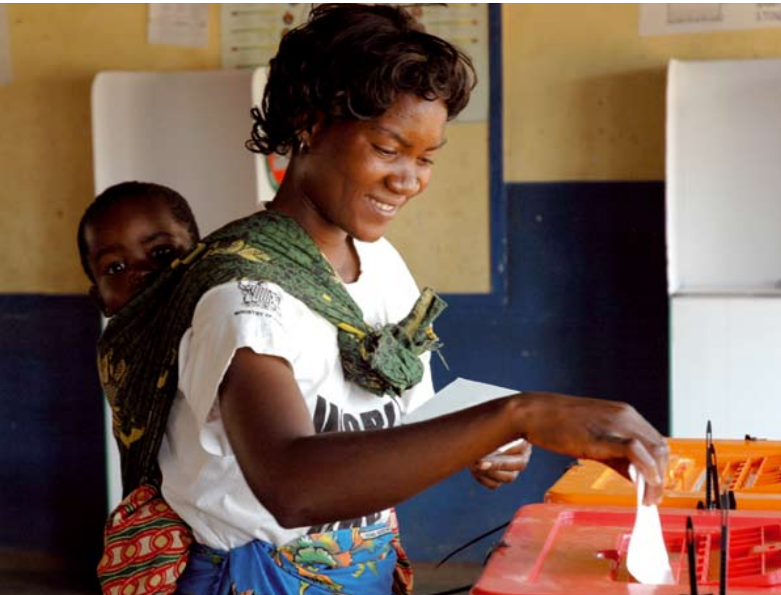
A woman casts her vote at a polling station in Lusaka

Achieve a political compromise over the constitutional review process if there is sufficient political will and popular pressure. Increase policy capacity within political parties. Continue to decentralise the programme. Institutionalise ZCID. Ensure that financial monitoring is done on a programme basis, with spot checks during the year.