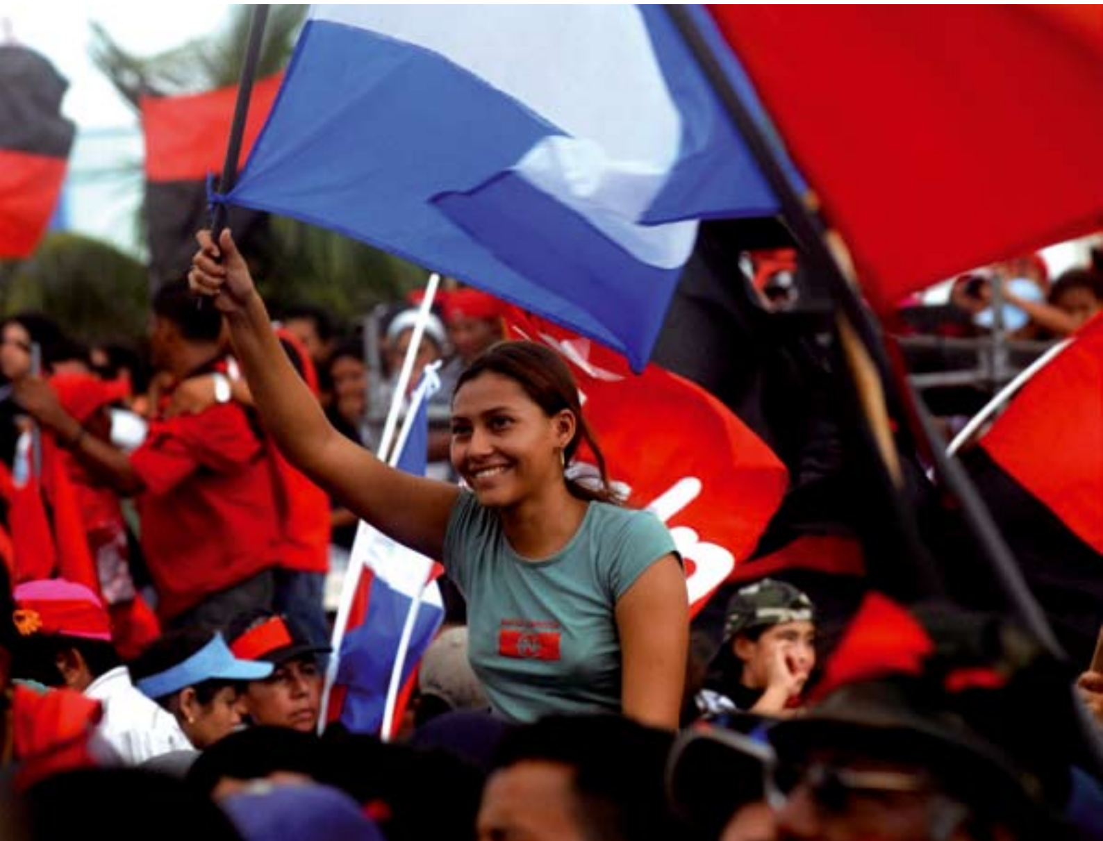
Voters celebrate the result of the elections in 2006

Successfully finalise the project 'Enhancement of Political Institutions, Nicaragua 2005-2007'. Secure a second phase for the 'Enhancement of Political Institutions' project. Successfully start the 'Debates on Democracy, Social Cohesion and Regional Integration' project. Assist the political parties in designing and establishing the 'Nicaraguan Multiparty Centre'. Present and debate the final version of the Interactive Assessment Report.