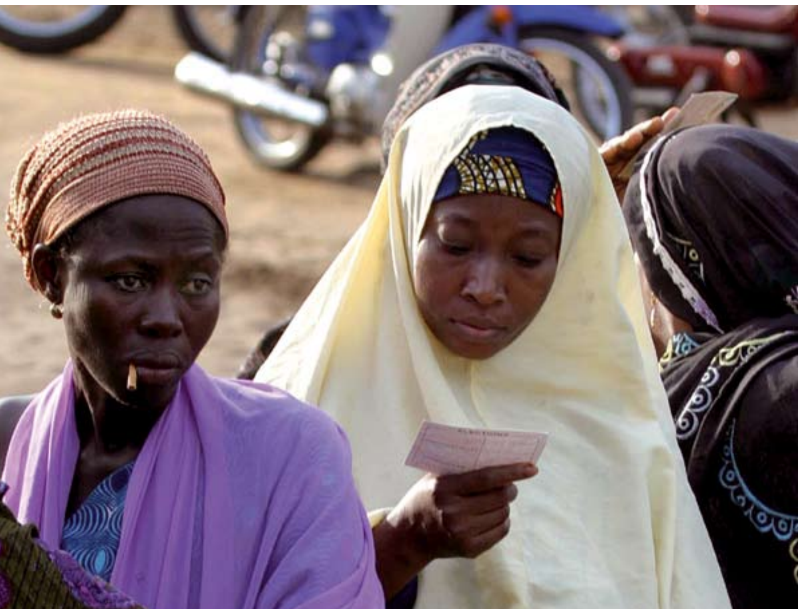
A woman checks her voter card in a line for the presidential elections in Benin, 2006

NIMD Mali and Mali Forum of Political Parties