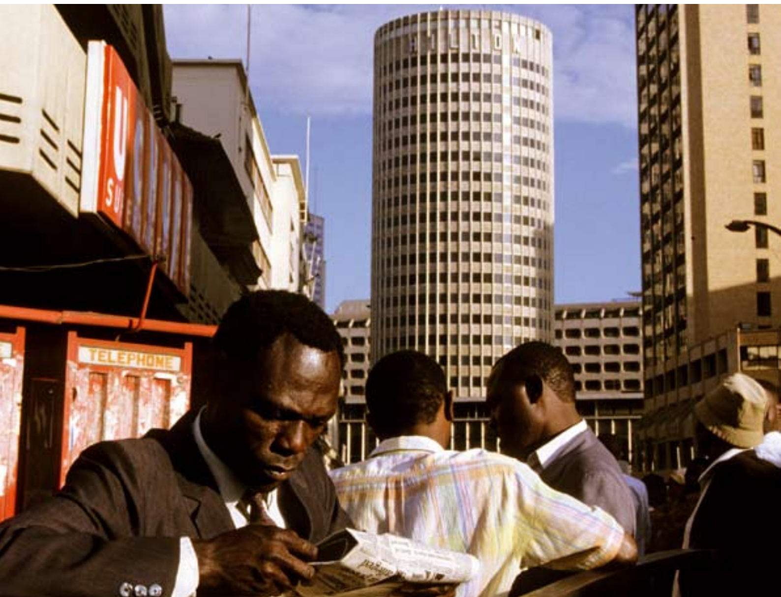
Business men at a newspaper stand in Nairobi

Democratic Party of Kenya (DP) Liberal Democratic Party (LDP) Forum for the Restoration of Democracy Kenya (FORD Kenya) National Party of Kenya (NPK) Kenya African National Union (KANU) Forum for the Restoration of Democracy for the People (FORD People) National Rainbow Coalition – Kenya (NARC) Forum for the Restoration of Democracy Asili (FORD Asili) Sisi Kwa Sisi Social Democratic Party (SDP) National Labour Party (NLP) Shirikisho Mazingira Green Party of Kenya Safina