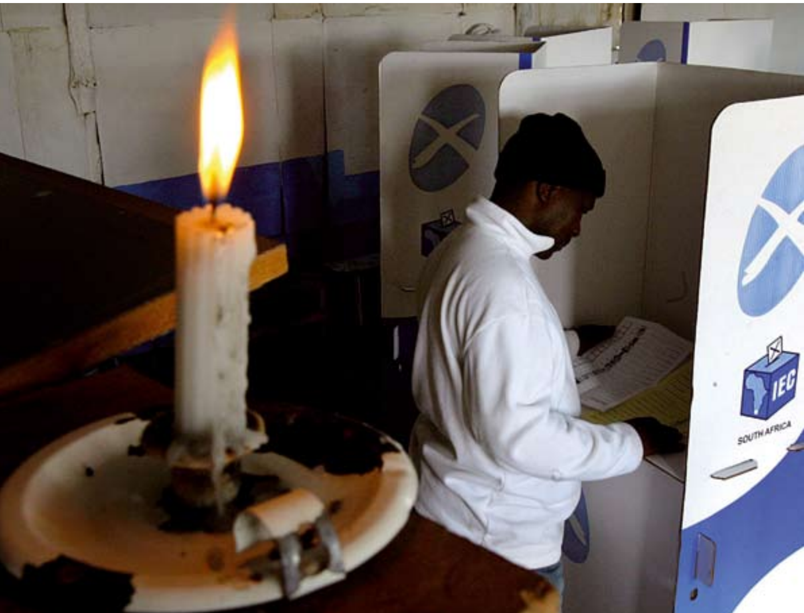
Polling station at a church in Kayelitsha, South Africa, during local elections in 2006

Ensure an explicit link between the regional and national programmes in both planning and implementation processes and invest in capacity building and facilitation to assist both parties and the CMDs in translating regional lessons into national strategies and activities. Arrange multi-party visits between ESARP programme countries to apply knowledge from the regional network and make it easier for lessons to be learned. Step up programme facilitation and coordination through NIMD's regional representative and a newly recruited senior researcher.