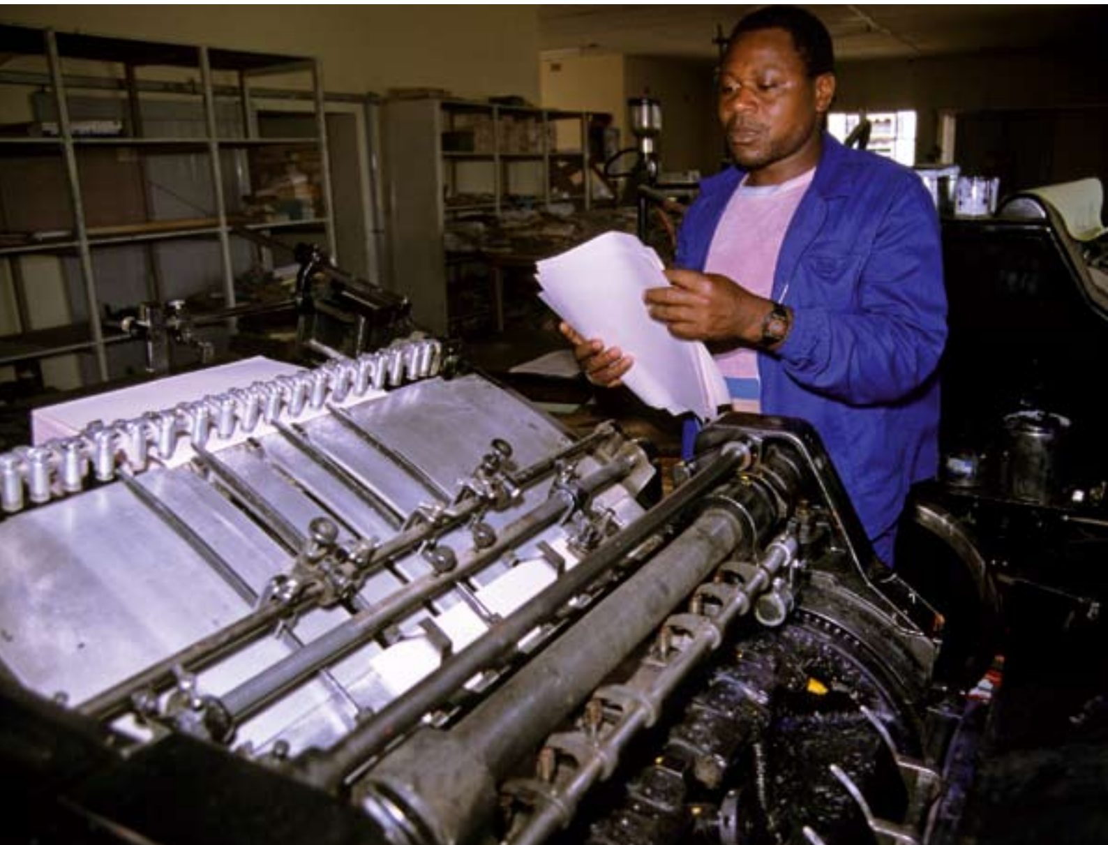
Printing press in Harare

An inclusive dialogue on a democratic agenda for Zimbabwe.