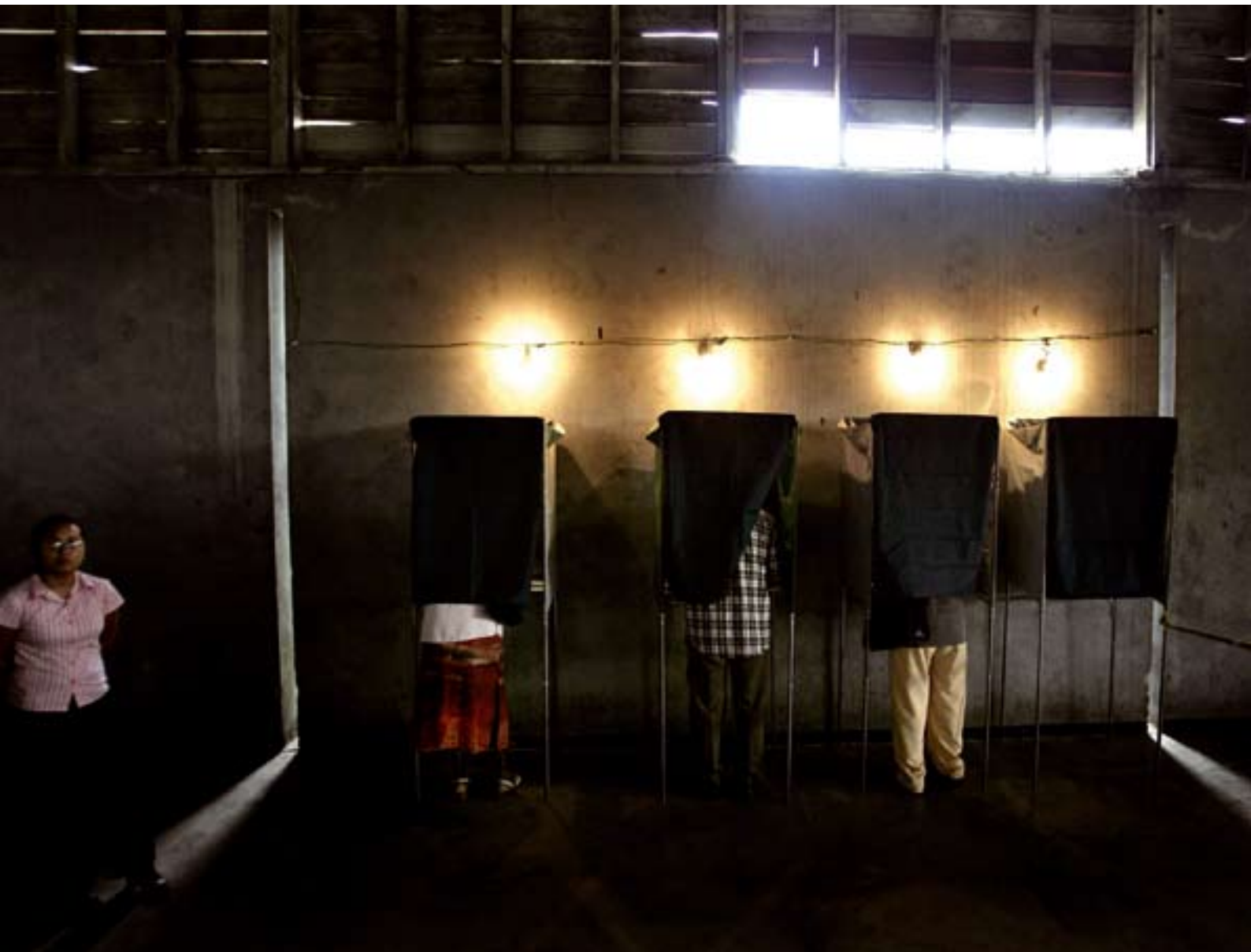
Polling station in Paramaribo during elections in 2005

Organise exchanges for members of political parties with counterparts in Central America.