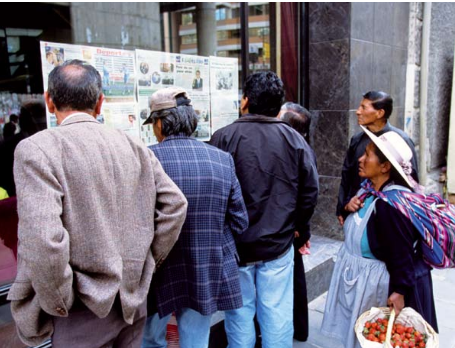
Window of a newspaper publisher in the city centre of La Paz