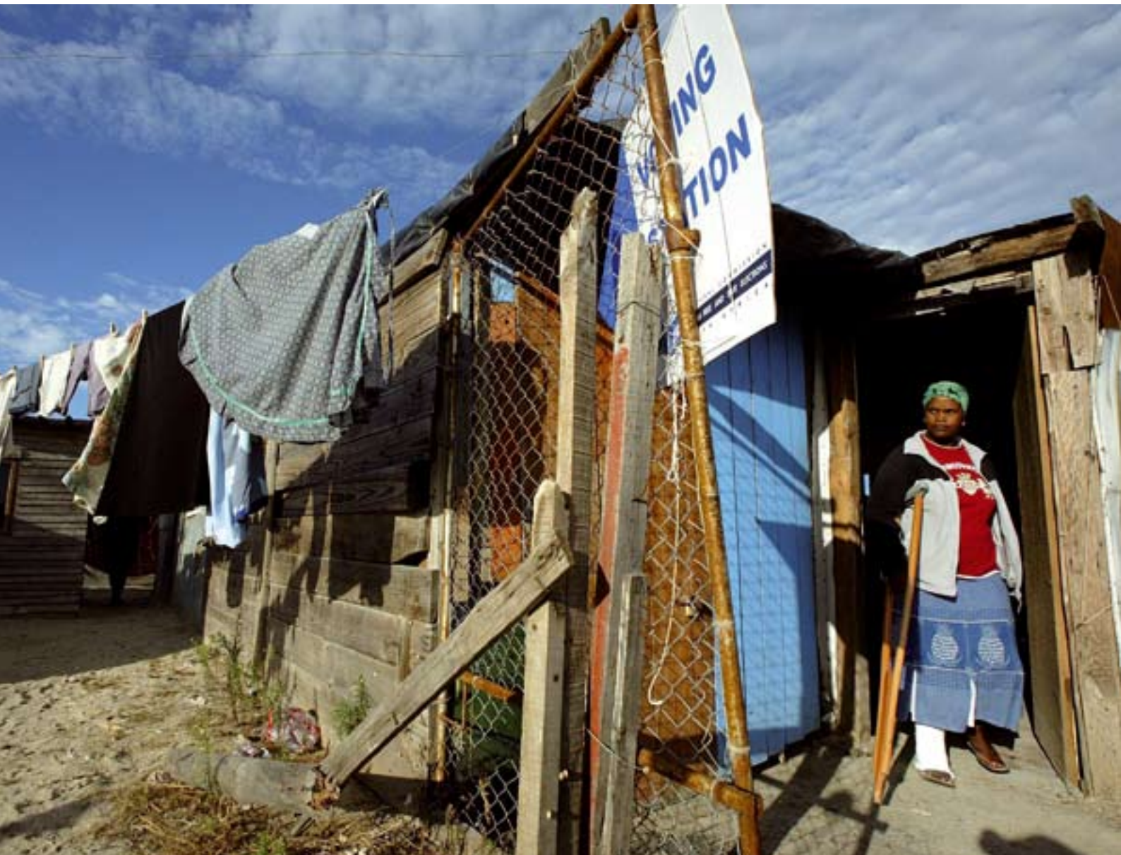
Polling station in Kayelitsha during local elections in 2006

Reorient the relationship with CPS to one of strategic advisory input, leaving programme facilitation to NIMD's regional representative.