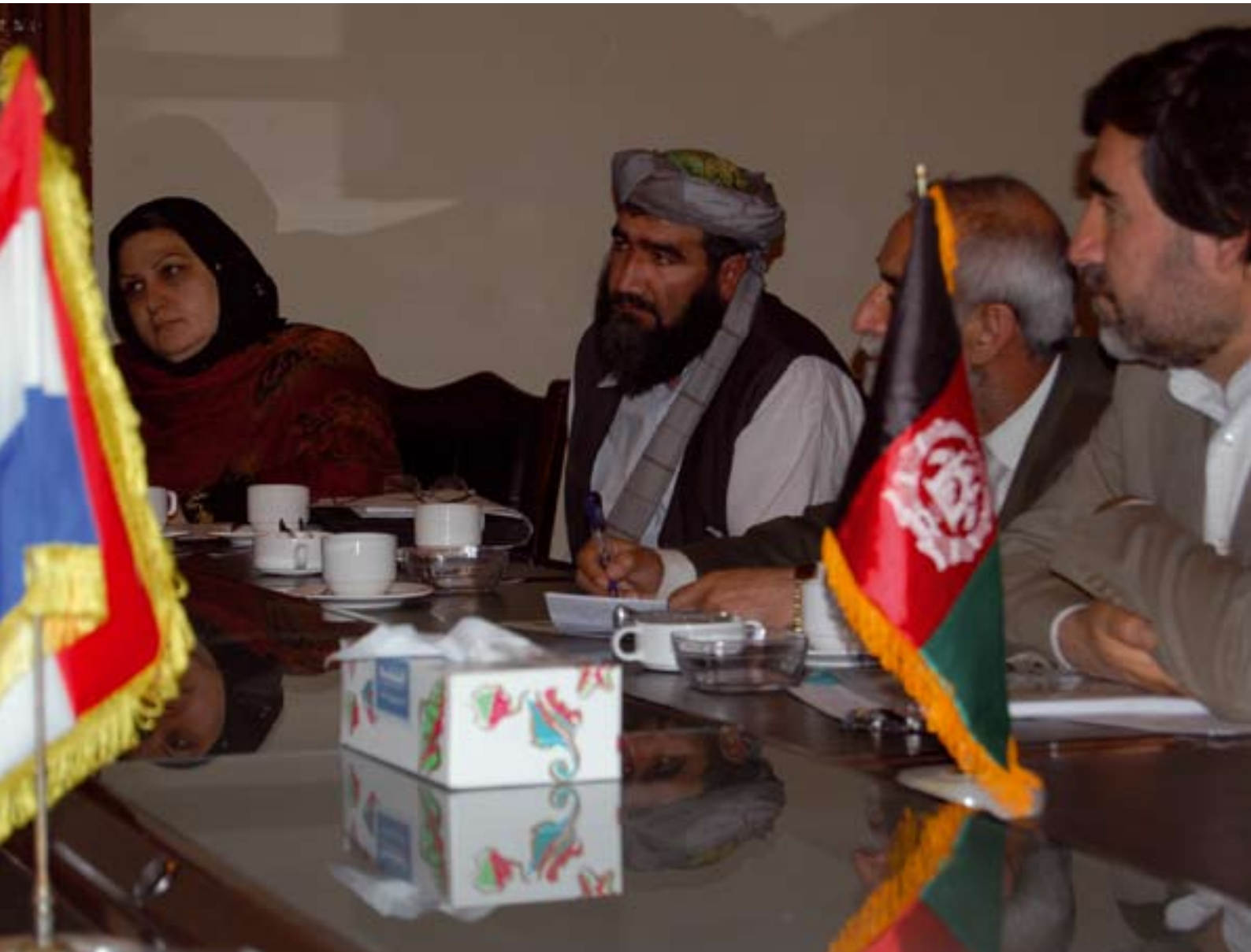
Afghan parliamentarians meet with NIMD mission in Kabul

A final decision by the Board as to whether or not an NIMD programme in Afghanistan can be started and under which conditions.