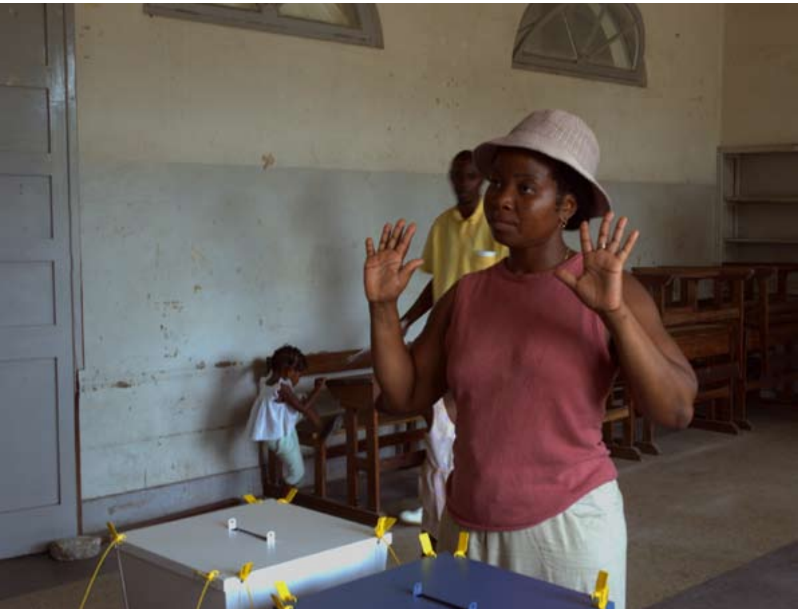
Polling station during the elections in 2004

Strengthen the relationship with civil society and facilitate the cross-party women initiative.