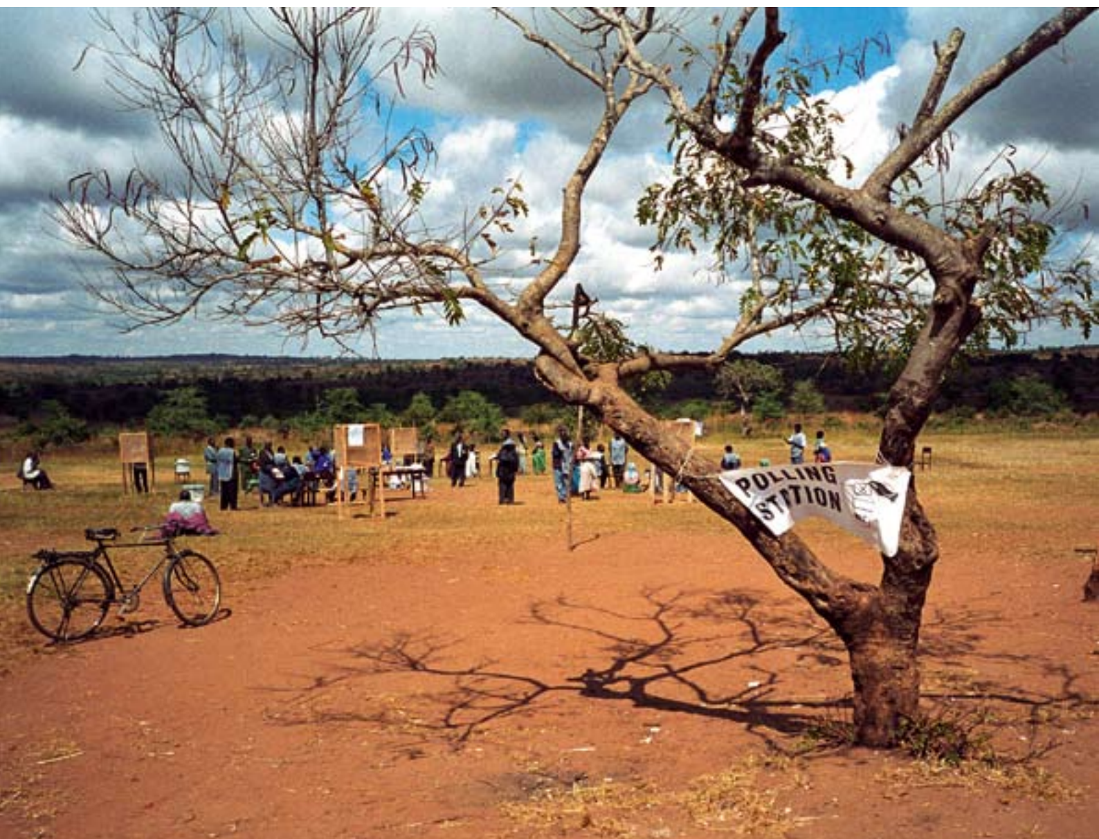
Polling station during the elections in 2004

Institutionalise Centre for Multiparty Democracy – Malawi (CMD-M) Prepare for the local elections in 2007. Start an inter-party dialogue with a focus on the top leadership. Integrate lessons from the regional programme into the national programme, with a focus on inclusiveness. Establish strategic partnerships.