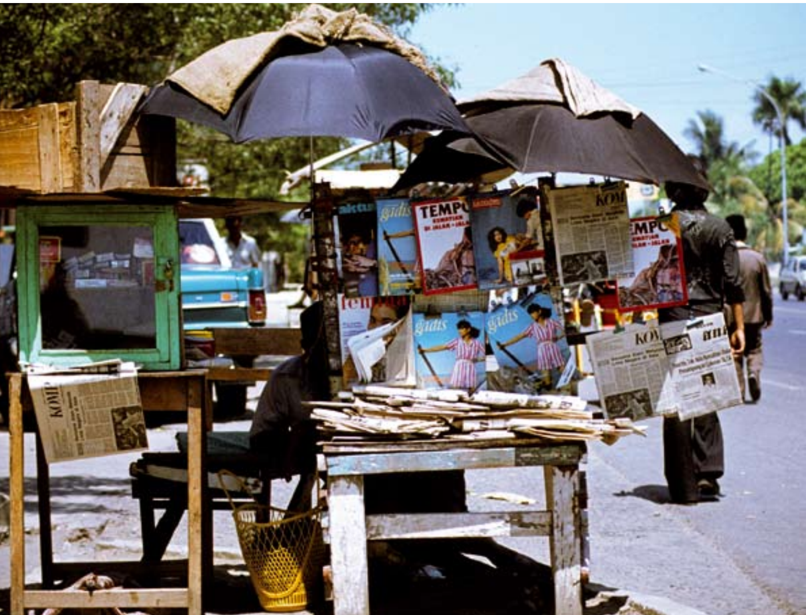
Newspaper stand in Jakarta

Further consolidate the SDs in the five regions and prepare their representation in KID. Establish partnerships with the seven main political parties and prepare joint programme activities.