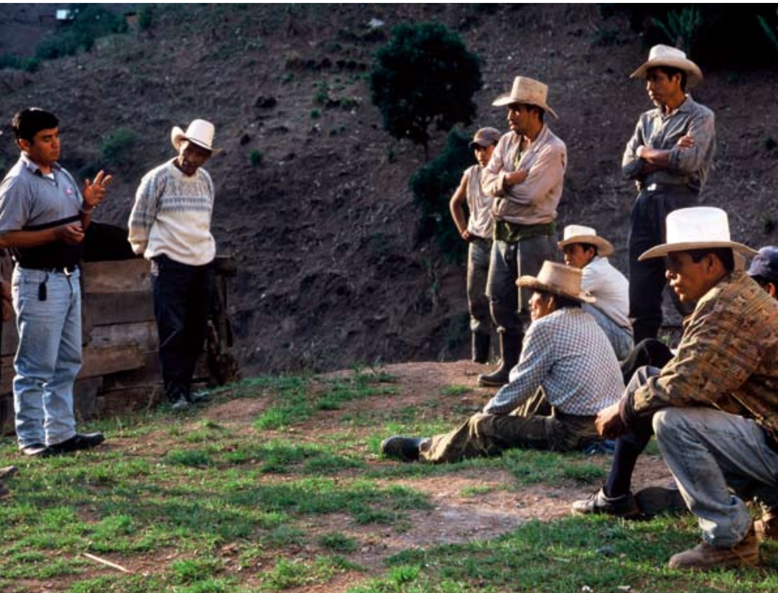
Villagers listen to local politician in Alta Verapaz

UNE (Unidad Nacional de la Esperanza) PAN (Partido de Avanzada Nacional) PP (Partido Patriota) PU (Partido Unionista) ANN (Partido Alianza Nueva Nación) URNG (Unidad Revolucionaria Nacional Guatemalteca) UD (Unión Democrática) DCG (Democracia Cristiana Guatemalteca) DIA (Partido Desarrollo Integral Auténtico) MR (Movimiento Reformador) PSN (Partido Solidaridad Nacional) UCN SOLIDARIDAD Encuentro por Guatemala BIEN