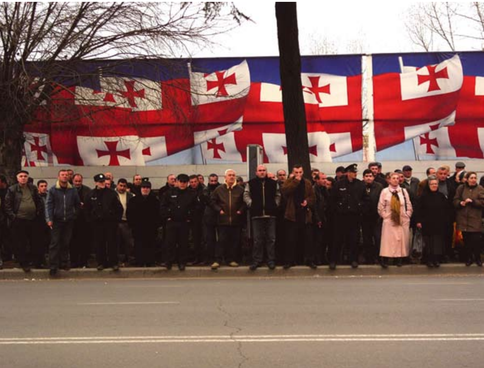
Demonstration in front of the parliament in Tbilisi

The NIMD will assist the political parties in starting a debate on legal regulations for political parties, their funding and the legal implications of their institutional development. Parties will also be assisted in developing internal regulations, including an exchange of views with European political institutions.