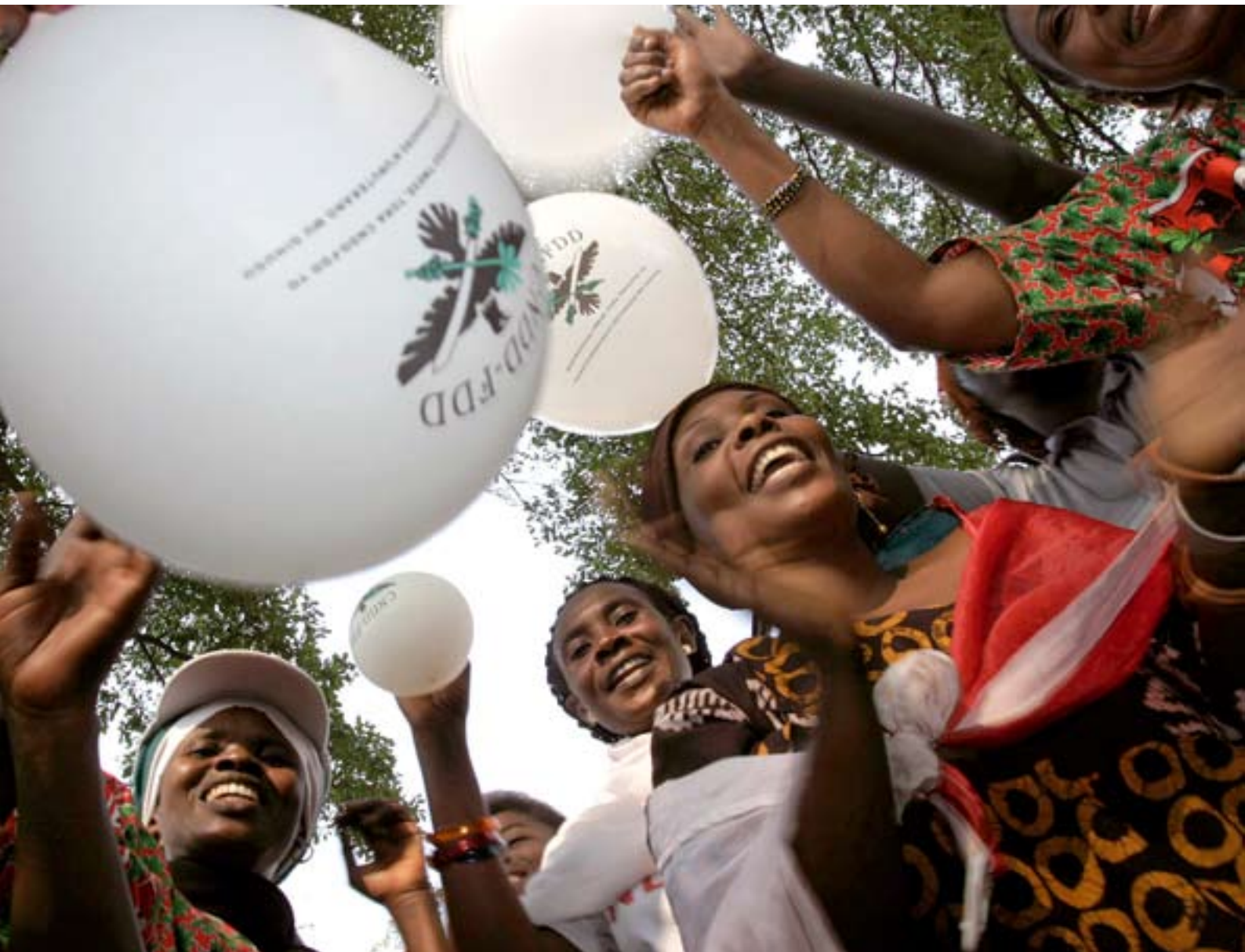
Voters in the streets of Bujumbura, Burundi, during the elections in 2005