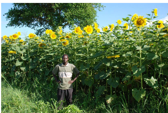
Field visit by participants

Follow-up included a DVD of the trip and a debriefing at Cordaid.