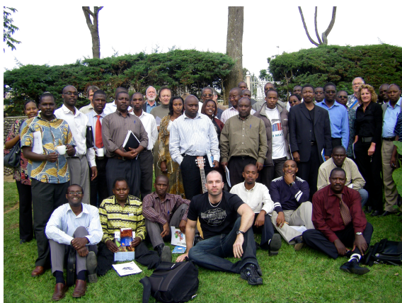
Participants of the kick-off workshop November 2008

ICCO, Agriterra and Terrafina took the initiative to join forces in their value chain, producer organisation and rural finance oriented programs in Rwanda early 2008. They requested the Agri-ProFocus support office to start a trajectory and explore the interest of other members in intensifying cooperation in Rwanda. Since then SNV, Oxfam Novib, KIT, WUR/VHL and IFDC have joined the coalition while ICCO has taken on overall coordination.