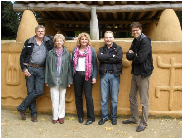
Team support office Agri-ProFocus 2008