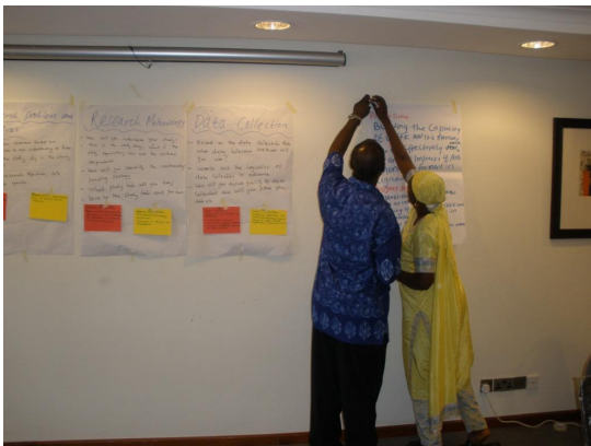
Participants of the workshop share their ideas on mainstreaming HIV/AIDS in their organisations

the POs are being funded by Agriterra and coaching and support are provided by Van Hall Larenstein and SCC. Agri-ProFocus is providing overall facilitative support. Lessons learned will be documented in 2009 and further developed in view of expanding the trajectory to include other POs.