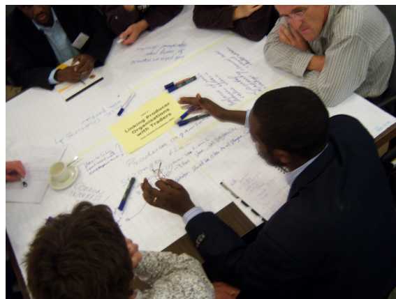
Professionals share their lessons learned and explore possible action in a 'world café' setting

opened and some critical knowledge gaps about the role and potential of traders were identified. Follow-up to the event is set out by way of a light-weight exchange network to apply lessons learned.