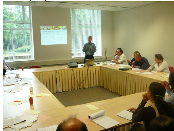
Presentation at expert meeting

As a follow-up on this event, EVD, ICCO and WUR-LEI developed a ' Contract Farming Checklist ' to give business investors insight into critical issues when dealing with contract farming in developing countries.