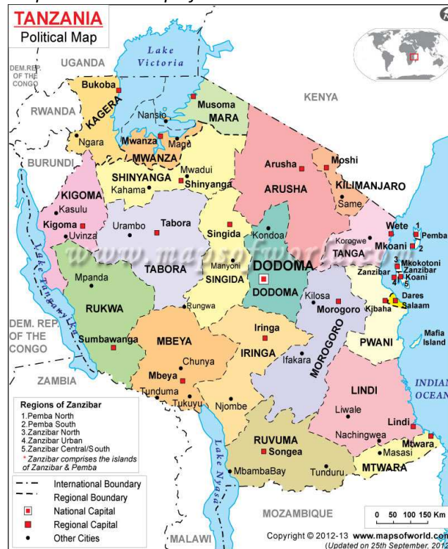
(Maps of the World 2012)

Within different Regions, the country has a variety of tribes, each with traditions and local languages.