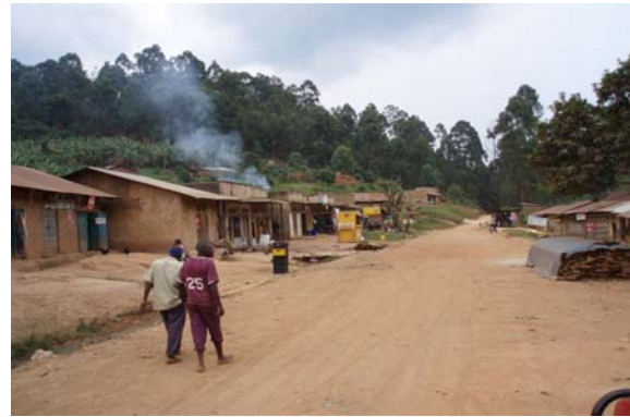
Town around Kisiizi

The study focused on the direct and indirect effects of Microcare's health-insurance scheme (i.e. its effect on medical expenditures and strategies to finance these expenditures), and found a positive association between the scheme and these indicators. Three practical recommendations can be offered as a result of this study. The limited availability of cash in households, especially in rural areas, may trigger informal loans and asset sales to finance the payment of premiums, transport costs or co-payments for consultations and treatment. To minimize informal loans and asset sales, it is therefore recommended that (1) micro-insurance schemes are restricted in charging co-payments beyond the level required to prevent moral hazard, (2) design tailor-made premium payment schedules that coincide with households' cash availability and (3) operate in conjunction with a micro-finance institution to facilitate the payment of premiums and/or encourage savings to cover future payments. The precise possibilities to implement these recommendations should be assessed in the context of the scheme(s) under consideration.