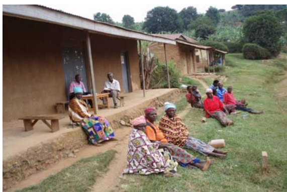
Microcare meeting in Kamoobwa

Although insured households use other strategies less often to finance medical expenditures, there are two reasons why health insurance is unlikely to make these other strategies completely redundant. First, Microcare's insurance policy covers a limited number of costs and excludes, for example, medication for chronic illnesses that may confront insured households with high recurring costs. This can