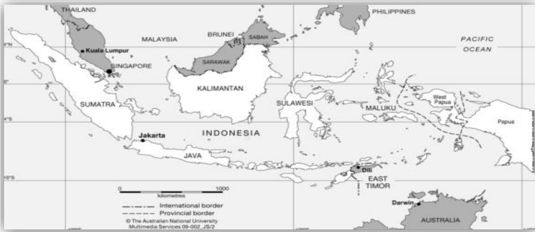
Figure1: Indonesia Map

Indonesia consists of 34 provinces, and four unique regions (Jakarta, Papua, Aceh, and Jogjakarta). Local governments have the authority to manage and are responsible for the provision and budgeting of public services, when the government of Indonesia began decentralization in 2001. The largest Province in Indonesia is Papua, placed in the east of Indonesia, and is bordered by Papua New Guinea (BPS-Indo 2016).