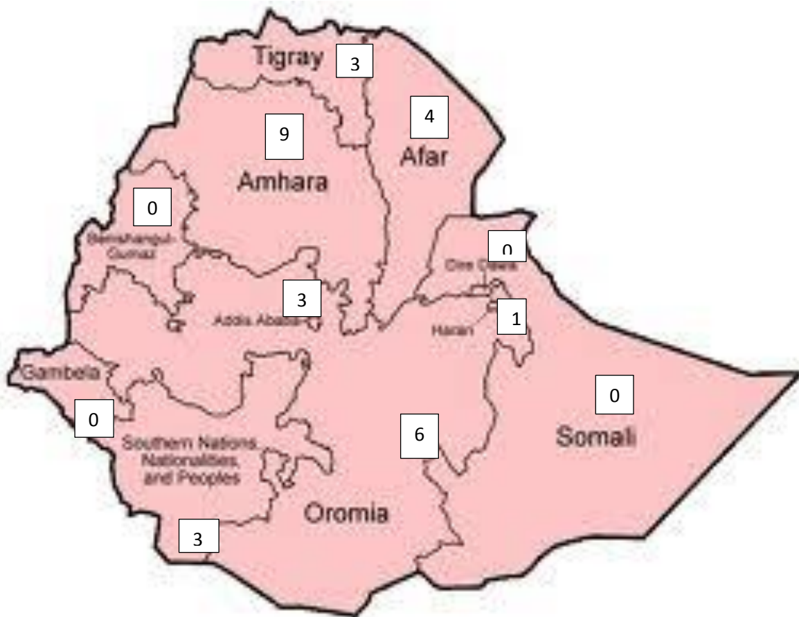
Figure 2. Distribution of literatures found by regions of Ethiopia

This chapter will summarize information obtained from Ethiopia which is related to factors influencing institutional delivery service utilization. The findings are grouped according to the adapted conceptual framework: governance and policy-related, individual and family related, community-related and health service related factors. SBAs or institutional/ health facility delivery service use are applied interchangeably as having SBAs at home is rare in Ethiopia. Of 40 of documents used for this literature review, only 11 were national based studies. There was no literature found on four regions, and as for the remaining regions the 29 literatures were not evenly distributed with the majority of them from Amhara and Oromiya, the two largest regions of the country. The regional distribution of the 29 literatures is illustrated in the following figure.