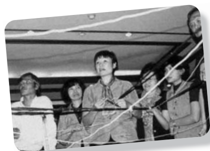
Playing the networking game at a DREAM-IT workshop