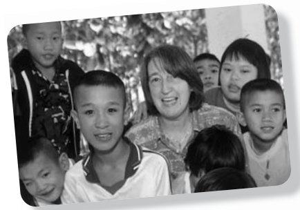
VSO Thailand Inclusive Education Advisor