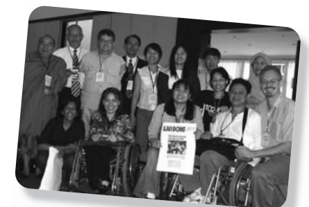
Disabled delegates and VSO staff at the ASEM People's Forum V, showing some of the press coverage generated about disability that week.

VSO and the 12 disabled participants then co-facilitated the workshop on the rights of people with disabilities. There were four presentations from representatives of different DPOs to share their experience of empowering people with disabilities in Thailand, Indonesia, and Europe and to discuss the new draft UN Convention on the rights of people with disabilities. These presentations were followed by group discussions, facilitated by the disabled participants. At the end of the workshop, the presentations, discussions and views collected on the postcards were combined into seven 'Calls for Action':