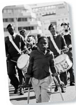
Marching for disability rights

When community-based rehabilitation (CBR) workers supported by VSO Kenya began household visits to identify disabled children, they were initially met with fear and distrust. Some families were afraid the CBR workers were going to take disabled children away – there was even a rumour that they planned to sacrifice the children. It took repeated visits to persuade families to acknowledge that they had a disabled child, often hidden away in a back room.