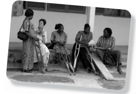
Women DPO representatives with VSO Ghana volunteer and Programme Manager