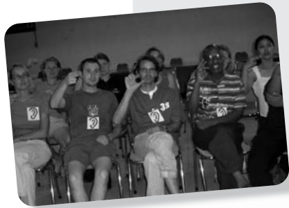
VSO Indonesia sensitisation sessions

'For me, the disability session really opened my mind. Before attending the session, I only knew a little bit about disabilities, but the session made me think a lot more about the feelings of people with disabilities. The simulation exercise was really interesting for me. I used crutches, and just simple things like getting myself a cup of coffee became really difficult.'