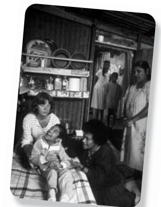
CBR worker making a home visit

People with impairments may look or behave differently from other people. Although everyone looks different, most cultures have a model of 'normal' appearance and behaviour, reinforced through images in art and the media, and this can create unease when interacting with people who are different from this 'normal' model.