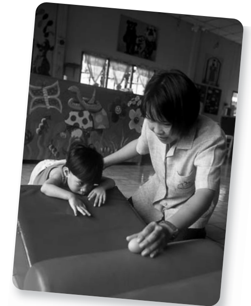
Play activities for a disabled child at the Foundation for Child Development, a VSO Thailand partner

For example, if you want to carry out an initial assessment of the situation of disabled people in your programme area, include a workshop to share your findings and plan the next steps, and time and budget to support these plans. If you are providing disability equality training,