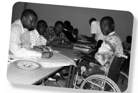
Participants at a VSO Namibia consultation workshop for young people with disabilities

During annual joint reviews with each partner in the HIV & AIDS programme, VSO Bangladesh asks a set of standard questions about what the organisation is doing to promote the inclusion of people living with HIV & AIDS, and what activities and systems are in place to mainstream HIV & AIDS across the organisation. The review process also includes specific questions about the roles of women and men in organisational decision-making and how the partner considers the different situations of women and men both in its programmes and within the organisation. Although this example relates to gender and HIV & AIDS, the same approach could be used with disability.