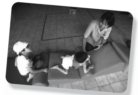
Play activities for disabled children at the Foundation for Child Development, a VSO Thailand partner

When consulted on volunteer placements, teachers always identified the assessment and categorisation of children as a need. They expected the volunteer to be an expert who would support them to develop activities for the individual child rather than for the whole class.