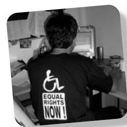
Mug and t-shirt from VSO Indonesia