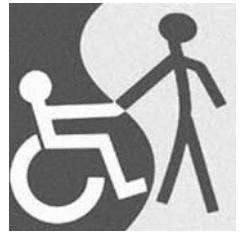
NCPEDP's disability-friendly corporate logo

Another way to create wider engagement with disability issues is to identify, publicise and build on positive actions by non-disability actors. For example, NCPEDP, one of VSO India's DPO partners, runs an employment scheme, developing partnerships with companies to help them to employ disabled people. ( http://ncpedp.org/employ/em-home.htm ). As part of this programme, NCPEDP gives awards to companies that employ disabled people on an equitable basis. The award ceremony is publicised through the press, and the companies are awarded the right to use a disability friendly corporate logo.