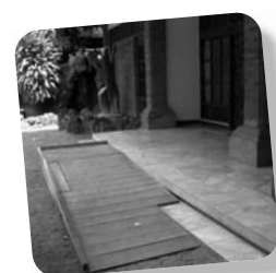
Examples of adjustments made by VSO Indonesia