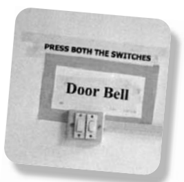
Examples of adjustments made by VSO India