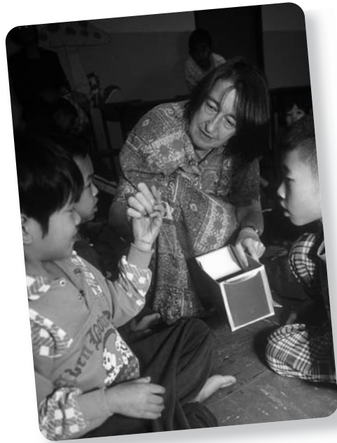
Box System, VSO Thailand