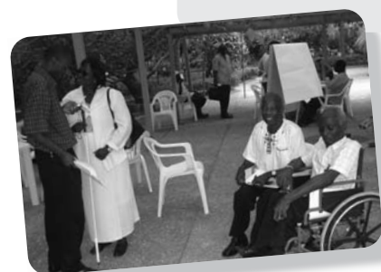
VSO Ghana programme area workshop

Membership is on a voluntary basis and no per diem will be paid. VSO will pay all expenses relating to attending the meeting i.e. travel, accommodation, subsistence and assistance.