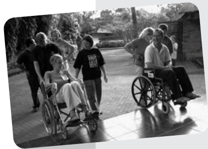
VSO Indonesia sensitisation sessions

The Disability Programme Manager facilitated the session. The cost of the session was the photocopying of the booklets provided. Equipment (wheelchairs, crutches, blindfolds, scarves, etc) were borrowed or improvised.