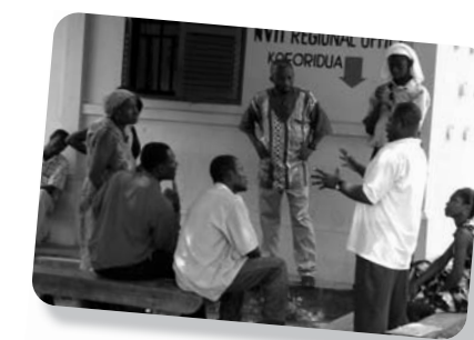
District and regional committee members of the Ghana National Association of the Deaf

This can involve challenging discrimination within DPOs. For example, one disability programme manager informed the women members of a DPO of their rights (under the DPO's