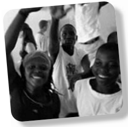
Students at Mampong STS for the Deaf practising for Protect Yourself

One of the main challenges was to find the right balance between a high technical standard, and a user-friendly tool for future facilitators and educators, while working to a tight deadline. It was realised that it was impossible for the video to serve all purposes – focus was required to narrow down to a few key messages.