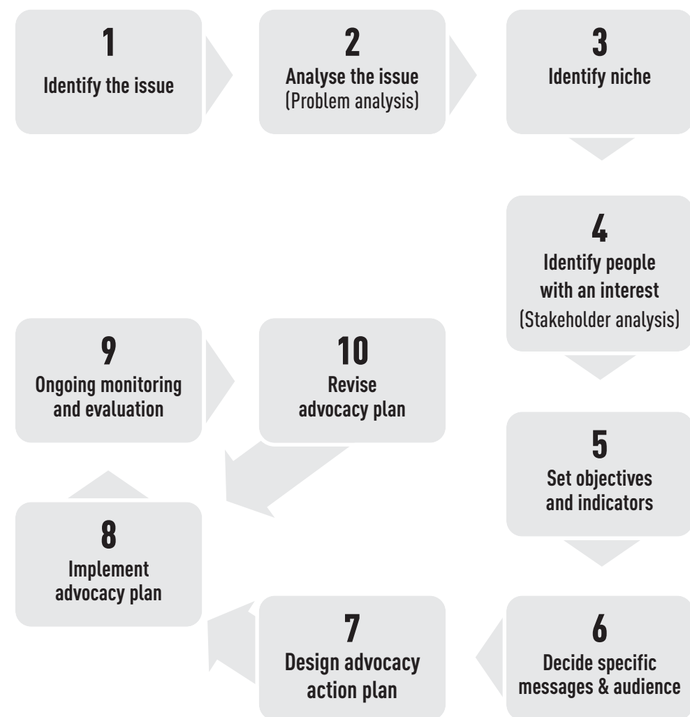
Figure 3: VSO's advocacy cycle

The experience of VSO volunteers and staff supporting partner advocacy (not just in disability) suggests the following process: