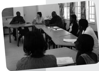
Consultation workshop for young people with disabilities in Outapi

VSO volunteers conducted initial needs assessments with young disabled people in four regions of Namibia (Omusati, Oshana, Oshikoto and Ohangwena) between April and June 2005. Since VSO Namibia's partner DPOs do not have well established branches in the regions, the needs assessment process was a series of eight consultation workshops with young people with a range of impairments. It was the first time many of the participants had ever attended a workshop.