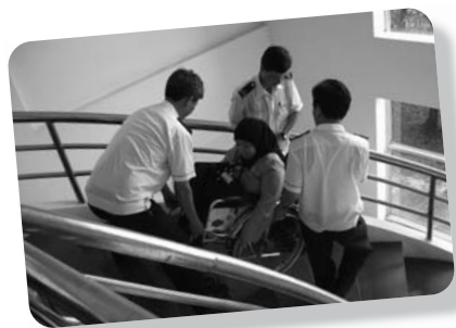
The president of a VSO Indonesia disability partner is carried up the stairs to attend one of the forum's plenary sessions

Although the organising committees did try to accommodate the need of the delegates once they arrived, it appeared that there was insufficient advance planning of how to make the forum accessible.