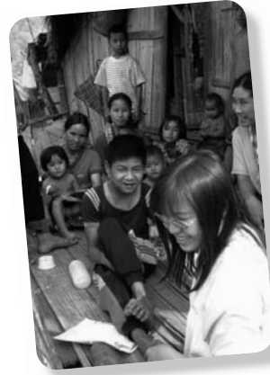
CBR in Thailand

Community-based rehabilitation (CBR) can be a useful vehicle for making practical links with mainstream service providers and engaging the wider community in thinking about disability. For example, VSO Papua New Guinea volunteers working in CBR programmes have been able to strengthen referral services to hospitals, and to increase community engagement with disabled people (see Chapter 2 for more details).