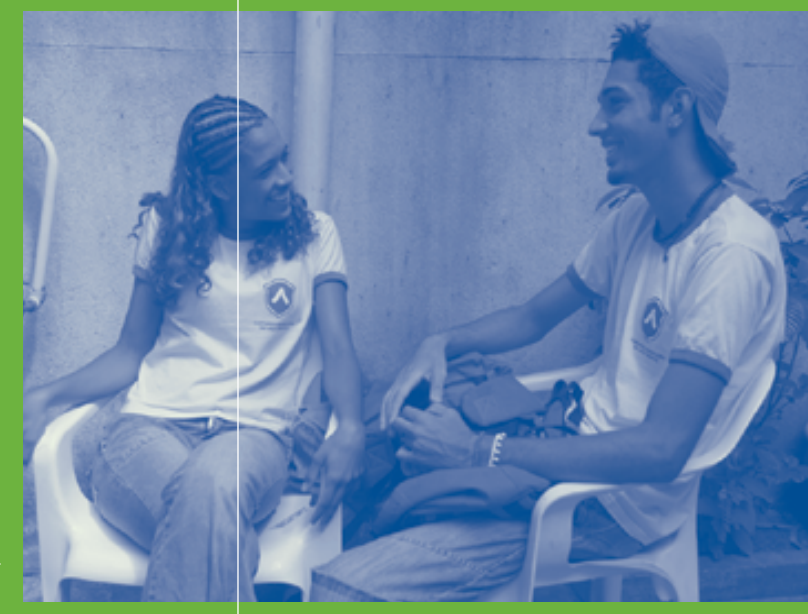
A recording session for the soap opera