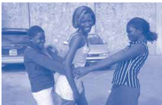
Two HIV-positive adolescents fooling around with a researcher

and 2) embrace vital elements of sexuality for young people living with HIV. In order to be effective, interventions will need to address the sexual desires and dreams of young people living with HIV and engage different agencies and groups working with them. Unfortunately, none of the current programmes in Uganda have adequately incorporated these issues. However, TASO, Population Council and World Population Foundation are currently developing