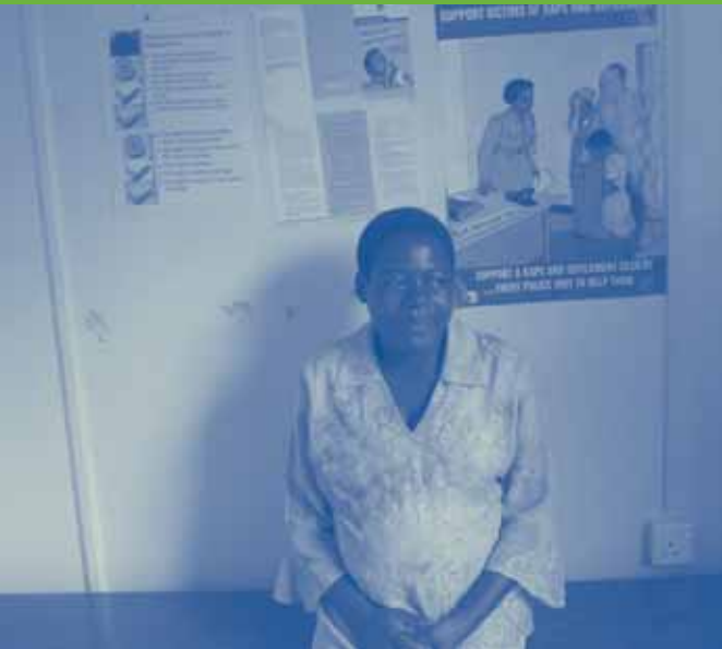
A TASO client, aged 19, who recently gave birth