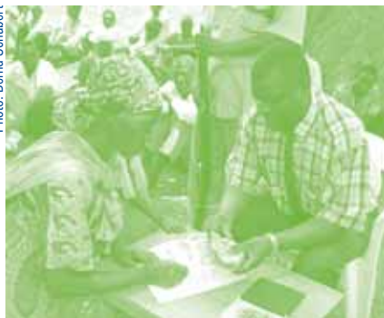
A grandmother with a grandchild on her back receiving cash through a cash transfer scheme in Mchinji District, Malawi