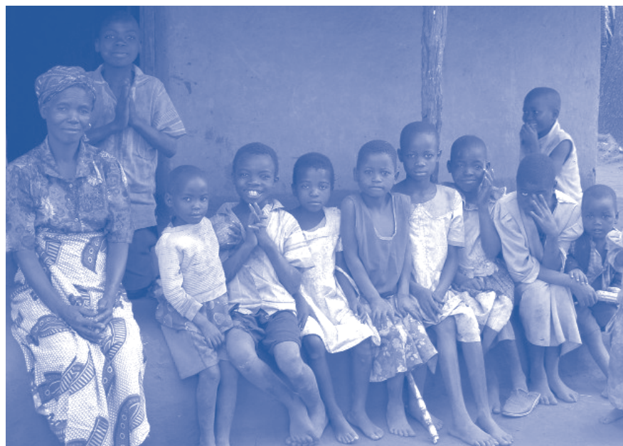
Grandmother in Mchinji District, Malawi, taking care of her orphaned grandchildren

The key question is: do social cash transfer schemes in countries with high HIV and AIDS prevalence that target a broad spectrum of (extremely) poor households,