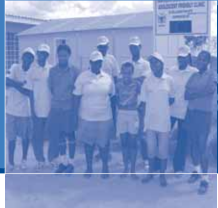
Reaching the youth through adolescent-friendly clinics in Namibia p.14