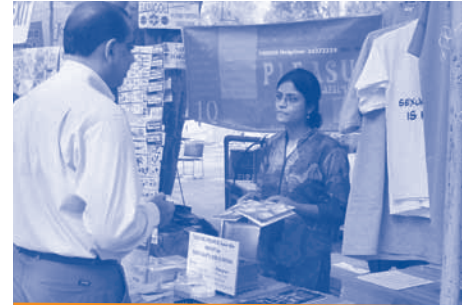
TARSHI stall displaying IEC material at a fair in New Delhi.

While these opportunities exist at the policy level, there is also a perception of very real threats amongst those working on sexuality issues. The challenges that need to be addressed include patriarchal, conservative mindsets and lack of