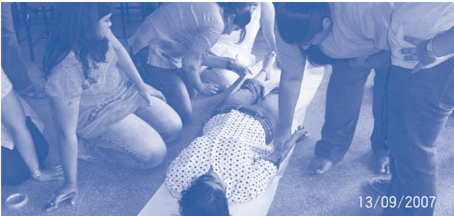
Participants in a body mapping exercise used to make sexual and reproductive body parts familiar and easier to discuss in a group setting

Expanding reproductive health services to better address sexuality and sexual health issues is a challenge in many countries. There is still little evidence for the most effective duration, content and follow-up of training of various cadres of health staff in counselling on sexuality and on how to sustain good quality counselling alongside sexual and reproductive health services. This article is based on a study titled: Assessing the conditions and quality of counselling related to sexuality and sexual health: A review of the TARSHI helpline. The author did the study on behalf of the Royal Tropical Institute (KIT) in 2007.