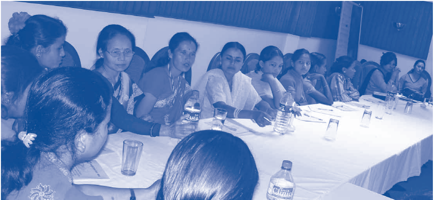
Leadership training for female sex workers.

Women and children face many problems in the gradually developing country of Nepal. Community Action Centre – Nepal (CAC-Nepal), a non-profit, non-governmental social organisation, was established in 1993 by a group of intellectuals, social workers, and community development workers to respond to the need for additional people’s efforts to overcome these challenges.