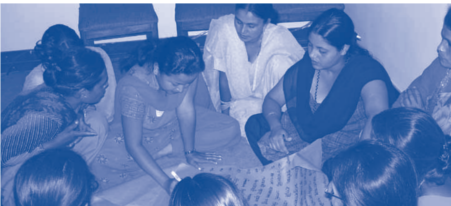
A female sex worker empowerment session.

Correspondence Community Action Centre - Nepal (CAC-Nepal) Kathmandu Head Office/ Drop-in-Centre, Jamal Kathmandu Tel: + 977 1 4245249/240 Fax: + 977 1 4370-999 E-mail: kathmandu@cac-nepal.org.np www.cac-nepal.org.np