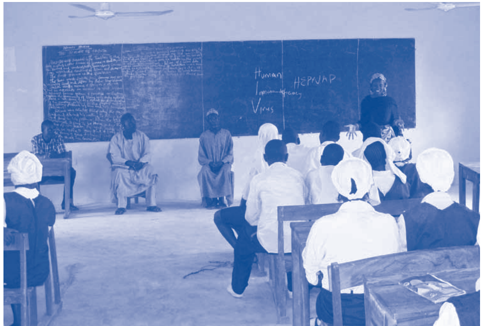
Advocacy to a Christian religious group in North Central Nigeria.

Some parts of southern Africa have also witnessed some mythical promoters of