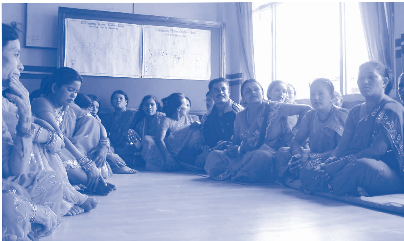
Community mobilisers discuss safer sex.

Some female sex workers are caught up in such work because of poverty. In order to mitigate this, CAC-Nepal has initiated various income-generating programmes. However, there are many relapses, as the income generated through these programmes could hardly meet their needs compared to what they potentially earn through sex work. FSWs are also a hidden population and quite mobile. Due to this, it becomes difficult to find them, track them, and give the care and services they require.