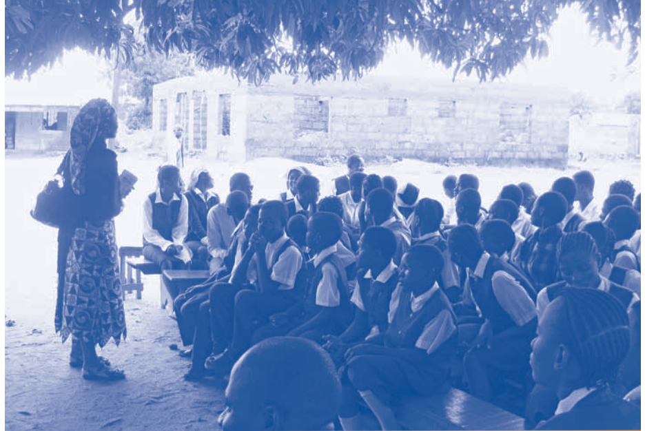
School HIV and AIDS sensitisation session.

Various factors have been associated with the high prevalence of these relationships in Nigeria and other countries in sub-Saharan Africa. A focus group of adolescent girls in a study conducted in Zimbabwe identified that over two-thirds of their peers were dating much older men. They claimed to be motivated by intentions to get married, attaining higher social standing, money, favour and material support 3 . Though intergenerational sex has been practised for years, it has become a reason for great