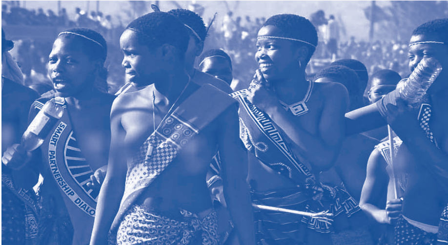
Swazi girls in a traditional ceremony.