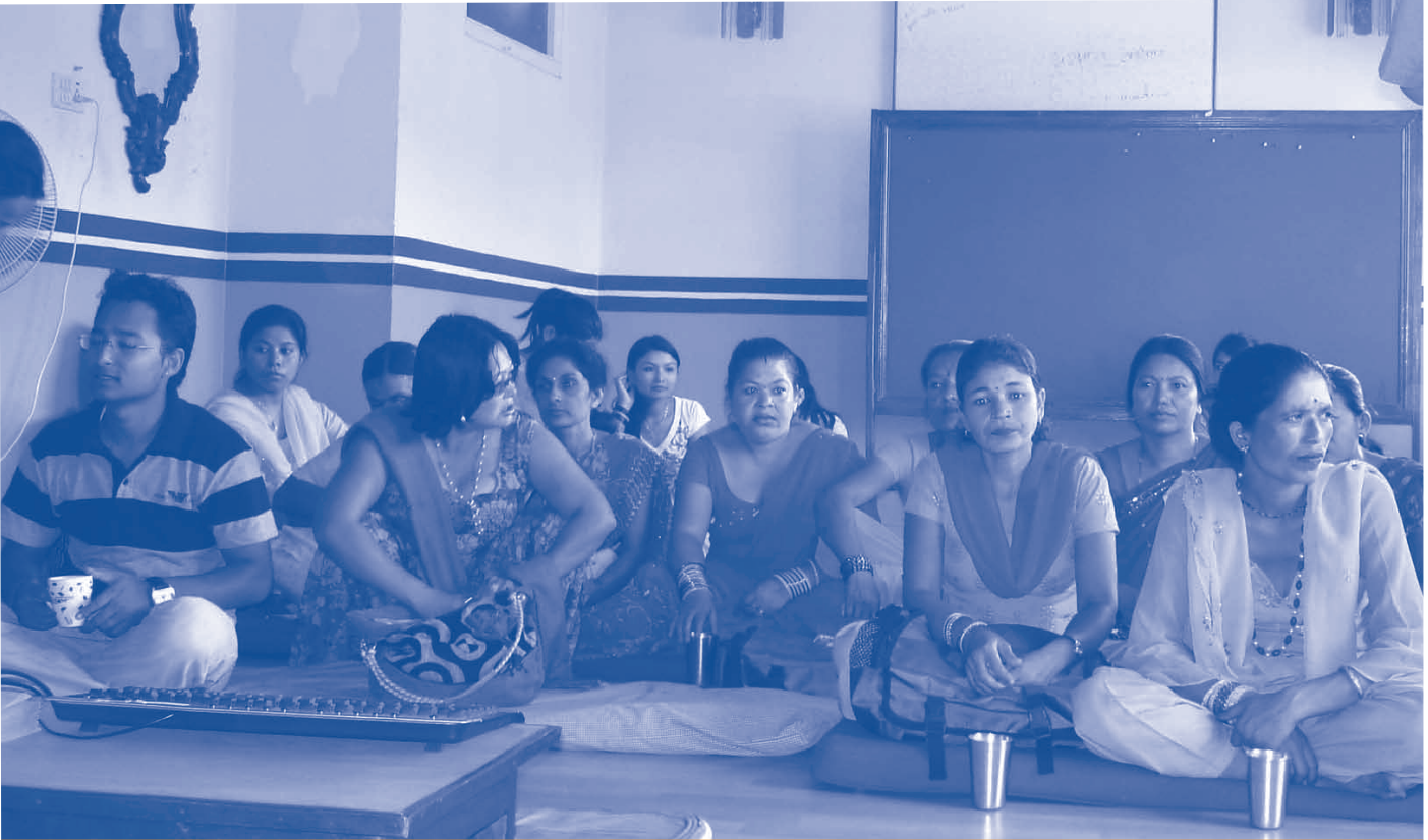
Training on stigma and discrimination.