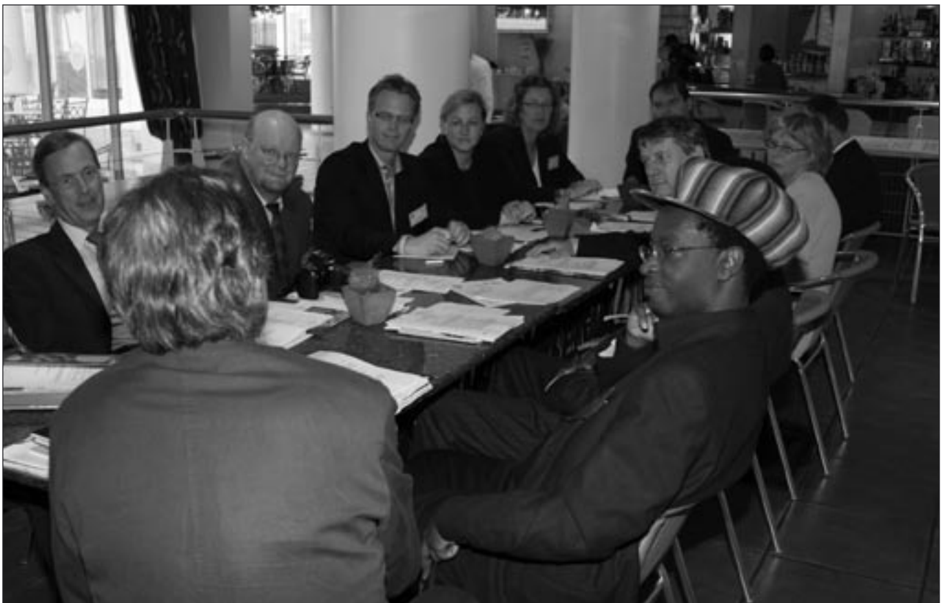
European working group

Finally, we recommend the European participants to send the Cape Town Declaration to their respective governments/the European Union and ask them to give a special priority to Orphaned and Vulnerable Children by AIDS in Africa at the upcoming UN special session on the Millennium Development Declaration and Goals in September 2005.