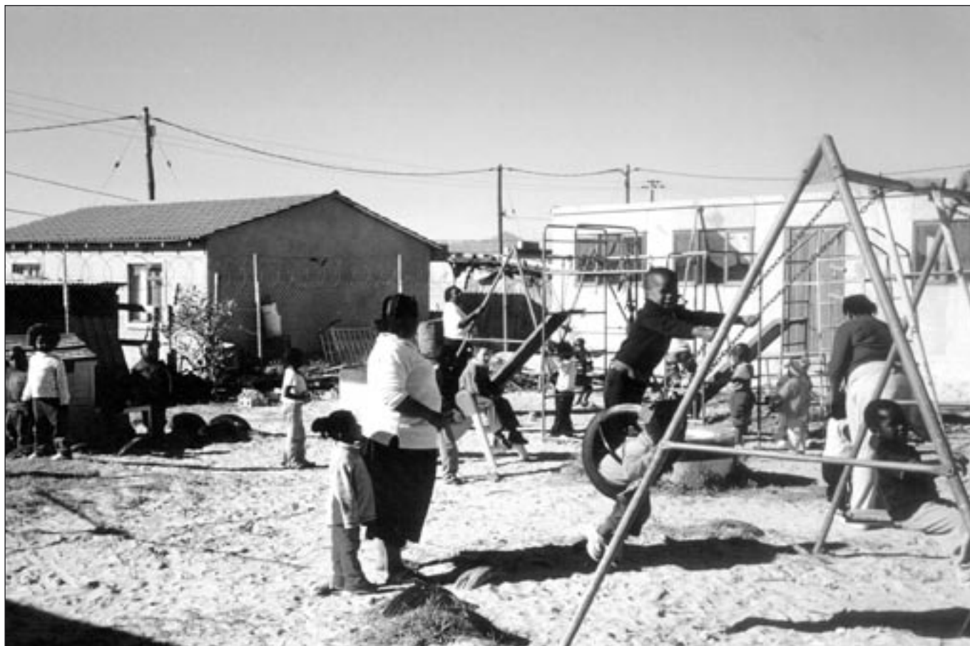
Crèche for HIV/AIDS affected children, Lizo Nobanda Institute, Khayelitsha