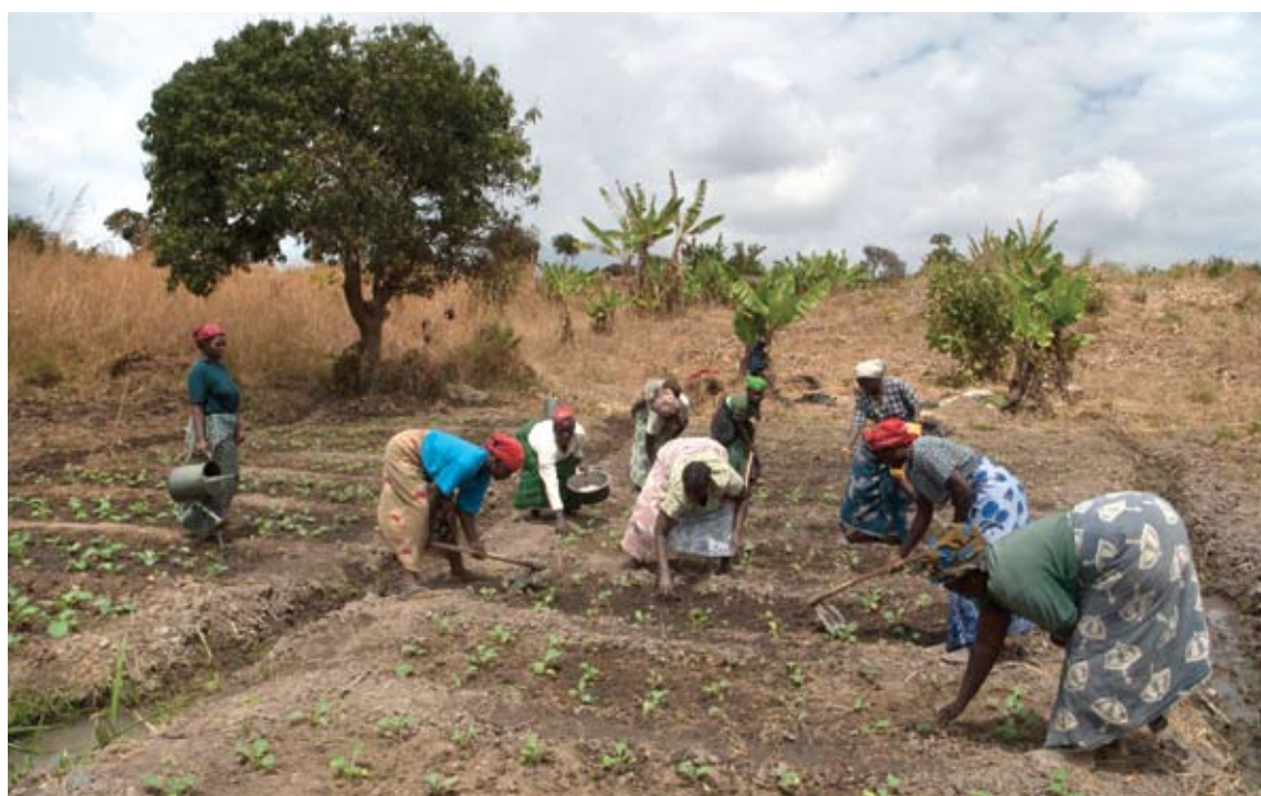
Women smallholder farmers in Chiranyama village, Rumphi District, Malawi.